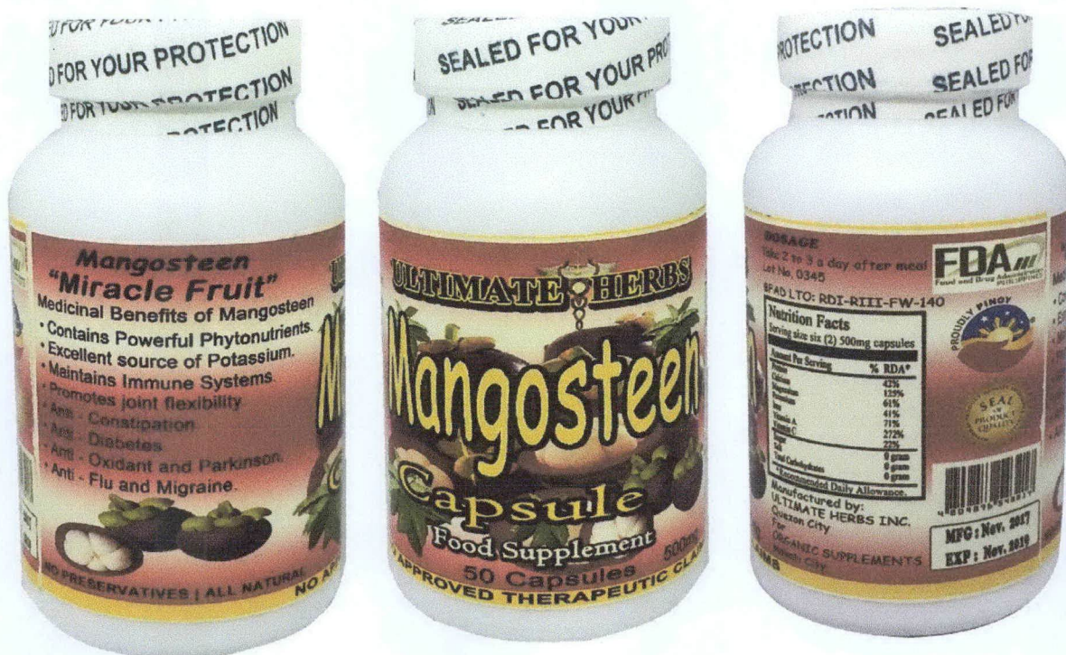
Figure 3. Unregistered ULTIMATE HERBS Mangosteen Capsule Food Supplement