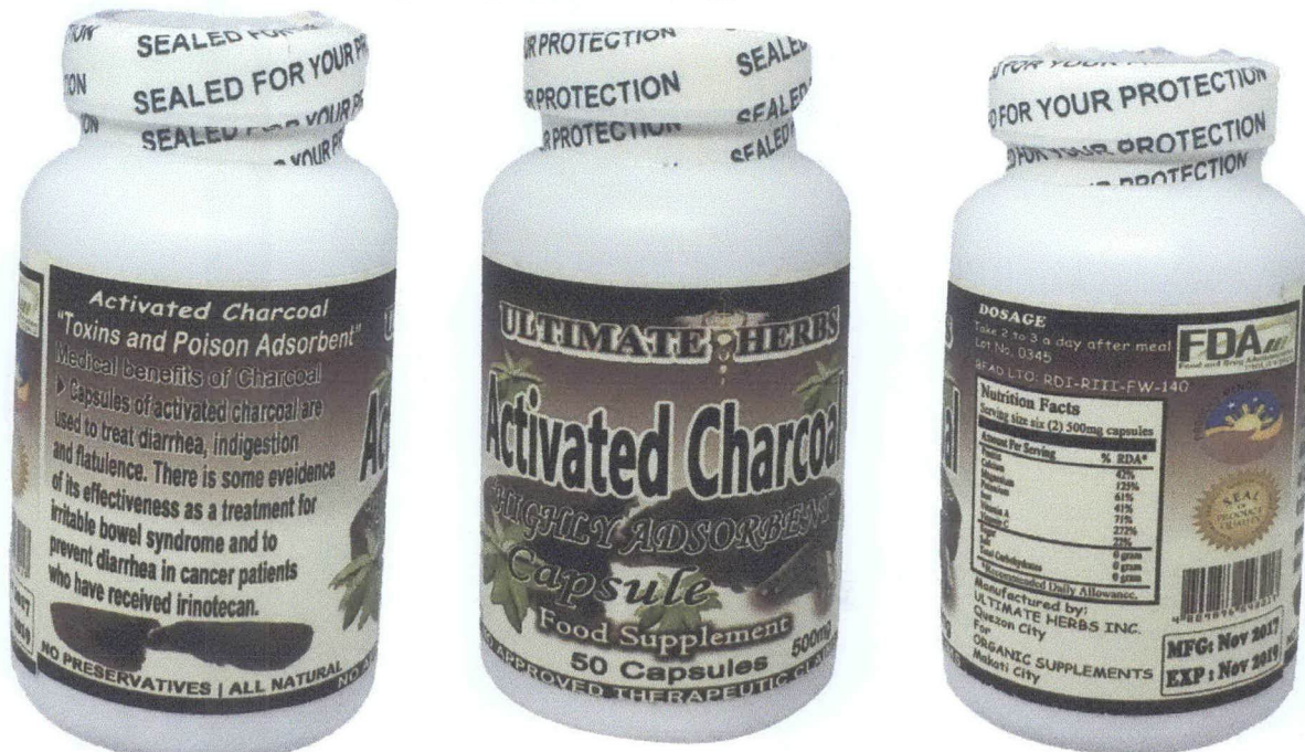
Figure 1. Unregistered ULTIMATE HERBS Activated Charcoal Capsule Food Supplement

The Food and Drug Administration (FDA) advises the public against the purchase and consumption of the following unregistered food supplements: