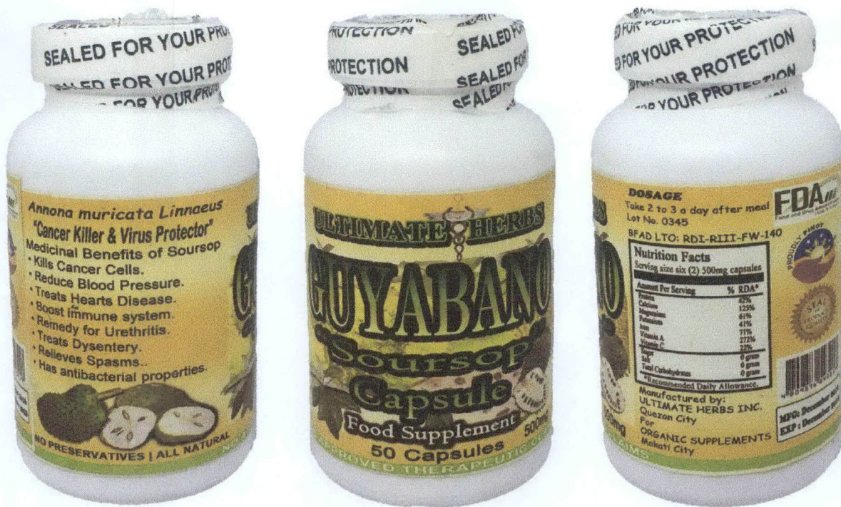
Figure 2. Unregistered ULTIMATE HERBS Guyavano “Soursop” Capsule Food Supplement