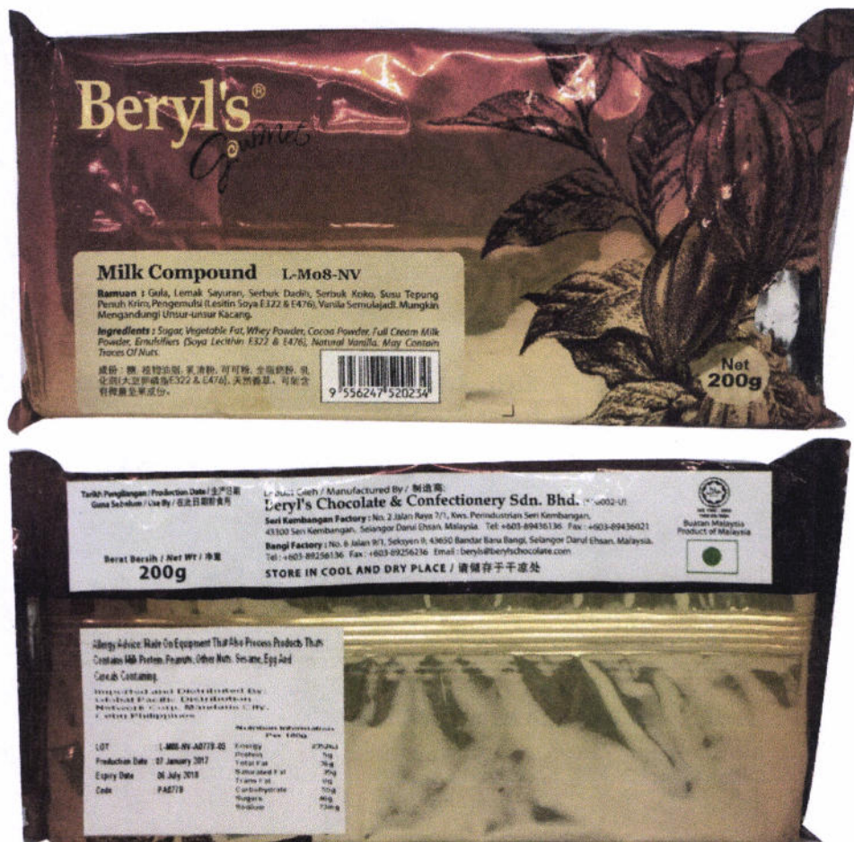
Figure 1. Registered BERYL'S GOURMET Milk Compound

The Food and Drug Administration (FDA) informs the public that the advisory on the product " BERYL'S GOURMET Milk Compound " under FDA Advisory No. 2018-211 dated 28 June 2018 is hereby lifted pursuant to the compliance of the market authorization holder to the existing laws, rules, and regulations of this Office.