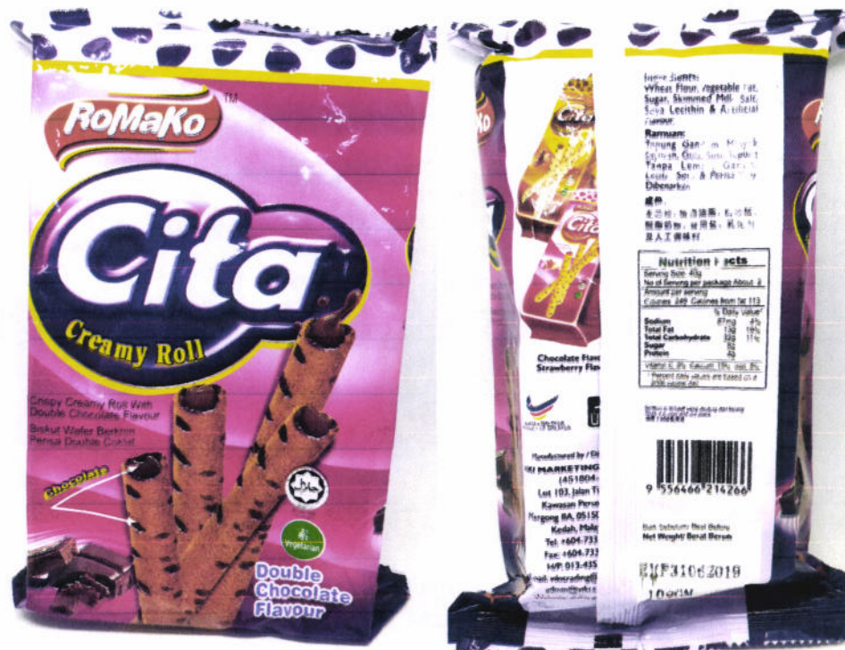
Figure 3. Unregistered ROMAko CITA Creamy Roll Crispy Creamy Roll with Double Chocolate Flavour