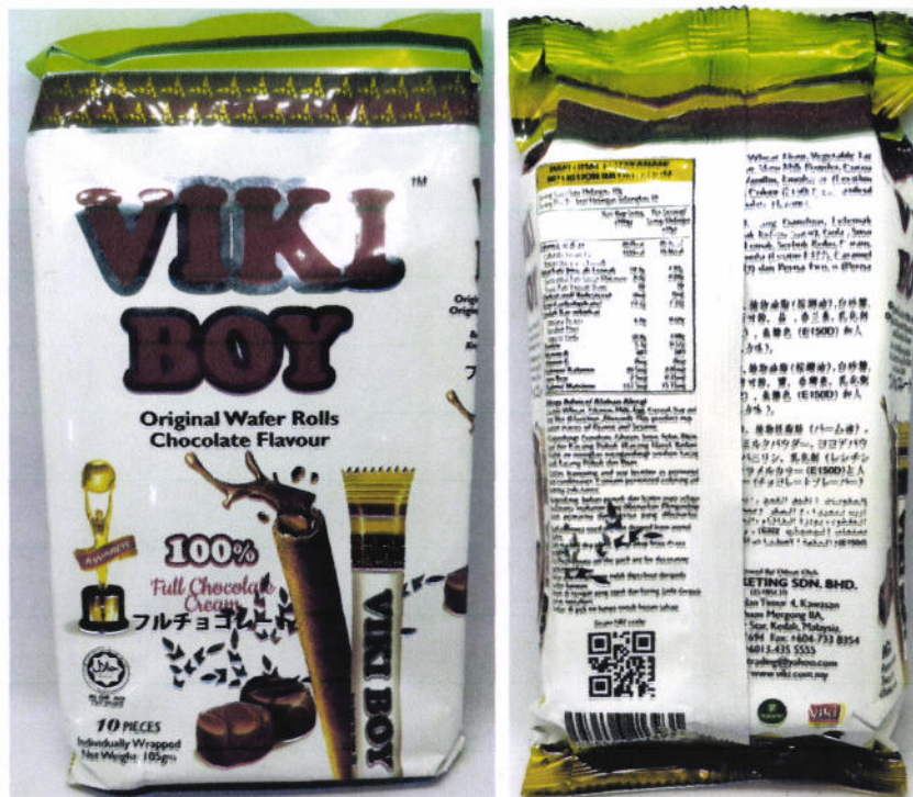
Figure 2. Unregistered VIKI BOY Original Wafer Rolls Chocolate Flavour 10% Full Chocolate Cream