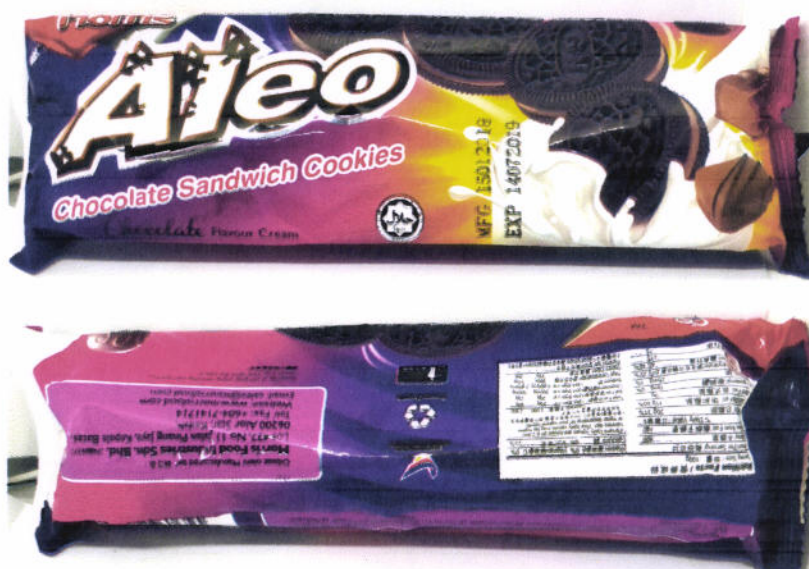
Figure 1. Unregistered MORRIS ALEO Chocolate Sandwich Cookies Chocolate Flavour Cream

The Food and Drug Administration (FDA) advises the public against the purchase and consumption of the following unregistered food products: