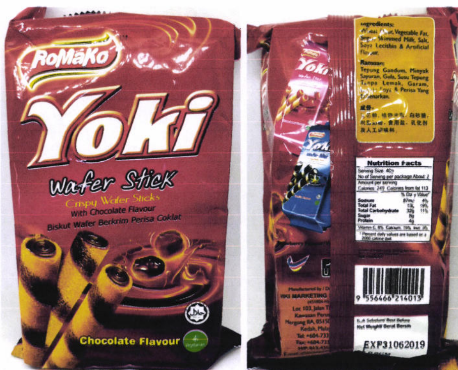
Figure 5. Unregistered ROMAKO YOKI Wafer Stick Crispy Wafer Sticks with Chocolate Flavour

FDA post-marketing surveillance (PMS) activities have verified that the abovementioned food products have not gone through the registration process of the agency and have not been issued the proper authorization in the form of Certificate of Product Registration. Pursuant to Republic Act No. 9711, otherwise known as the "Food and Drug Administration Act of 2009", the manufacture, importation, exportation, sale, offering for sale, distribution, transfer, non-consumer