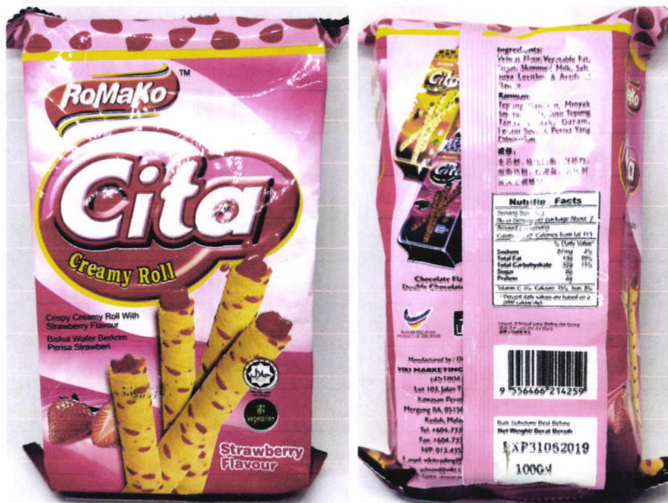
Figure 4. Unregistered ROMAKO CITA Creamy Roll Crispy Creamy Roll with Strawberry Flavour