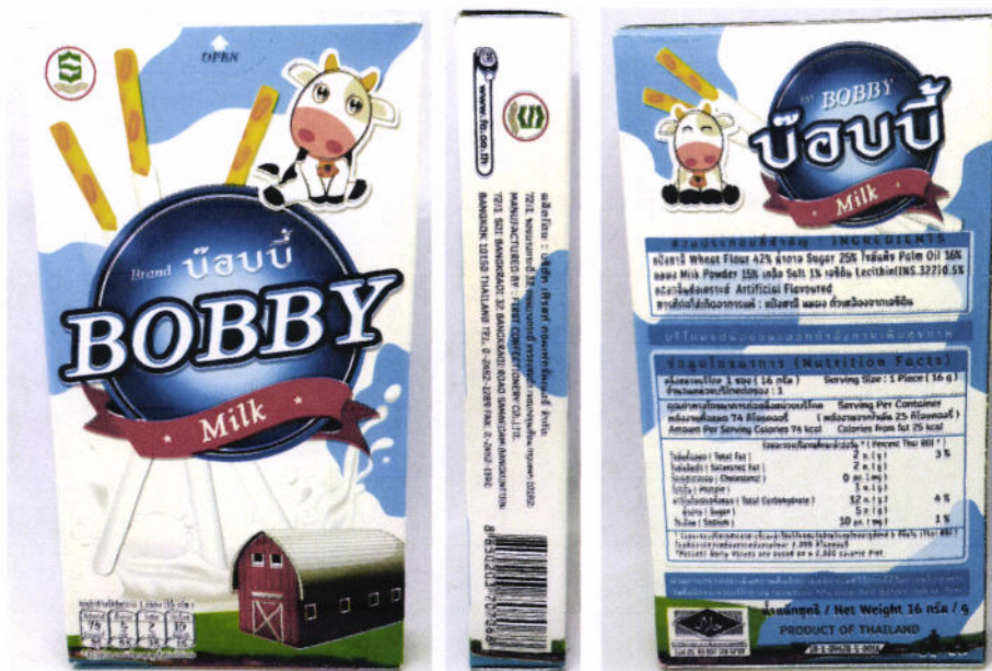
Figure 4. Unregistered BOBBY Milk Flavoured Cream Coated Biscuit