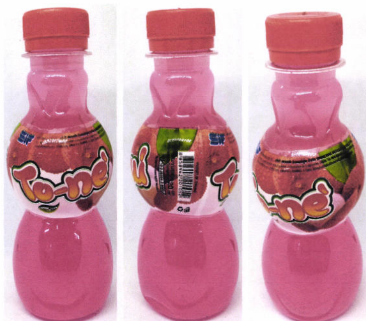
Figure 5. Unregistered TO-NE Lychee Juice 15%

FDA post-marketing surveillance (PMS) activities have verified that the abovementioned food products have not gone through the registration process of the agency and have not been issued the proper authorization in the form of Certificate of Product Registration. Pursuant to Republic Act No. 9711, otherwise known as the “Food and Drug Administration Act of 2009”, the manufacture, importation, exportation, sale, offering for sale, distribution, transfer, non-consumer use, promotion, advertising or sponsorship of health products without the proper authorization from FDA is prohibited.