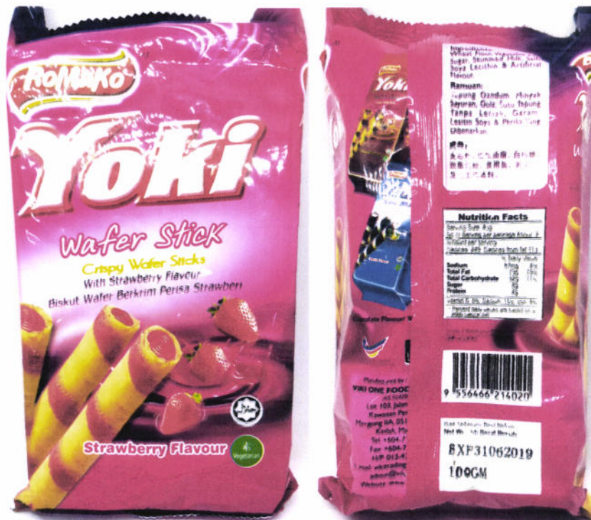
Figure 1. Unregistered ROMAKO YOKI Wafer Stick Crispy Wafer Sticks with Strawberry Flavour

The Food and Drug Administration (FDA) advises the public against the purchase and consumption of the following unregistered food products: