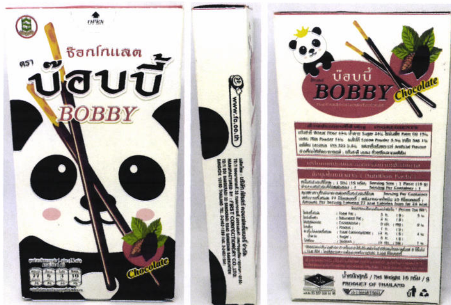
Figure 3. Unregistered BOBBY Chocolate Flavoured Cream Coated Biscuit (Red White Box)