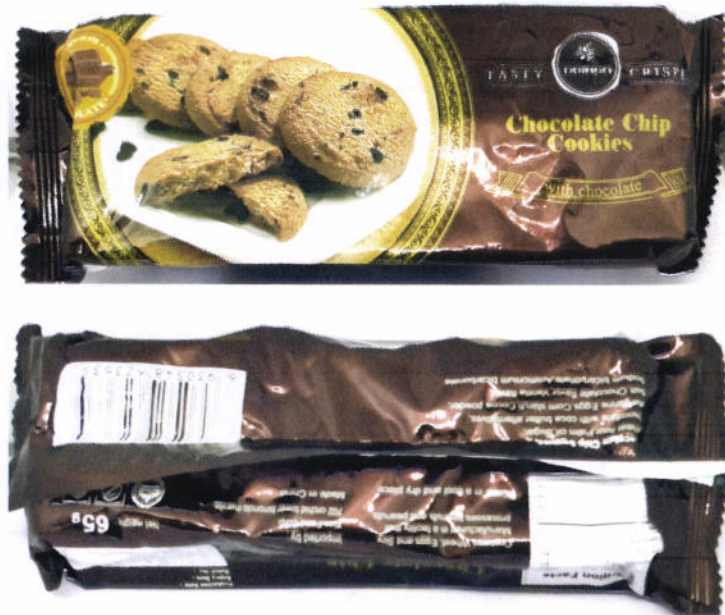
Figure 2. Unregistered DRINGO Chocolate Chip Cookies with Chocolate