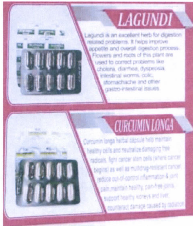
Figure 2. Unregistered MG Lagundi Capsule and MG Curcumin Longa Capsule with Misleading Advertisement and Promotion