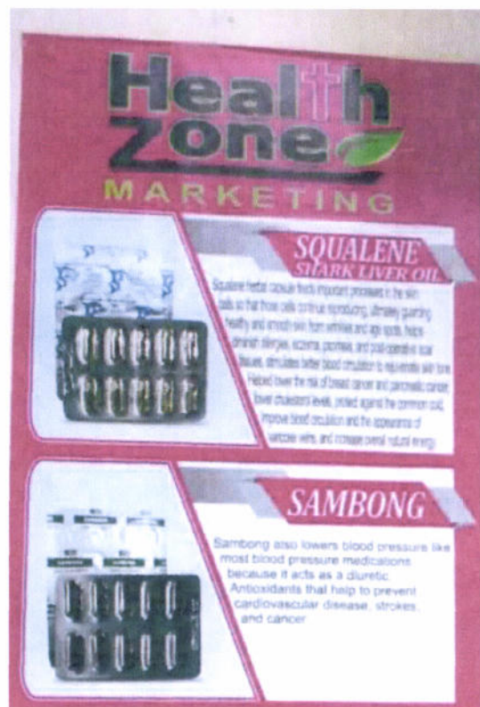
Figure 1. Unregistered MG SQUALENE Shark Liver Oil and MG Sambong Capsule with Misleading Advertisement and Promotion

The Food and Drug Administration (FDA) warns the public against HEALTH ZONE MARKETING for selling the following unregistered food supplements with therapeutic claims on their brochure: