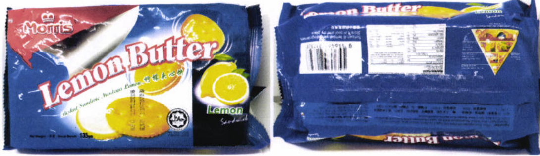
Figure 2. Unregistered MORRIS Lemon Butter Lemon Sandwich