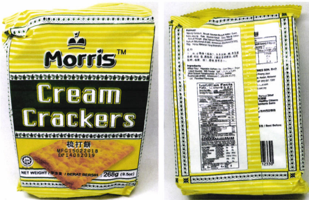
Figure 4. Unregistered MORRIS Cream Crackers