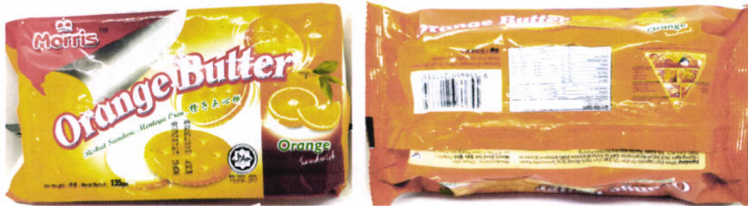
Figure 3. Unregistered MORRIS Orange Butter Orange Sandwich