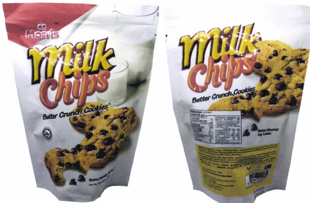
Figure 1. Unregistered MORRIS Milk Chips Butter Crunch Cookies

The Food and Drug Administration (FDA) advises the public against the purchase and consumption of the following unregistered food products: