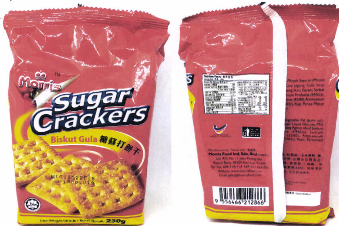
Figure 5. Unregistered MORRIS Sugar Crackers

FDA post-marketing surveillance (PMS) activities have verified that the abovementioned food products have not gone through the registration process of the agency and have not been issued the proper authorization in the form of Certificate of Product Registration. Pursuant to Republic Act No. 9711, otherwise known as the “Food and Drug Administration Act of 2009”, the manufacture, importation, exportation, sale, offering for sale, distribution, transfer, non-consumer use, promotion, advertising or sponsorship of health products without the proper authorization from FDA is prohibited.