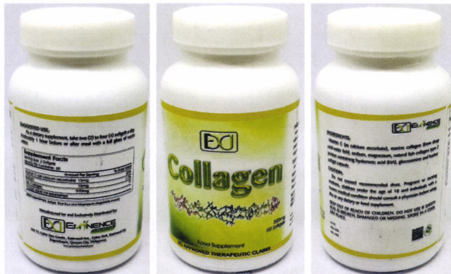
Figure 5. Unregistered COLLAGEN 500mg

FDA post-marketing surveillance (PMS) activities have verified that the abovementioned food product and food supplements have not gone through the registration process of the agency and have not been issued the proper authorization in the form of Certificate of Product Registration. Pursuant to Republic Act No. 9711, otherwise known as the “Food and Drug Administration Act of 2009”, the manufacture, importation, exportation, sale, offering for sale, distribution, transfer, non-consumer use, promotion, advertising or sponsorship of health products without the proper authorization from FDA is prohibited.