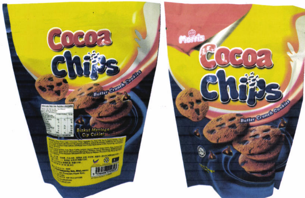
Figure 1. Unregistered MORRIS Cocoa Chips Butter Crunch Cookies

The Food and Drug Administration (FDA) advises the public against the purchase and consumption of the following unregistered food product and food supplements: