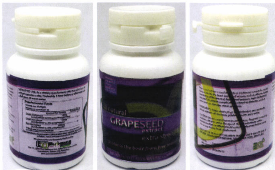
Figure 3. Unregistered All Natural Grapeseed Extract Extra Strength