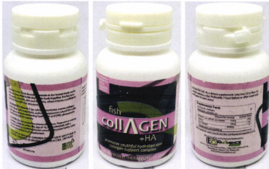
Figure 4. Unregistered FISH COLLAGEN + HA