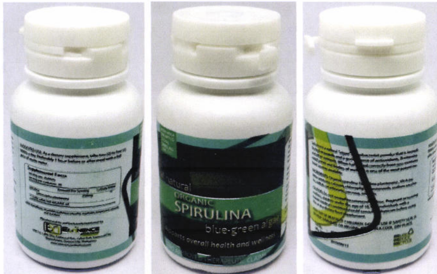
Figure 2. Unregistered All Natural Organic Spirulina Blue-Green Algae