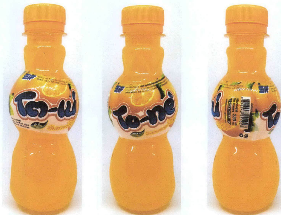
Figure 3. Unregistered TO-NE Orange Juice 15%