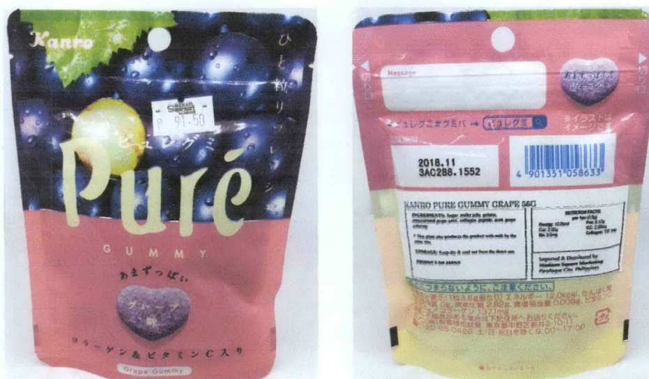
Figure 4. Unregistered KANRO PURE Gummy Grape