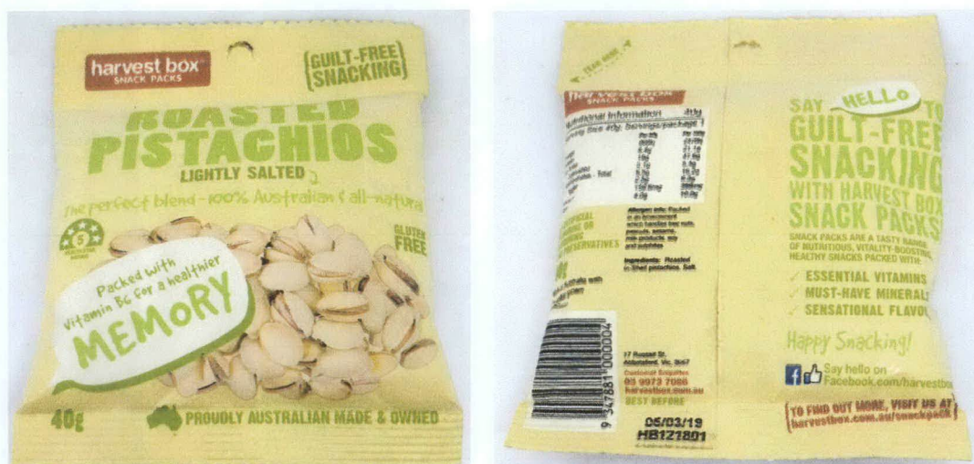
Figure 5. Unregistered HARVEST BOX Roasted Pistachios Lightly Salted

FDA post-marketing surveillance (PMS) activities have verified that the abovementioned food products have not gone through the registration process of the agency and have not been issued the proper authorization in the form of Certificate of Product Registration. Pursuant to Republic Act No. 9711, otherwise known as the "Food and Drug Administration Act of 2009", the manufacture, importation, exportation, sale, offering for sale, distribution, transfer, non-consumer use, promotion, advertising or sponsorship of health products without the proper authorization from FDA is prohibited.