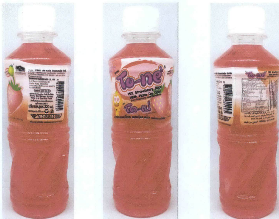
Figure 2. Unregistered TO-NE' 15% Strawberry Juice with Neta de Coco