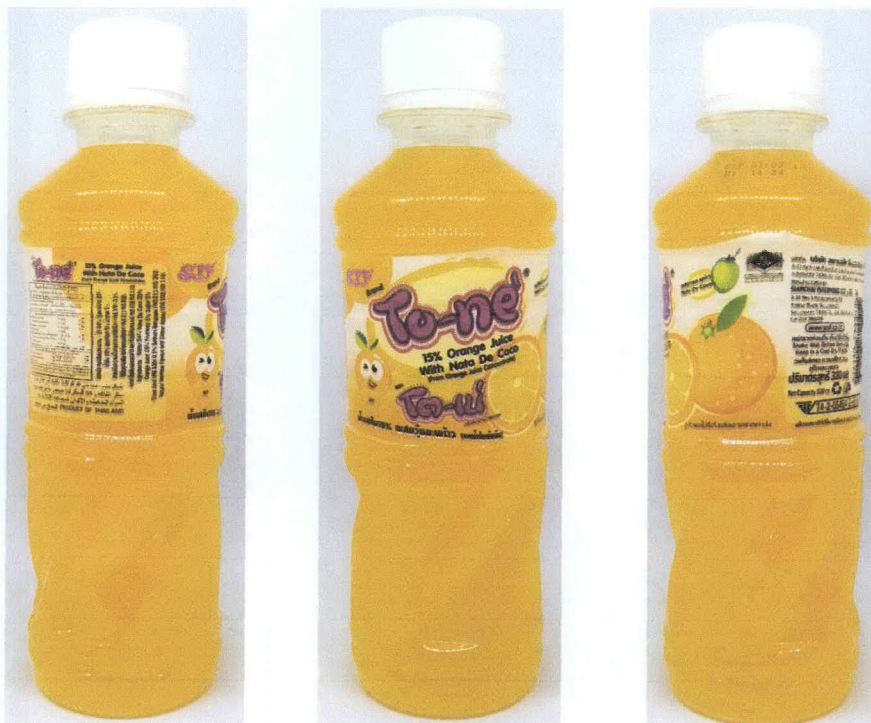
Figure 1. Unregistered TO-NE' 15% Orange Juice with Nata de Coco

The Food and Drug Administration (FDA) advises the public against the purchase and consumption of the following unregistered food products: