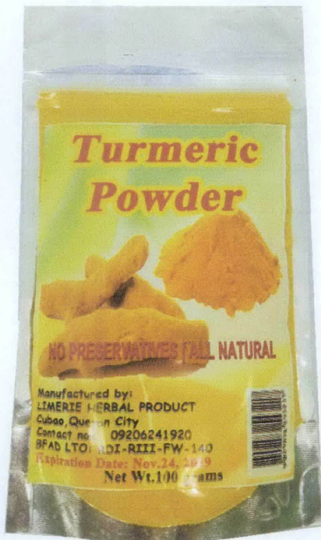
Figure 4. Unregistered Turmeric Powder