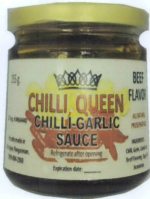
Figure 2. Unregistered CHILLI QUEEN Chilli-Garlic Sauce