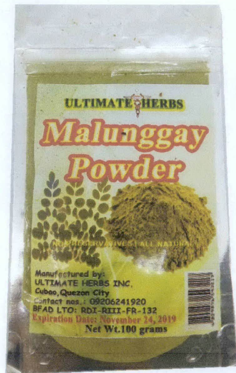
Figure 5. Unregistered ULTIMATE HERBS Malunggay Powder