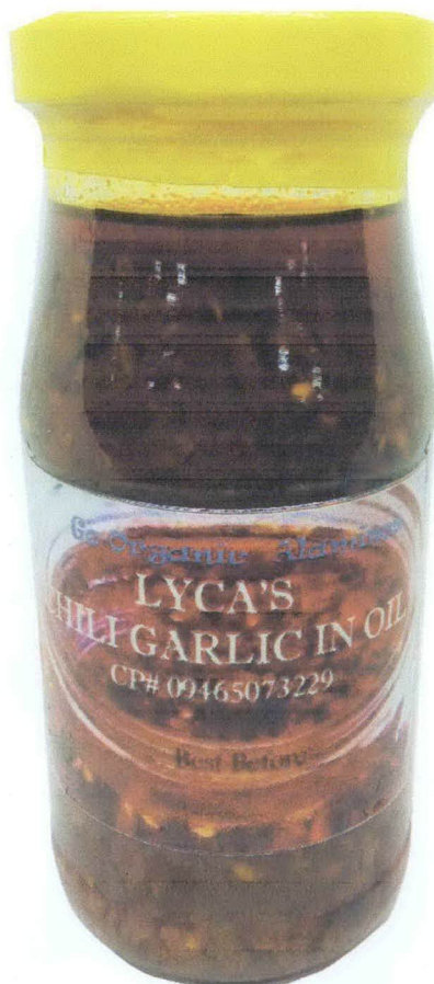
Figure 1. Unregistered LYCA'S Chili Garlic in Oil

The Food and Drug Administration (FDA) advises the public against the purchase and consumption of the following unregistered food products: