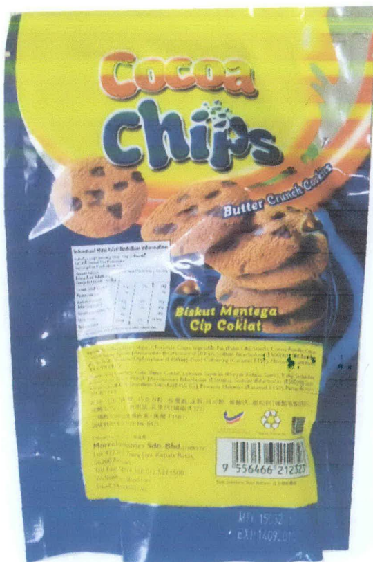
Figure 1. Unregistered MORRIS Cocoa Chips Butter Crunch Cookies