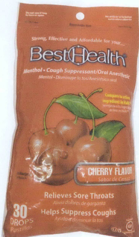
Figure 4. Unregistered BESTHEALTH Menthol Cough Suppressant/ Oral Anesthetic, Cherry Flavour