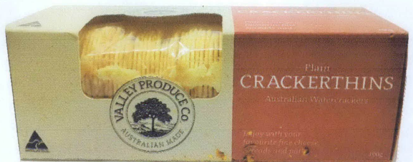
Figure 5. Unregistered VALLEY PRODUCE Plain Crackerthins Australian Watercrackers