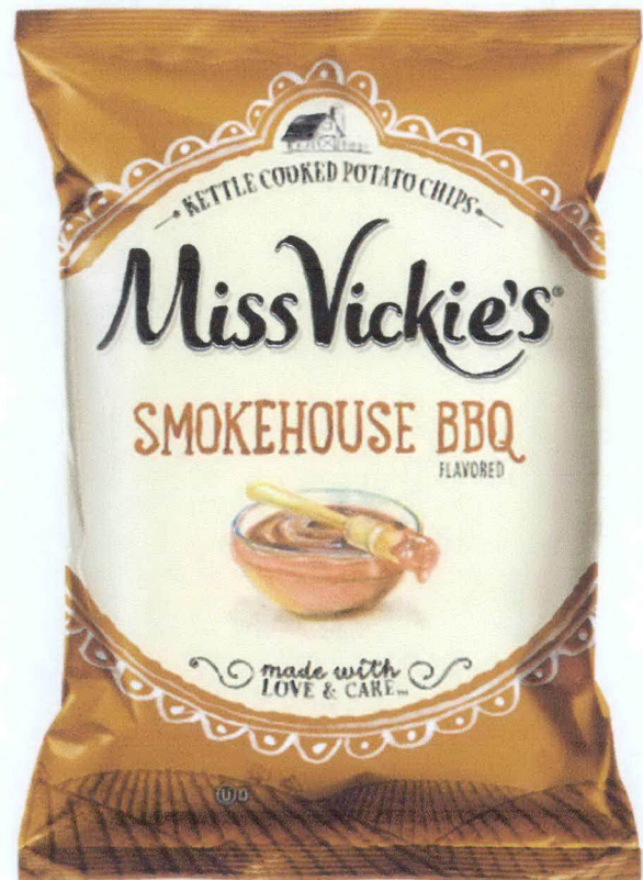
Figure 3. Unregistered MISSVICKIE'S Smokehouse Bbq Flavored