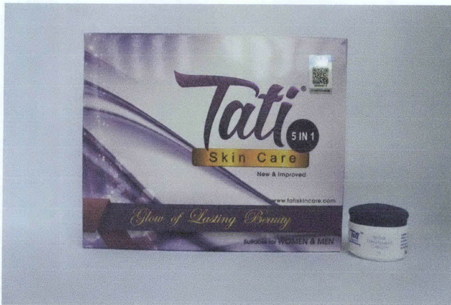
Tati 5 in 1 Skincare New & Improved Glow of Lasting Beauty – Ultra Treatment Cream