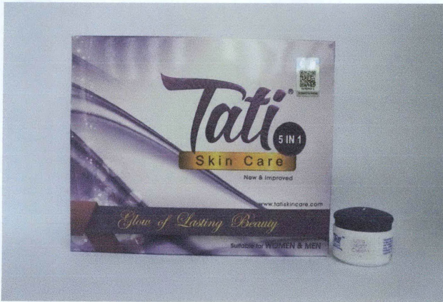
Tati 5 in 1 Skincare New & Improved Glow of Lasting Beauty – Ultra Night Cream