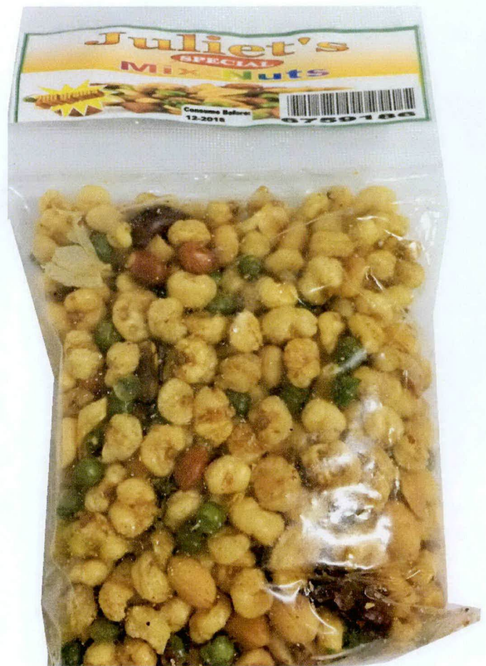
Figure 4. Unregistered JULIET'S Special Mix Nuts