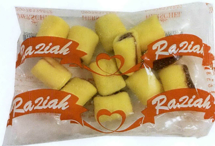
Figure 3. Unregistered RAZIAH CANDY