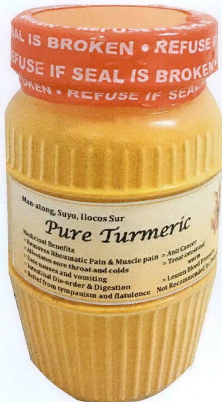
Figure 1. Unregistered Pure Turmeric by Man-Atong, Suyo, Ilocos Sur

The Food and Drug Administration (FDA) advises the public against the purchase and consumption of the following unregistered food products: