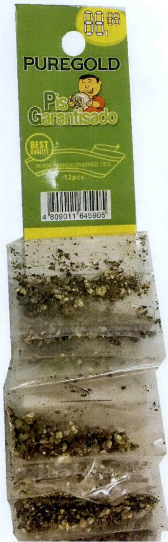
Figure 3. Unregistered PUREGOLD Piso Garantisado Black Pepper Cracked Tie