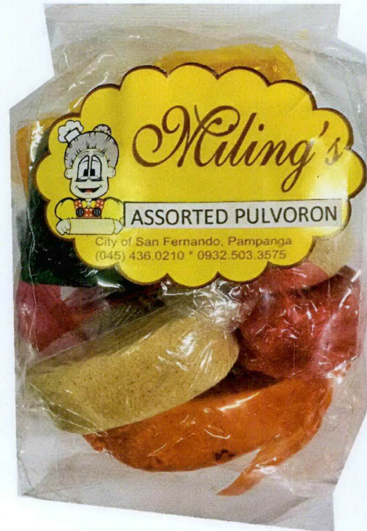
Figure 2. Unregistered MILING'S Assorted Pulvuron