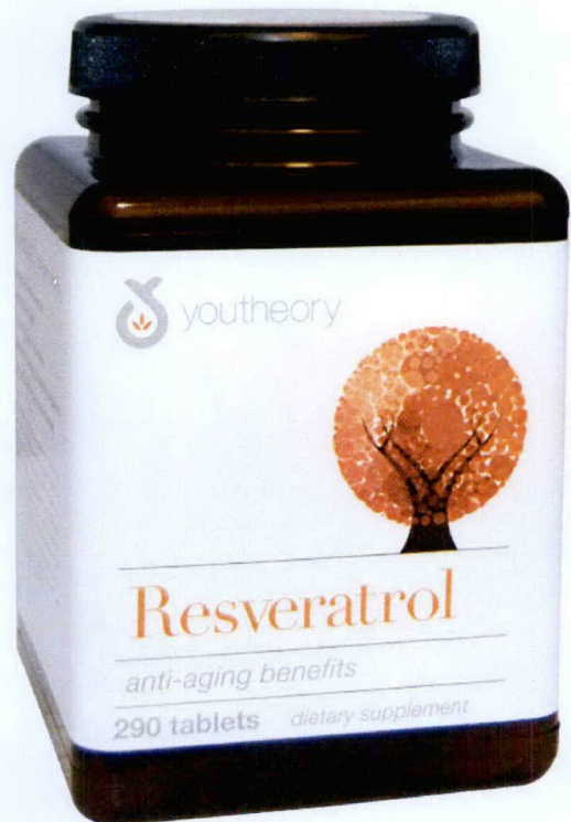
Figure 5. Unregistered YOUTHEORY Resveratrol