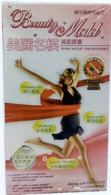
Figure 2. Unregistered BEAUTY MODEL Slimming Capsules