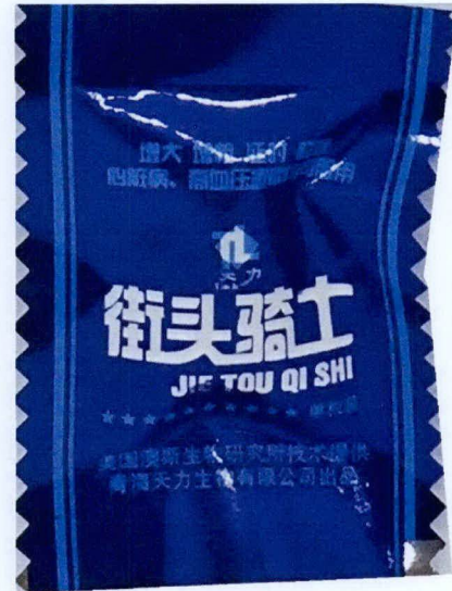
Figure 3. Unregistered JIE TOU QI SHI