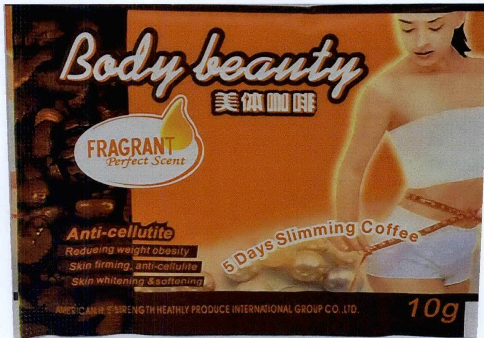
Figure 1. Unregistered BODY BEAUTY 5 Days Slimming Coffee

The Food and Drug Administration (FDA) advises the public against the purchase and consumption of the following unregistered food products: