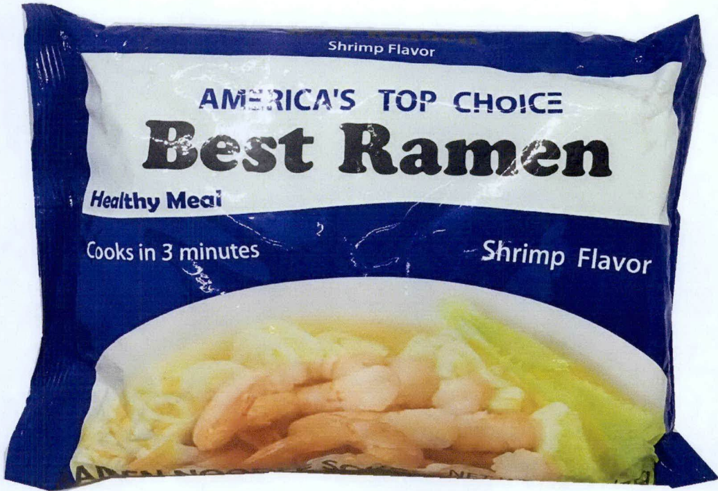
Figure 2. Unregistered AMERICA'S TOP CHOICE Ramen Shrimp Flavor