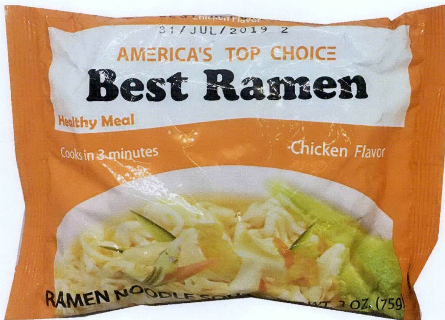
Figure 1. Unregistered AMERICA'S TOP CHOICE Best Ramen Chicken Flavor

The Food and Drug Administration (FDA) advises the public against the purchase and consumption of the following unregistered food products: