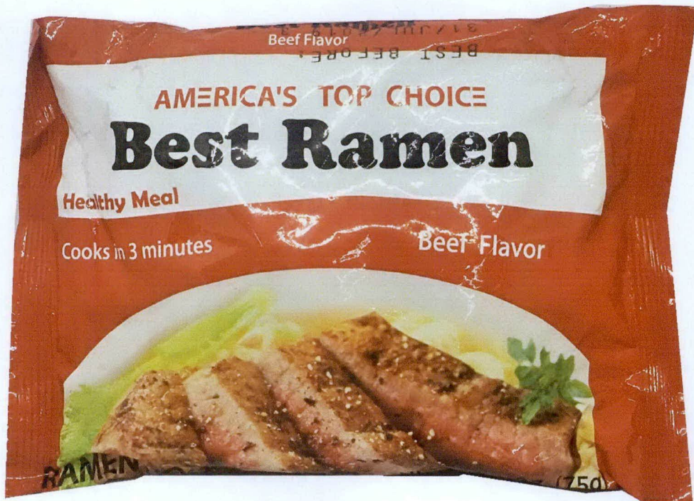
Figure 3. Unregistered AMERICA'S TOP CHOICE Ramen Beef Flavor