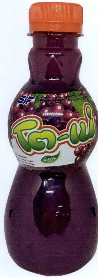
Figure 4. Unregistered TO-NE Strawberry Juice Figure 5. Unregistered TO-NE Grape Juice

FDA post-marketing surveillance (PMS) activities have verified that the abovementioned food products have not gone through the registration process of the agency and have not been issued the proper authorization in the form of Certificate of Product Registration. Pursuant to Republic Act No. 9711, otherwise known as the “Food and Drug Administration Act of 2009”, the manufacture, importation, exportation, sale, offering for sale, distribution, transfer, non-consumer use, promotion, advertising or sponsorship of health products without the proper authorization from FDA is prohibited.