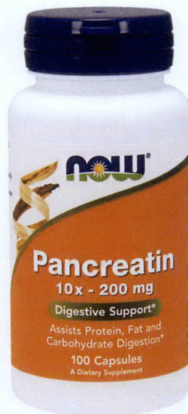
Figure 6. Unregistered NOW Pancreatin Dietary Supplement