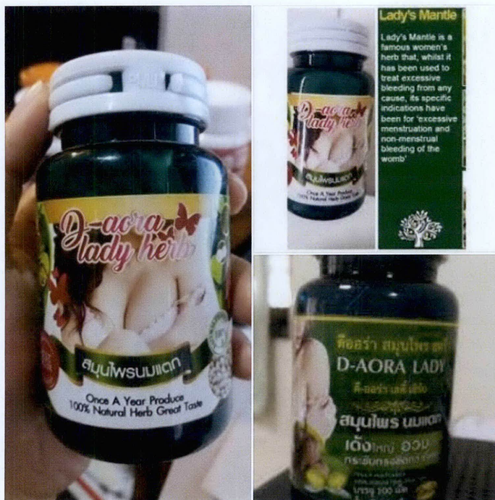
Figure 5. Unregistered D-AORA LADY HERB