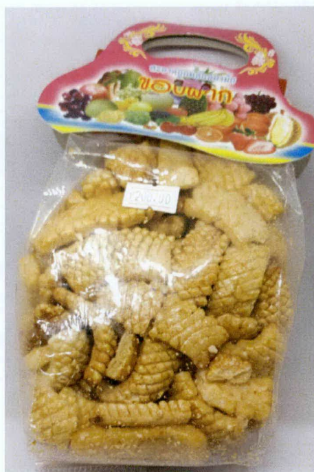
Figure 1. Unregistered MELGON SPECIAL Squid Cracker