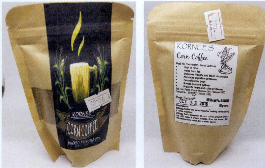
Figure 2. Unregistered KORNEE'S Corn Coffee