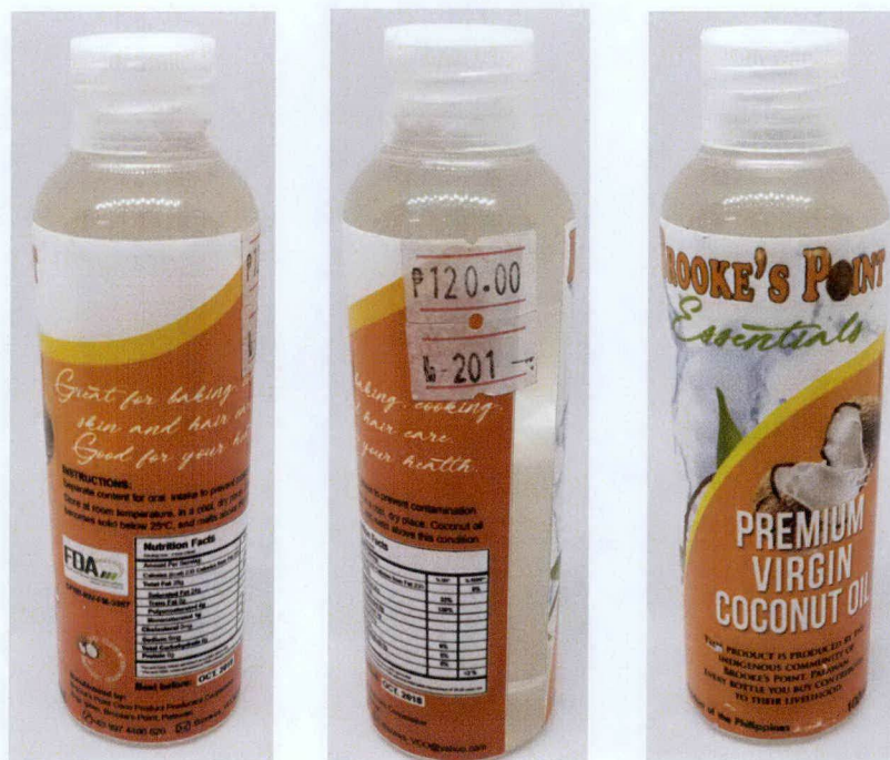
Figure 3. Unregistered BROOKE'S POINT ESSENTIALS Premium Virgin Coconut Oil