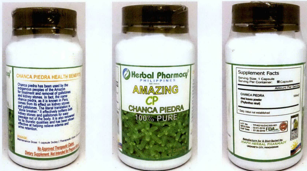
Figure 2. Unregistered HERBAL PHARMACY PHILIPPINES CP Chanca Piedre 100% Pure Capsules