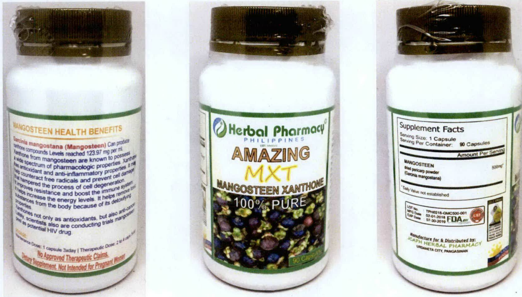
Figure 4. Unregistered HERBAL PHARMACY PHILIPPINES AMAZING MXT Mangosteen Xanthone 100% Pure Capsules