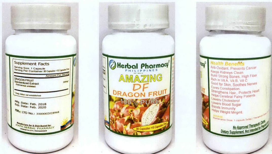
Figure 3. Unregistered HERBAL PHARMACY PHILIPPINES AMAZING DF Dragon Fruit 100% Pure Capsules