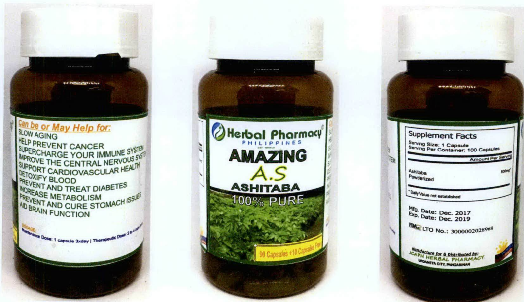
Figure 1. Unregistered HERBAL PHARMACY PHILIPPINES AMAZING AS Ashitaba 100% Pure Capsules

The Food and Drug Administration (FDA) advises the public against the purchase and consumption of the following unregistered food supplements: