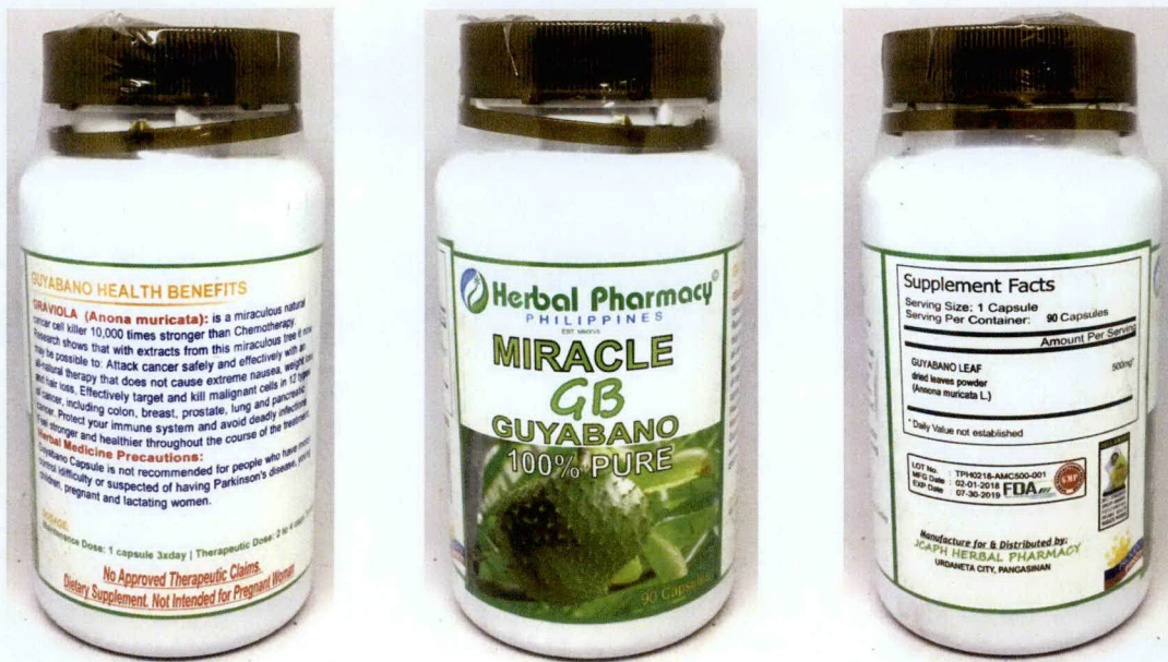
Figure 5. Unregistered HERBAL PHARMACY PHILIPPINES MIRACLE GB Guyabano 100% Pure Capsules