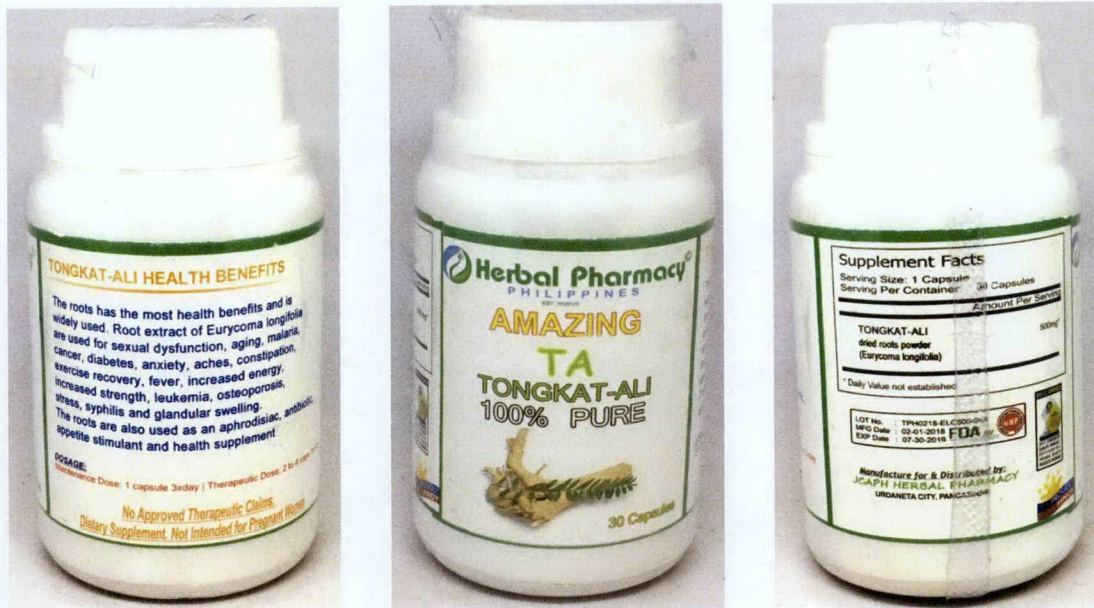
Figure 6. Unregistered HERBAL PHARMACY PHILIPPINES AMAZING TA Tongkat-Ali 100% Pure Capsules

FDA post-marketing surveillance (PMS) activities have verified that the abovementioned food supplements have not gone through the registration process of the agency and have not been issued the proper authorization in the form of Certificate of Product Registration. Pursuant to Republic Act No. 9711, otherwise known as the “Food and Drug Administration Act of 2009”, the manufacture, importation, exportation, sale, offering for sale, distribution, transfer, non-consumer use, promotion, advertising or sponsorship of health products without the proper authorization from FDA are prohibited.