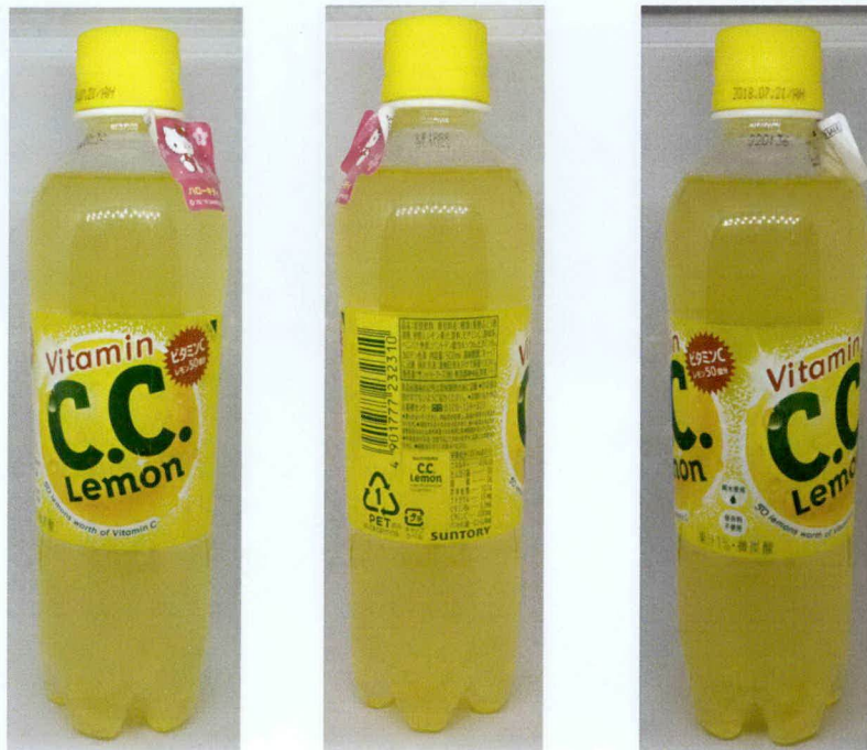
Figure 1. Unregistered SUNTORY Vitamin C.C. Lemon

The Food and Drug Administration (FDA) advises the public against the purchase and consumption of the following unregistered food products and food supplements: