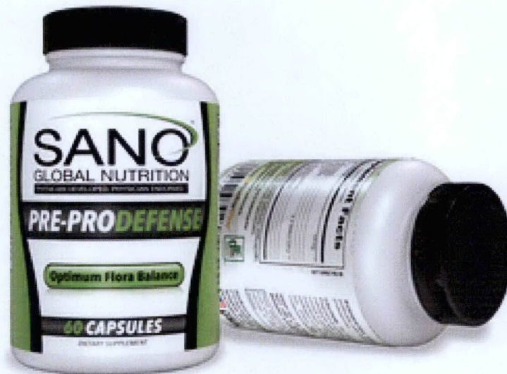
Figure 4. Unregistered SANO GLOBAL NUTRITION PRE-PRODEFENSE Optimum Flora Balance Dietary Supplement