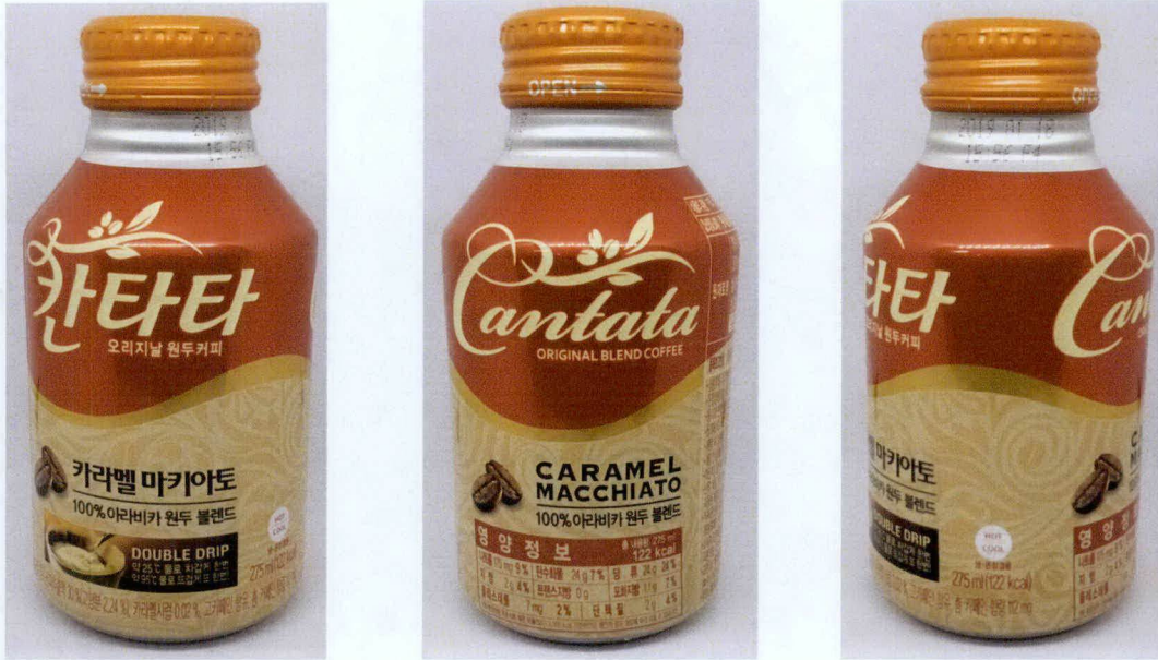
Figure 2. Unregistered CANTATA Original Blend Coffee Caramel Macchiato