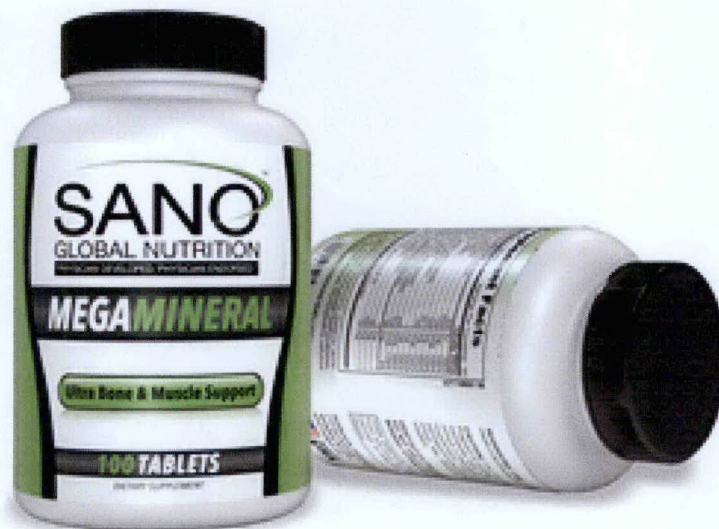
Figure 5. Unregistered SANO GLOBAL NUTRITION MEGAMINERAL Ultra Bone & Muscle Support Dietary Supplement

FDA post-marketing surveillance (PMS) activities have verified that the abovementioned food products and food supplements have not gone through the registration process of the agency and have not been issued the proper authorization in the form of Certificate of Product Registration. Pursuant to Republic Act No. 9711, otherwise known as the “Food and Drug Administration Act of 2009”, the manufacture, importation, exportation, sale, offering for sale,