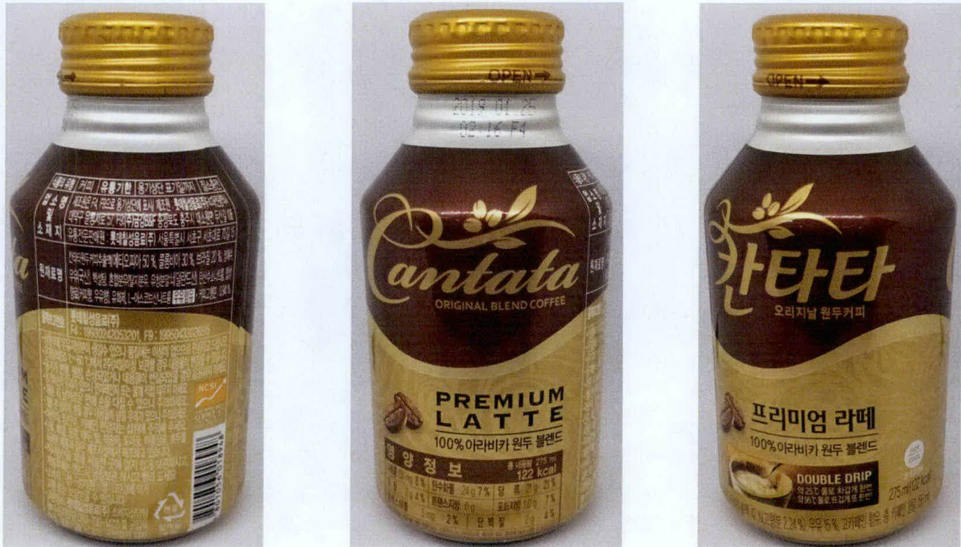
Figure 3. Unregistered CANTATA Original Blend Coffee Premium Latte