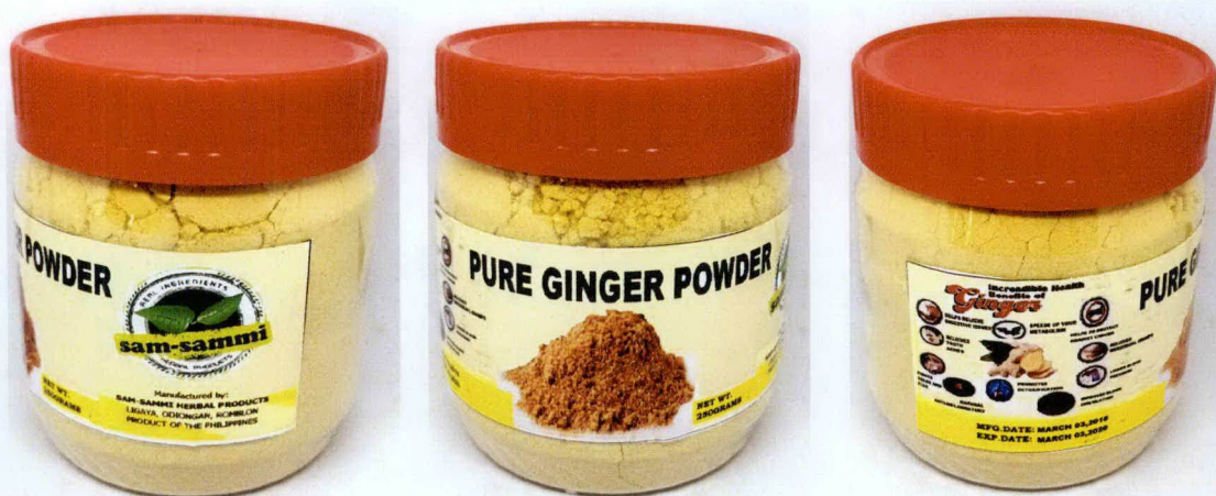
Figure 4. Unregistered SAM-SAMMI Pure Ginger Powder