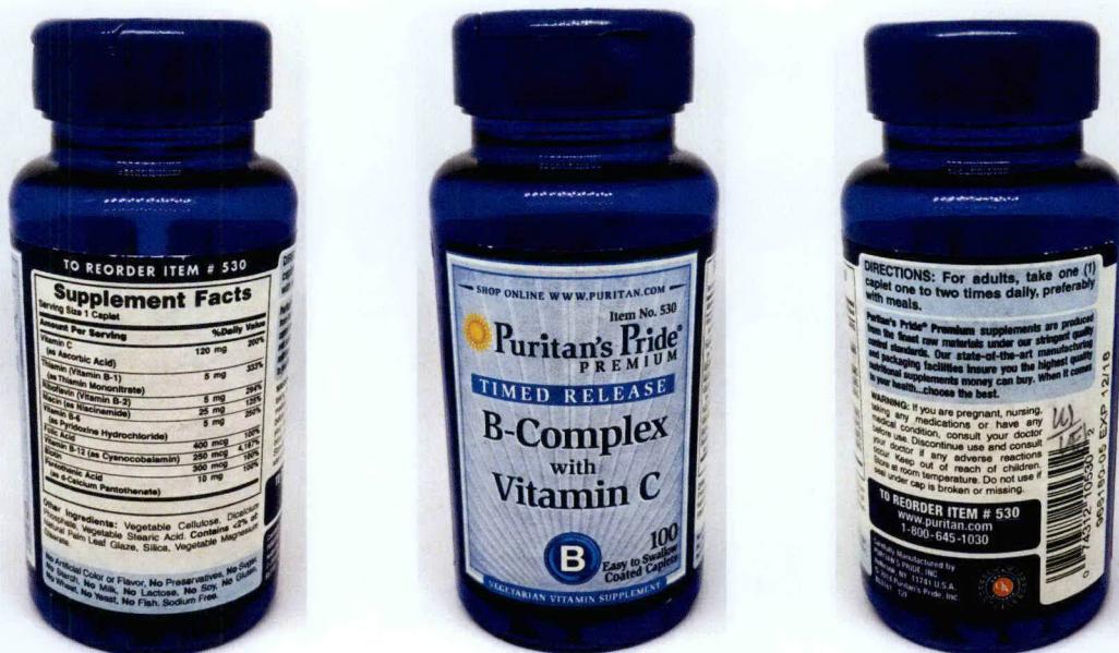
Figure 1. Unregistered PURITAN'S PRIDE PREMIUM B-Complex with Vitamin C

The Food and Drug Administration (FDA) advises the public against the purchase and consumption of the following unregistered food supplements: