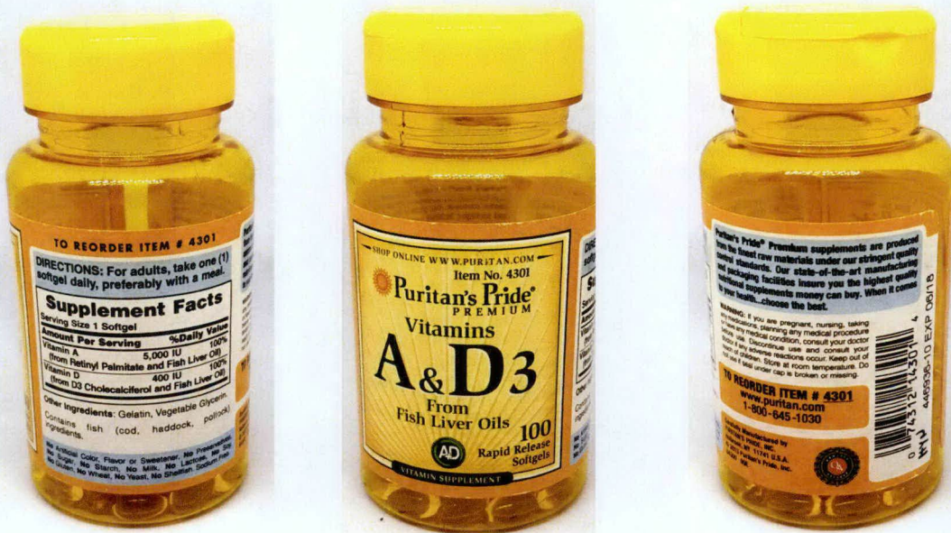
Figure 3. Unregistered PURITAN'S PRIDE PREMIUM Vitamins A & D3 from Fish Liver Oils