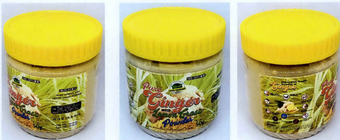
Figure 5. Unregistered SAM-SAMMI Pure Ginger with Lemon Grass Powder

FDA post-marketing surveillance (PMS) activities have verified that the abovementioned food supplements have not gone through the registration process of the agency and have not been issued the proper authorization in the form of Certificate of Product Registration. Pursuant to Republic Act No. 9711, otherwise known as the “Food and Drug Administration Act of 2009”, the manufacture, importation, exportation, sale, offering for sale, distribution, transfer, non-consumer use, promotion, advertising or sponsorship of health products without the proper authorization from FDA are prohibited.