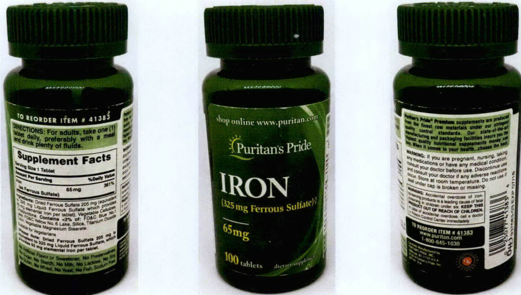
Figure 2. Unregistered PURITAN'S PRIDE Iron (325mg Ferrous Sulfate)