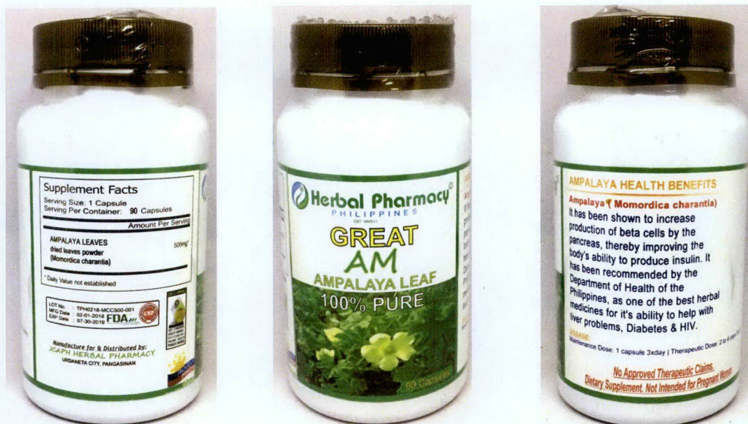
Figure 2. Unregistered HERBAL PHARMACY PHILIPPINES GREAT AM Ampalaya Leaf 100% Pure Capsules