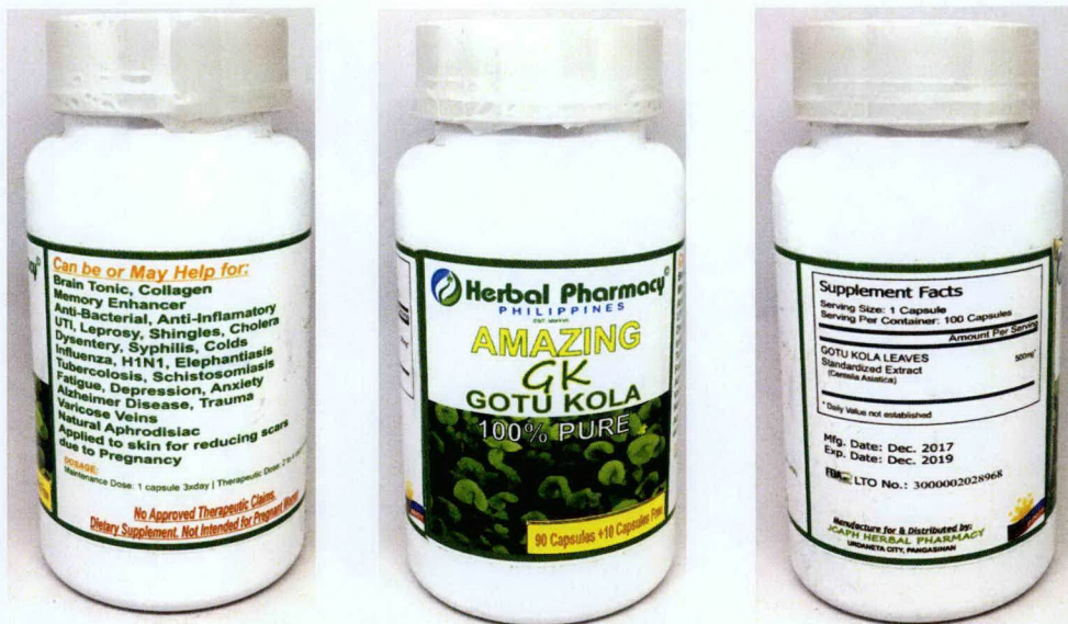
Figure 4. Unregistered HERBAL PHARMACY PHILIPPINES AMAZING GK Gotu Kola 100% Pure Capsules