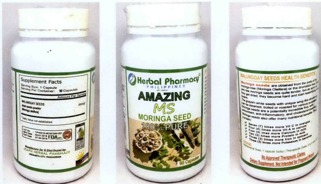
Figure 6. Unregistered HERBAL PHARMACY PHILIPPINES AMAZING MS Moringa Seed 100% Pure Capsules