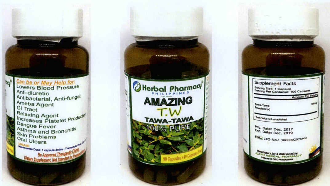
Figure 7. Unregistered HERBAL PHARMACY PHILIPPINES AMAZING TW Tawa-tawa 100% Pure Capsules

FDA post-marketing surveillance (PMS) activities have verified that the abovementioned food supplements have not gone through the registration process of the agency and have not been issued the proper authorization in the form of Certificate of Product Registration. Pursuant to Republic Act No. 9711, otherwise known as the “Food and Drug Administration Act of 2009”, the manufacture, importation, exportation, sale, offering for sale, distribution, transfer, non-