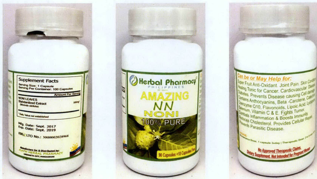
Figure 5. Unregistered HERBAL PHARMACY PHILIPPINES AMAZING NN Noni 100% Pure Capsules