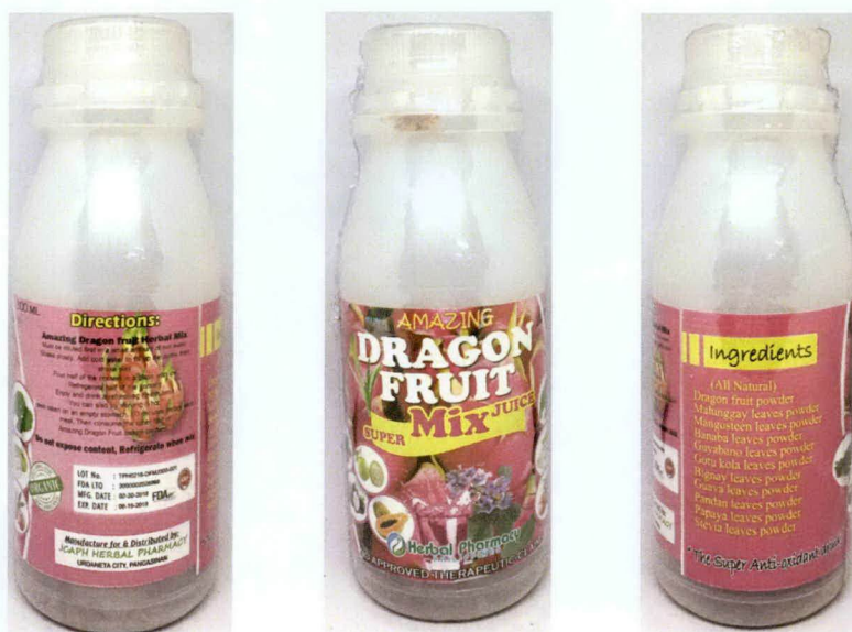
Figure 1. Unregistered HERBAL PHARMACY PHILIPPINES AMAZING Dragon Fruit Super Mix Juice

The Food and Drug Administration (FDA) advises the public against the purchase and consumption of the following unregistered food supplements: