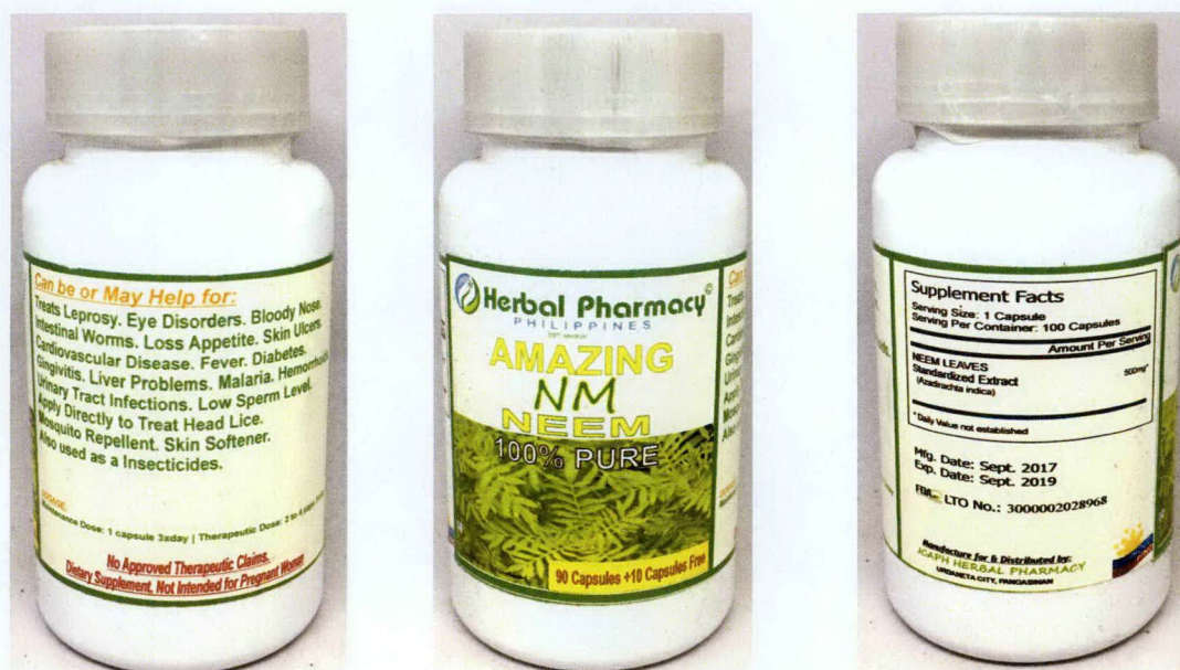
Figure 3. Unregistered HERBAL PHARMACY PHILIPPINES AMAZING NM Neem 100% Pure Capsules