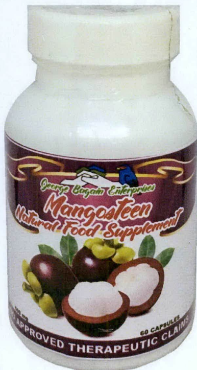
Figure 1. Unregistered GEORGE BAGAIN ENTERPRISES Mangosteen Natural Food Supplement

The Food and Drug Administration (FDA) advises the public against the purchase and consumption of the following unregistered food products: