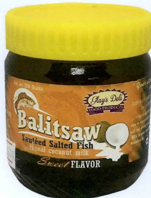
Figure 2. Unregistered GLAY'S DELI FOOD PRODUCTS Balitsaw Sautéed Salted Fish with real Coconut Milk, Sweet Flavor