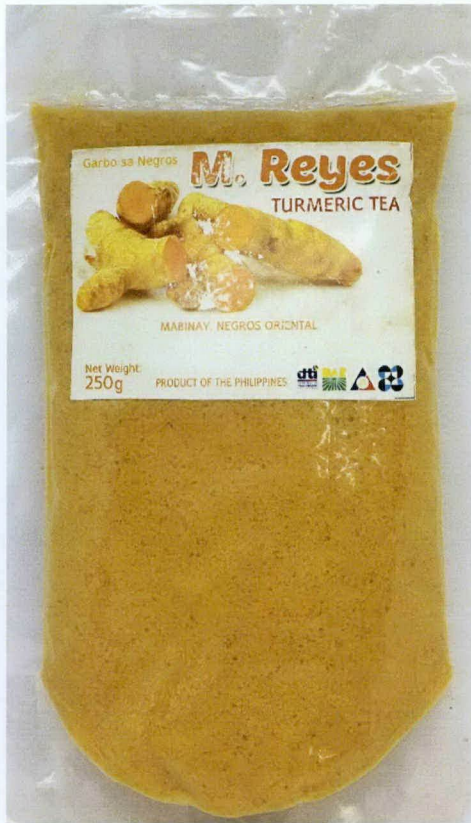
Figure 3. Unregistered M. REYES Turmeric Tea