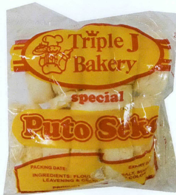
Figure 3. Unregistered TRIPLE J Bakery Special Puto Seko