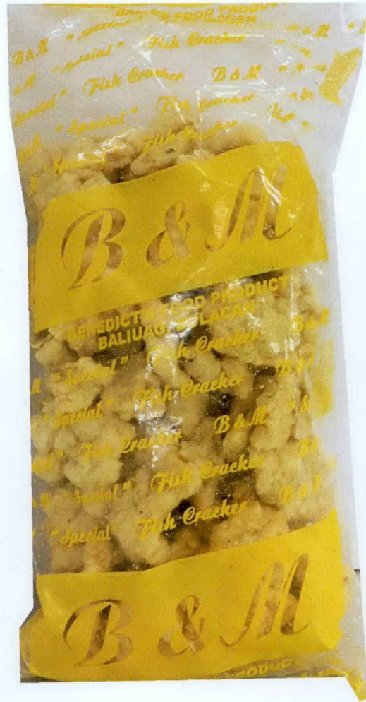
Figure 4. Unregistered B&M Special Fish Cracker