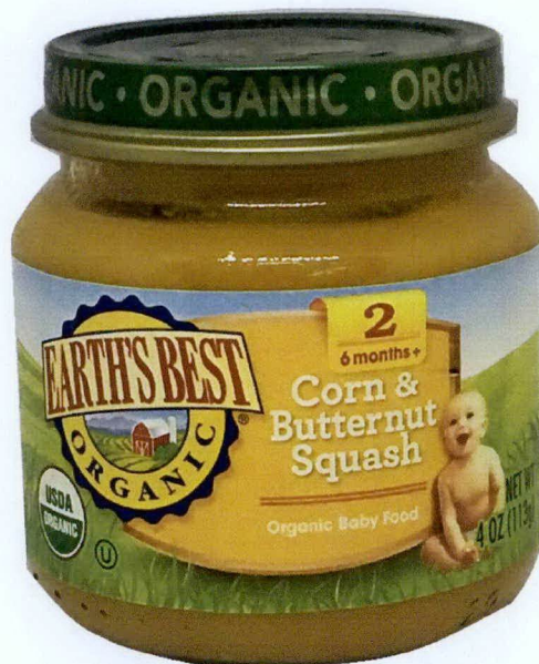
Figure 4. Unregistered EARTH'S BEST ORGANIC Corn & Butternut Squash Organic Baby Food