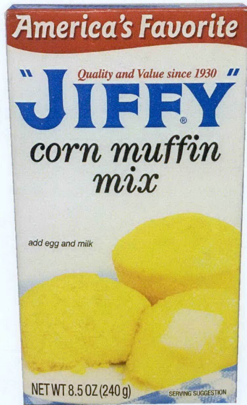
Figure 2. Unregistered EARTH'S BEST Organic Apple Raisin Flax & Oat Wholesome Breakfast Puree Figure 3. Unregistered JIFFY Corn Muffin Mix