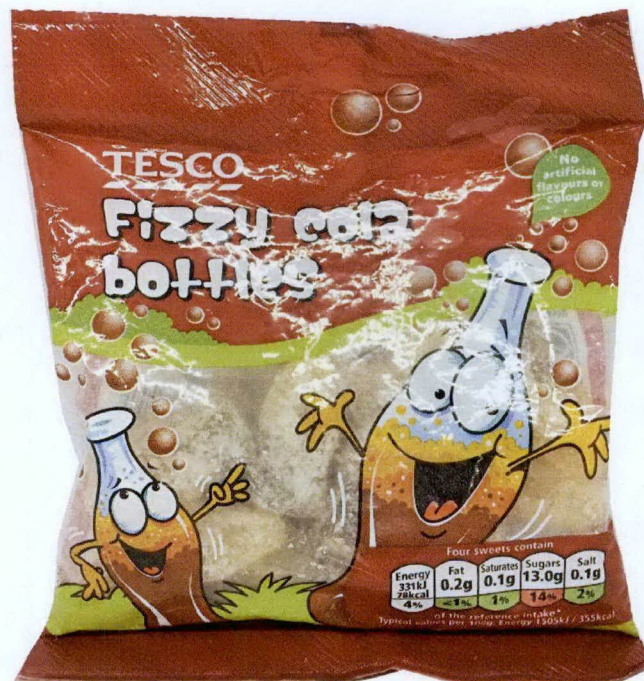
Figure 1. Unregistered TESCO Fizzy Cola Bottles

The Food and Drug Administration (FDA) advises the public against the purchase and consumption of the following unregistered food products: