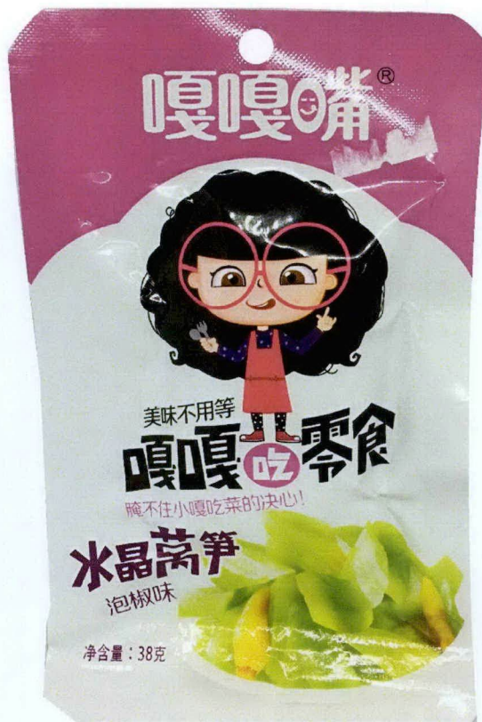
Figure 3. Unregistered Boss Gazui Pickle (labels are in foreign characters)