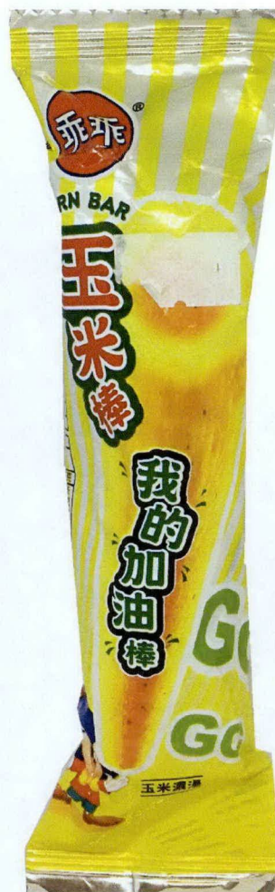
Figure 7. Unregistered GO GO Corn Bar (labels are in foreign characters)

FDA post-marketing surveillance (PMS) activities have verified that the abovementioned food products have not gone through the registration process of the agency and have not been issued the proper authorization in the form of Certificate of Product Registration. Pursuant to Republic Act No. 9711, otherwise known as the “Food and Drug Administration Act of 2009”, the manufacture, importation, exportation, sale, offering for sale, distribution, transfer, non-consumer use, promotion, advertising or sponsorship of health products without the proper authorization from FDA is prohibited.