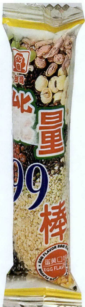
Figure 6. Unregistered 99 Egg Flavor (labels are in foreign characters)