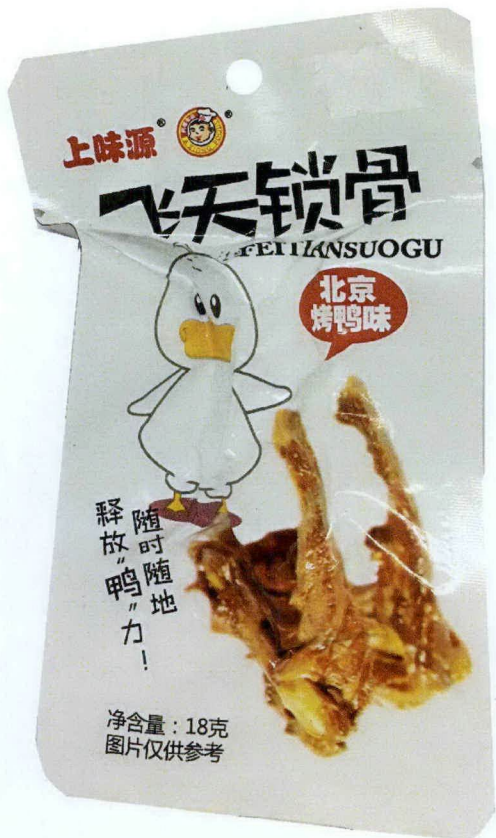
Figure 2. Unregistered A XIONG FOODS FEITIAN SUOGUN (labels are in foreign characters)