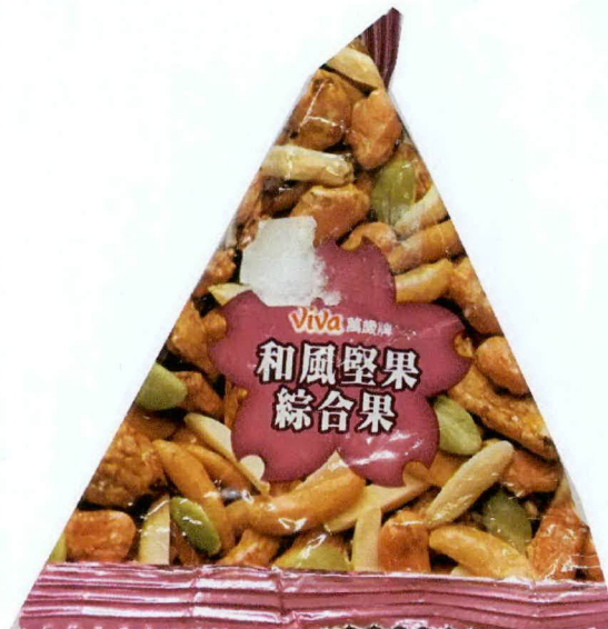
Figure 1. Unregistered VIVA Mixed Nuts (labels are in foreign characters)

The Food and Drug Administration (FDA) advises the public against the purchase and consumption of the following unregistered food products in which labels are in foreign characters: