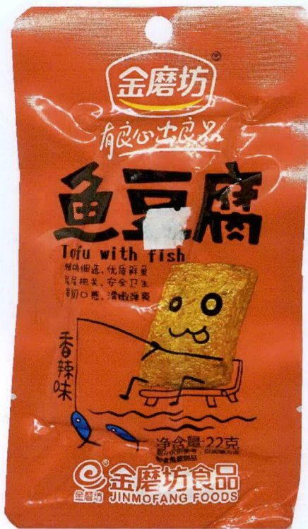
Figure 5. Unregistered JINMOFANG FOODS Tofu with Fish (labels are in foreign characters)