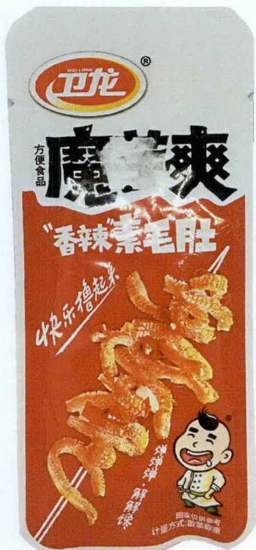
Figure 4. Unregistered WEI-LONG Meat Pickle (labels are in foreign characters)