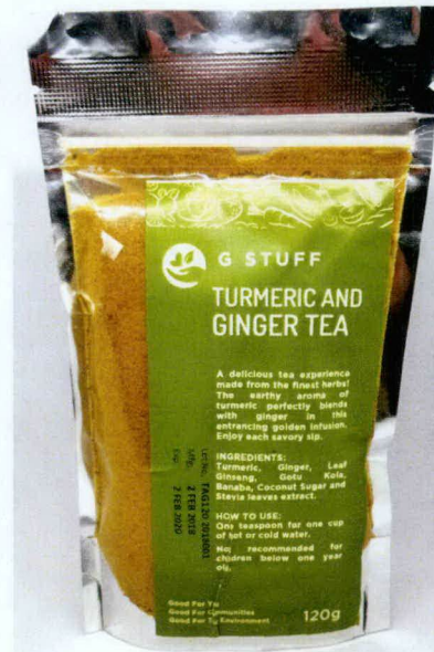
Figure 5. Unregistered G STUFF Turmeric and Ginger Tea