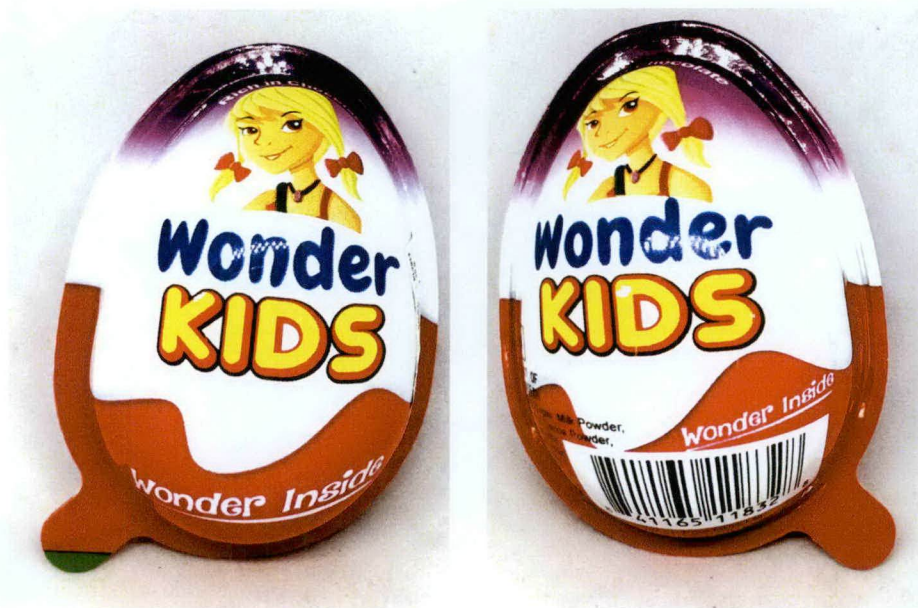
Figure 1. Unregistered WONDER KIDS WONDER INSIDE

The Food and Drug Administration (FDA) advises the public against the purchase and consumption of the following unregistered food products and food supplements: