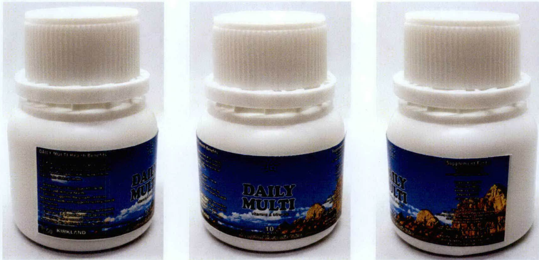
Figure 2. Unregistered DAILY MULTI Vitamins & Minerals