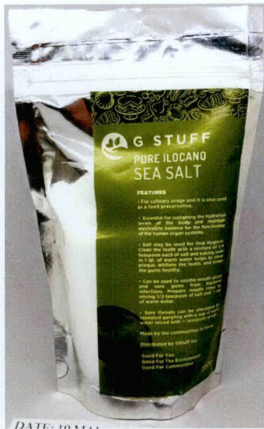
Figure 4. Unregistered G STUFF PURE ILOCANO Sea Salt