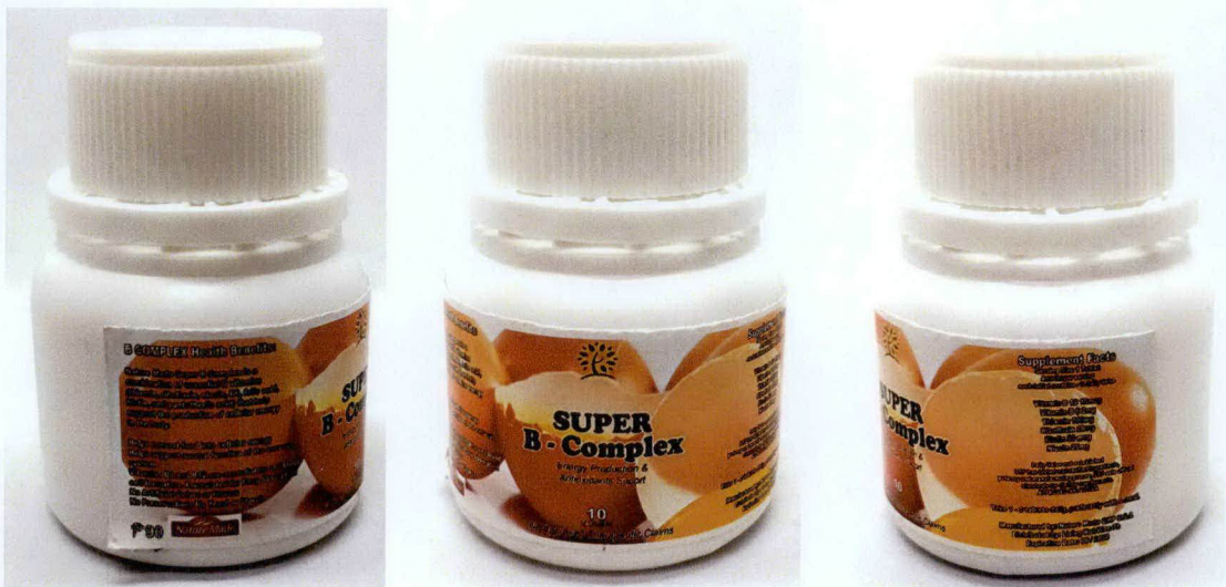
Figure 3. Unregistered SUPER B COMPLEX