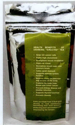
Figure 6. Unregistered G STUFF AMAZING Tea

FDA post-marketing surveillance (PMS) activities have verified that the abovementioned food products and food supplements have not gone through the registration process of the agency and have not been issued the proper authorization in the form of Certificate of Product Registration. Pursuant to Republic Act No. 9711, otherwise known as the “Food and Drug Administration Act of 2009”, the manufacture, importation, exportation, sale, offering for sale, distribution, transfer, non-consumer use, promotion, advertising or sponsorship of health products without the proper authorization from FDA are prohibited.