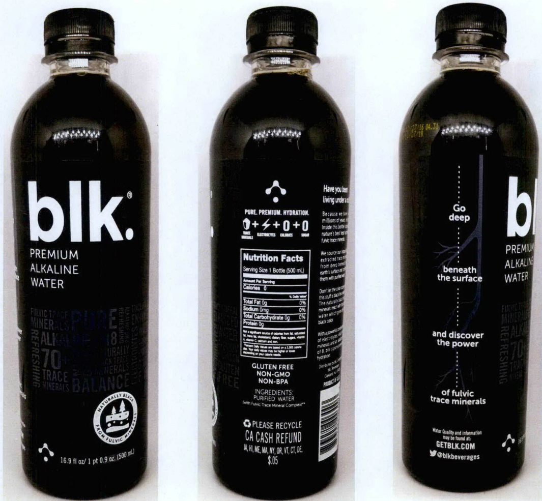
Figure 4. Unregistered BLK. Premium Alkaline Water