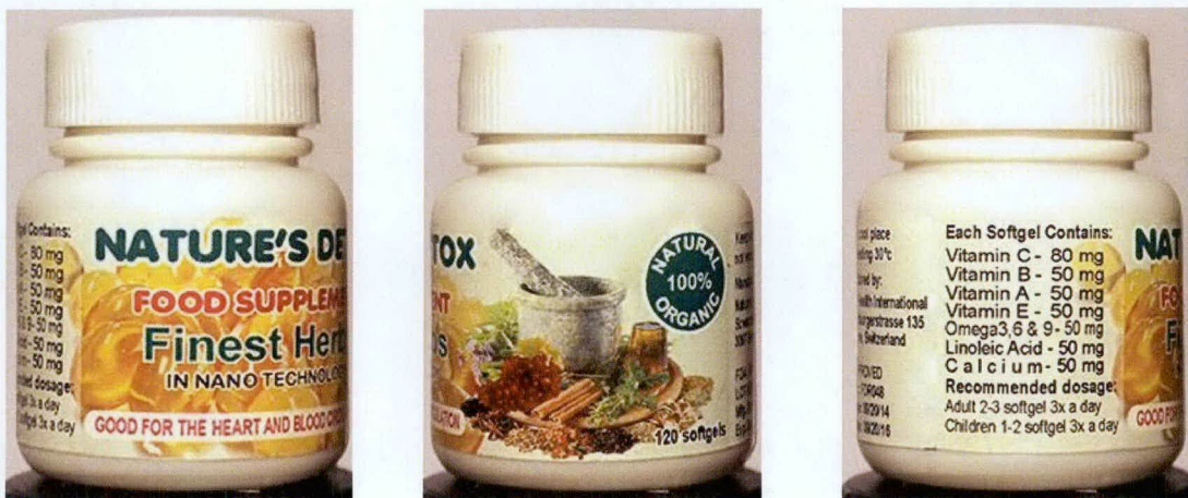
Figure 3. Unregistered NATURE'S DETOX Food Supplement