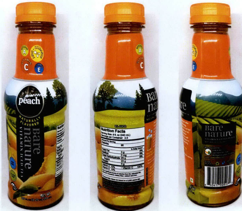
Figure 5. Unregistered BARE NATURE Vitamin Iced Tea Peach Naturally Flavored

FDA post-marketing surveillance (PMS) activities have verified that the abovementioned food products and food supplements have not gone through the registration process of the agency and have not been issued the proper authorization in the form of Certificate of Product Registration. Pursuant to Republic Act No. 9711, otherwise known as the “Food and Drug Administration Act of 2009”, the manufacture, importation, exportation, sale, offering for sale, distribution, transfer, non-consumer use, promotion, advertising or sponsorship of health products without the proper authorization from FDA are prohibited.