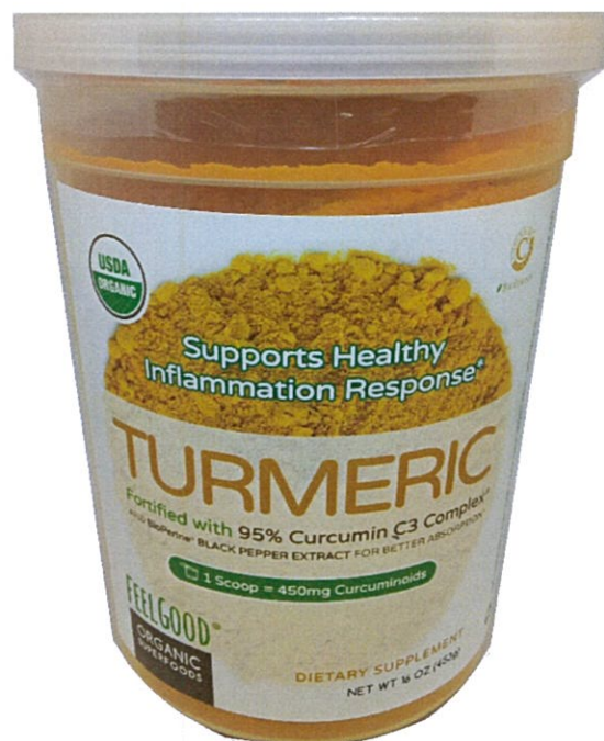
Figure 5. Unregistered Turmeric Fortified with 95% Curcumin C3 Complex Dietary Supplement, 453g