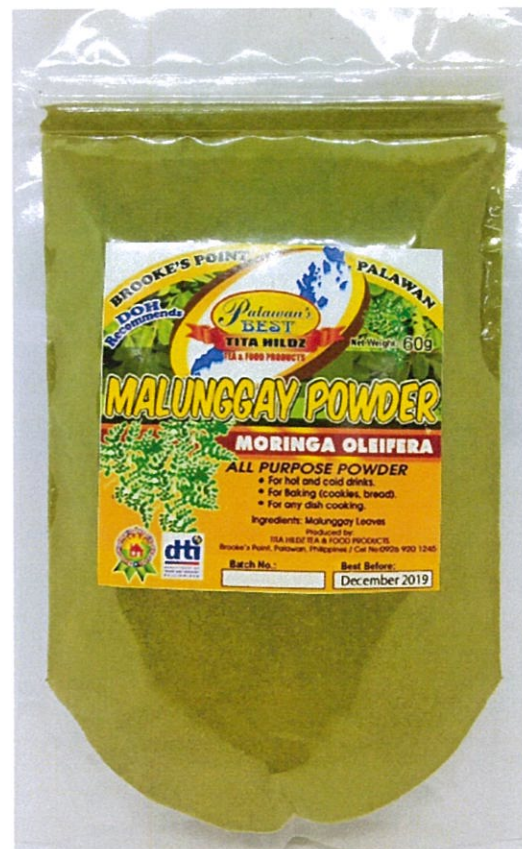
Figure 3. Unregistered Palawan's Best Tita Hildz Malunggay Powder