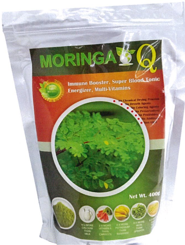
Figure 2. Unregistered Moringa Q (Malunggay Powder), 400g