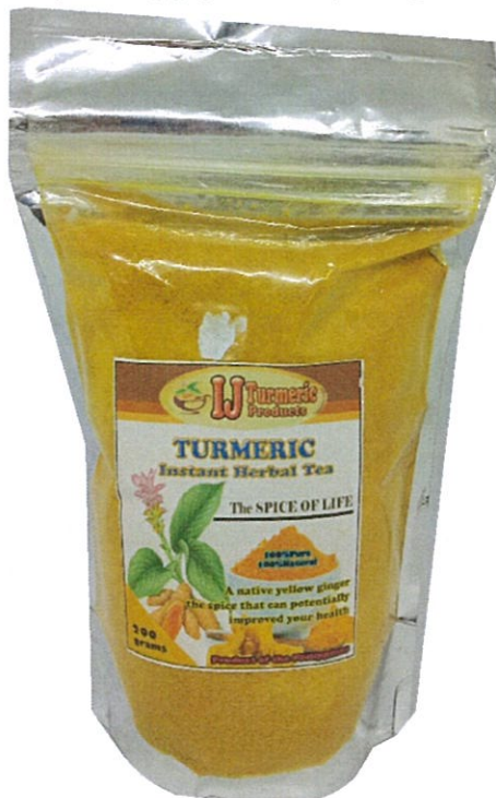
Figure 4. Unregistered IJ TURMERIC PRODUCTS Turmeric Instant Herbal Tea