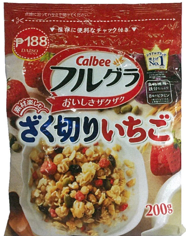
Figure 2. Unregistered Calbee Cereals (labels are in foreign characters)