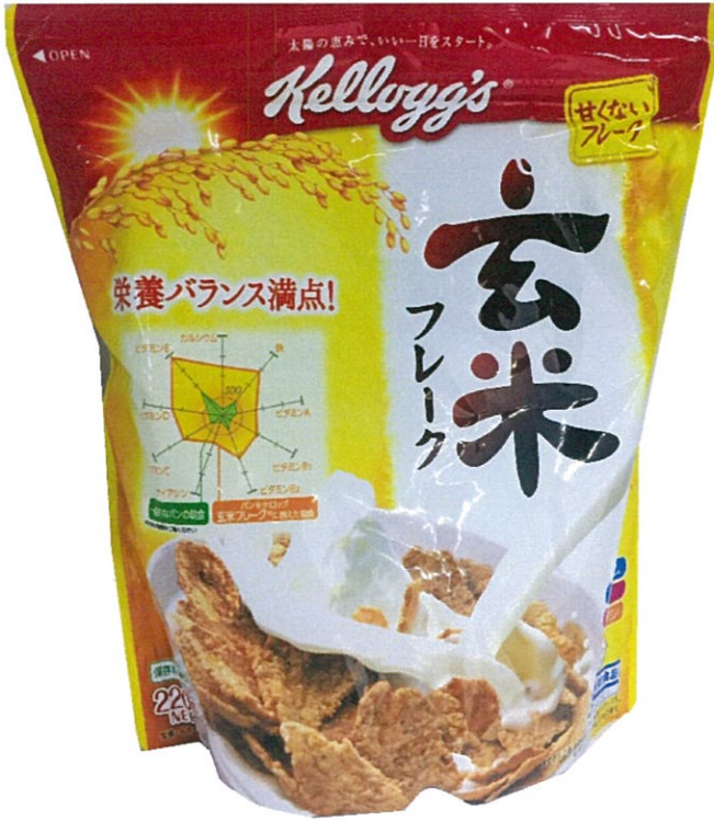
Figure 3. Unregistered KELLOGG'S Cereal (labels are in foreign characters)