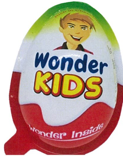
Figure 4. Unregistered Wonder Kids Candy