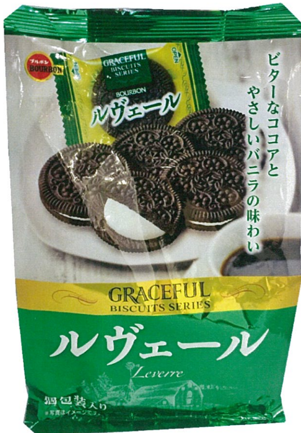
Figure 1. Unregistered BOURBON Graceful Biscuits Series

The Food and Drug Administration (FDA) advises the public against the purchase and consumption of the following unregistered food products: