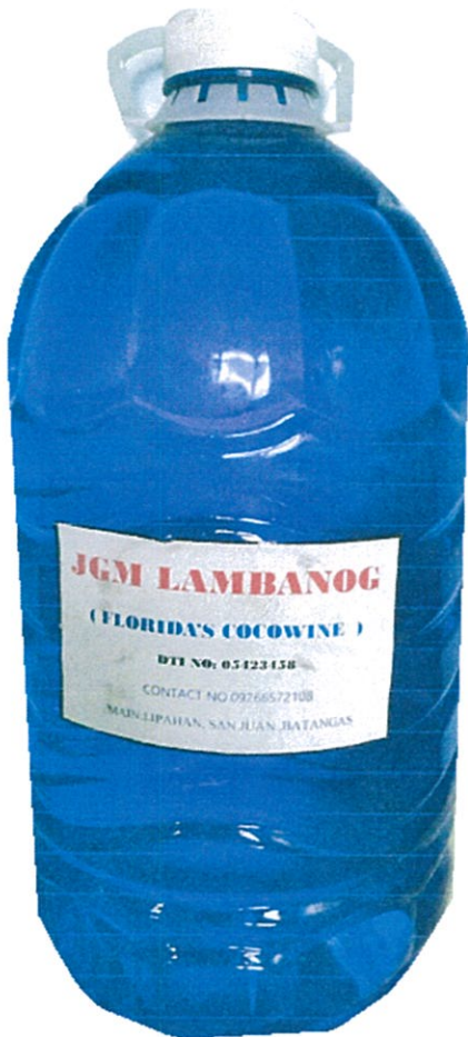
Figure 5. Unregistered JGM Lambanog (Florida Cocowine)