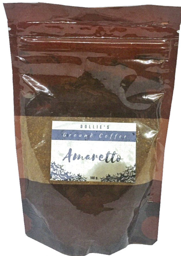
Figure 7. Unregistered Dollie's Amaretto

FDA post-marketing surveillance (PMS) activities have verified that the abovementioned food products have not gone through the registration process of the agency and have not been issued the proper authorization in the form of Certificate of Product Registration. Pursuant to Republic Act No. 9711, otherwise known as the "Food and Drug Administration Act of 2009", the manufacture, importation, exportation, sale, offering for sale, distribution, transfer, non-consumer use, promotion, advertising or sponsorship of health products without the proper authorization from FDA is prohibited.