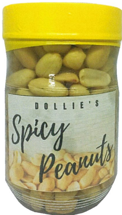
Figure 1. Unregistered Dollie's Spicy Peanuts

The Food and Drug Administration (FDA) advises the public against the purchase and consumption of the following unregistered Dollie's food products: