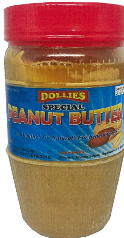
Figure 2. Unregistered Dollie's Special Peanut Butter