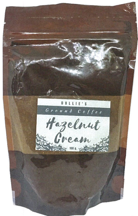
Figure 6. Unregistered Dollie's Ground Coffee, Hazelnut Cream