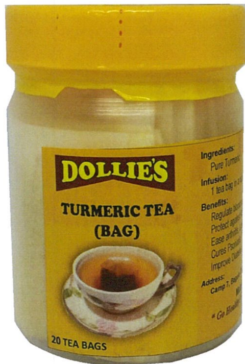
Figure 4. Unregistered Dollie's Pure Turmeric Tea (Bag)