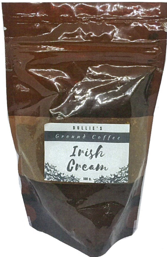
Figure 5. Unregistered Dollie's Ground Coffee, Irish Cream