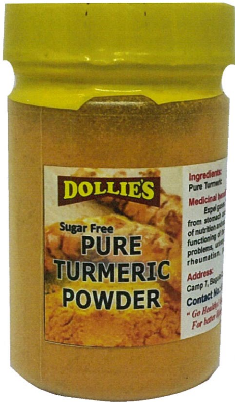
Figure 3. Unregistered Dollie's Pure Turmeric Powder, Sugar Free