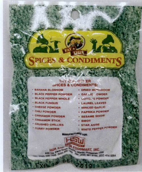
Figure 2. Unregistered FAT & THIN SPICES & CONDIMENTS Black Pepper Whole