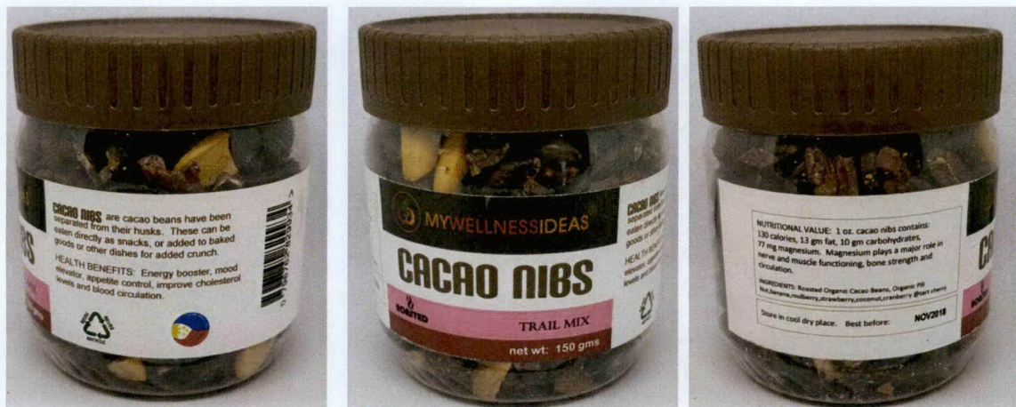
Figure 5. Unregistered MYWELLNESSIDEAS Cacao Nibs Roasted Trail Mix

FDA post-marketing surveillance (PMS) activities have verified that the abovementioned food products have not gone through the registration process of the agency and have not been issued the proper authorization in the form of Certificate of Product Registration. Pursuant to Republic Act No. 9711, otherwise known as the “Food and Drug Administration Act of 2009”, the manufacture, importation, exportation, sale, offering for sale, distribution, transfer, non-consumer use, promotion, advertising or sponsorship of health products without the proper authorization from FDA are prohibited.