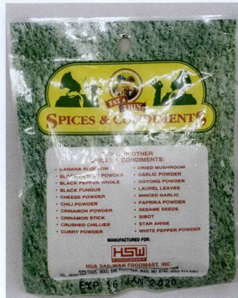
Figure 3. Unregistered FAT & THIN SPICES & CONDIMENTS Black Pepper Powder