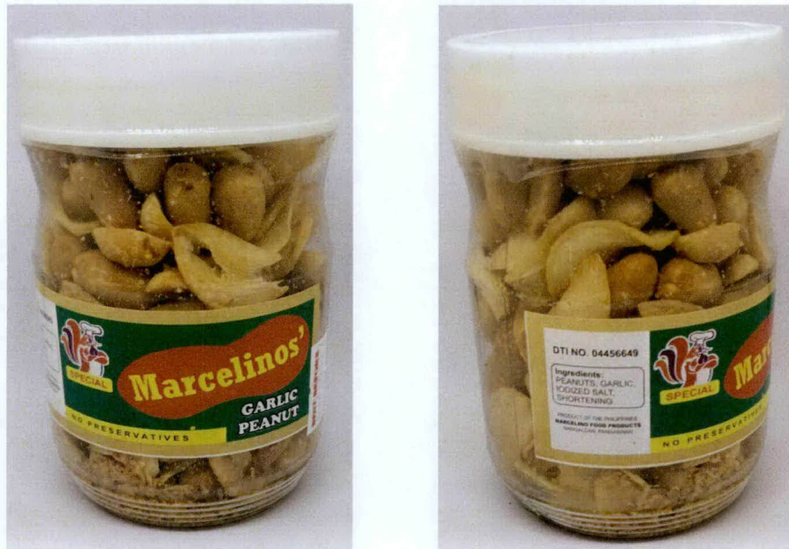
Figure 4. Unregistered MARCELINOS' Garlic Peanuts