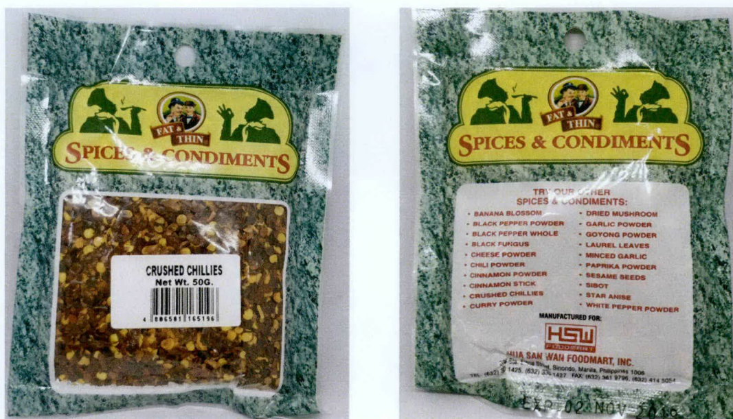
Figure 1. Unregistered FAT & THIN SPICES & CONDIMENTS Crushed Chillies

The Food and Drug Administration (FDA) advises the public against the purchase and consumption of the following unregistered food products: