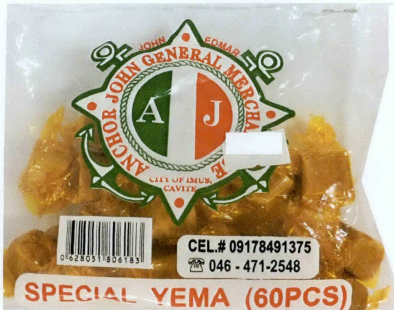
Figure 4. Unregistered ANCHOR JOHN GENERAL MERCHANDISE Special Yema, 60pcs.