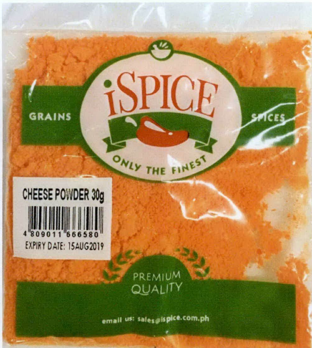
Figure 2. Unregistered iSPICE Cheese Powder, 30g