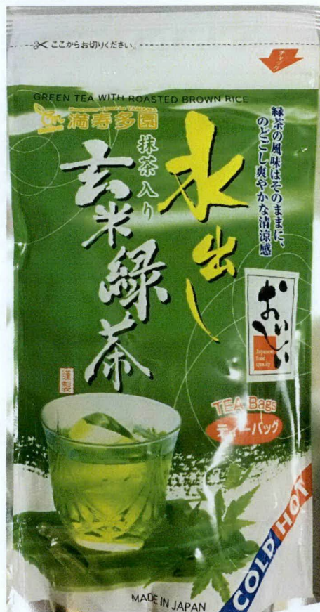
Figure 1. Unregistered MASUDA-EN Green Tea with Roasted Brown Rice

The Food and Drug Administration (FDA) advises the public against the purchase and consumption of the following unregistered food products: