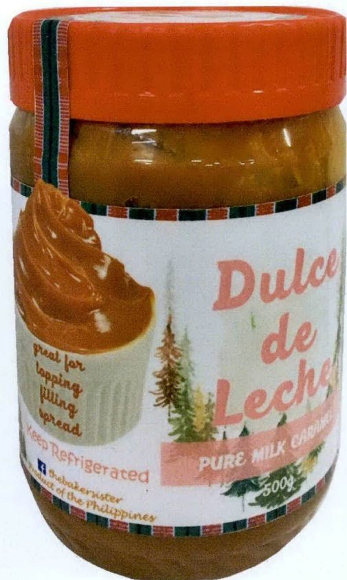
Figure 3. Unregistered Baker Sisters Dulce de Leche Pure Milk Caramel, 500g