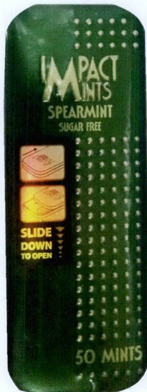
Figure 1. Registered Impact Mints Spearmint, Sugar Free

The Food and Drug Administration (FDA) informs the public that the advisory on the product " Impact Mints Spearmint, Sugar Free " (Fig. 1) under FDA Advisory No. 2019-029 dated 15 February 2019 is hereby lifted pursuant to the compliance of the market authorization holder to the existing laws, rules, and regulations of this Office.