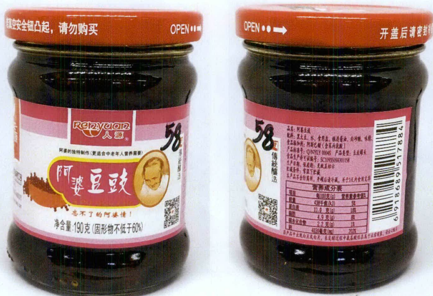
Figure 5. Unregistered OLIE RENYUAN A Po Dou Chi