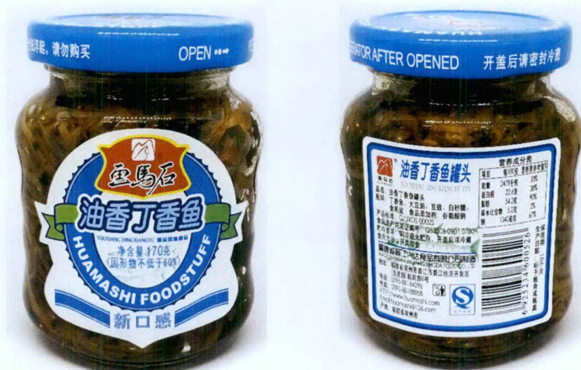
Figure 6. Unregistered HUAMASHI FOODSTUFF Silver Anchovy