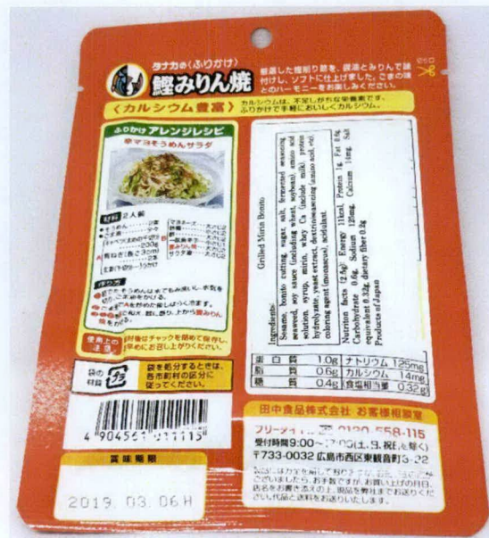
Figure 2. Unregistered TANAKA Grilled Mirin Bonito