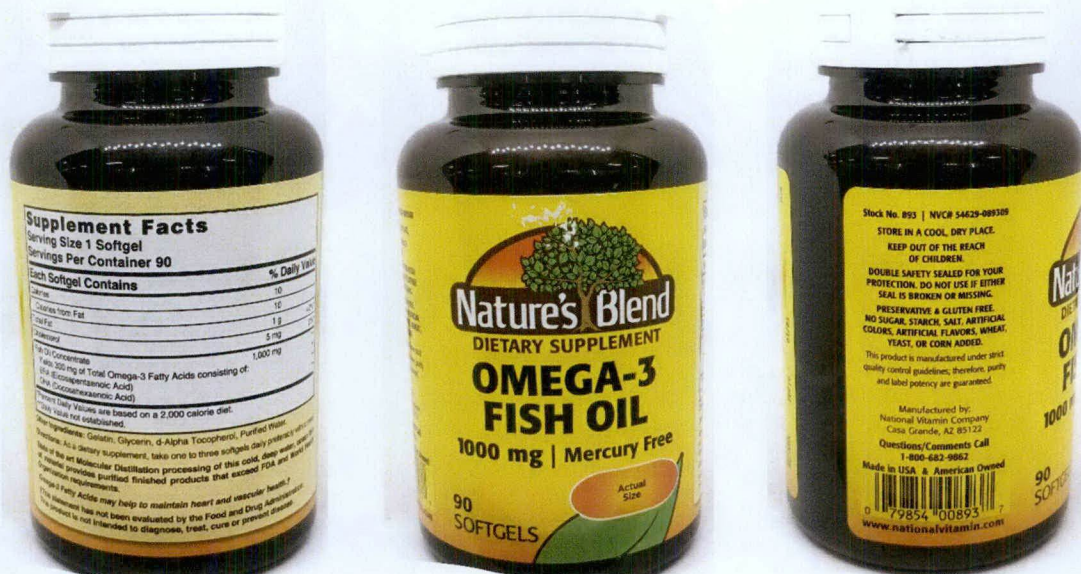
Figure 4. Unregistered NATURE'S BLEND Omega-3 Fish Oil 1000 mg Dietary Supplement