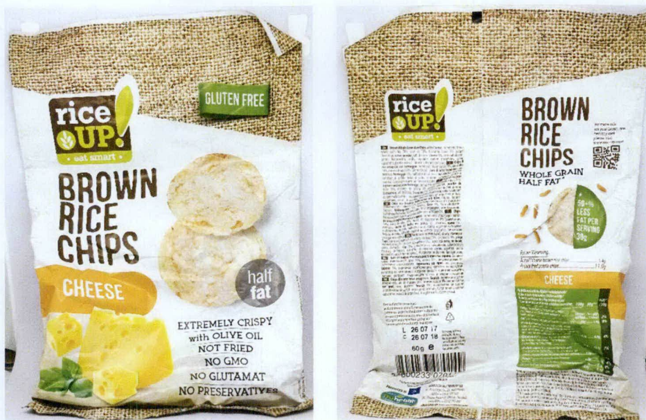
Figure 1. Unregistered RICE UP! Brown Rice Chips Cheese

The Food and Drug Administration (FDA) advises the public against the purchase and consumption of the following unregistered food products and food supplements: