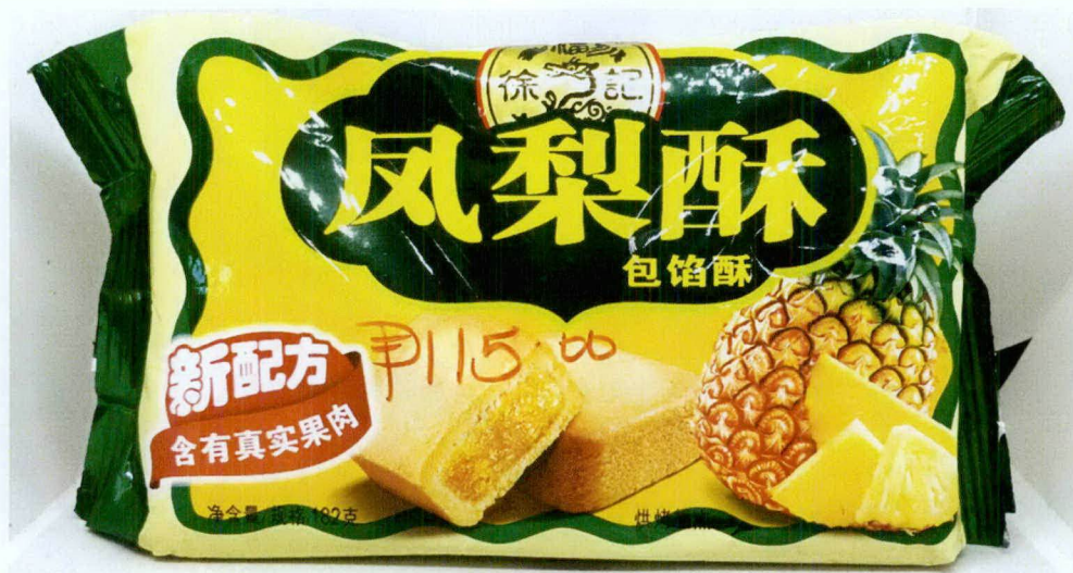
Figure 7. Unregistered Fruit Cake (in foreign language)

FDA post-marketing surveillance (PMS) activities have verified that the abovementioned food products and food supplements have not gone through the registration process of the agency and have not been issued the proper authorization in the form of Certificate of Product Registration. Pursuant to Republic Act No. 9711, otherwise known as the “Food and Drug Administration Act of 2009”, the manufacture, importation, exportation, sale, offering for sale, distribution, transfer, non-consumer use, promotion, advertising or sponsorship of health products without the proper authorization from FDA are prohibited.