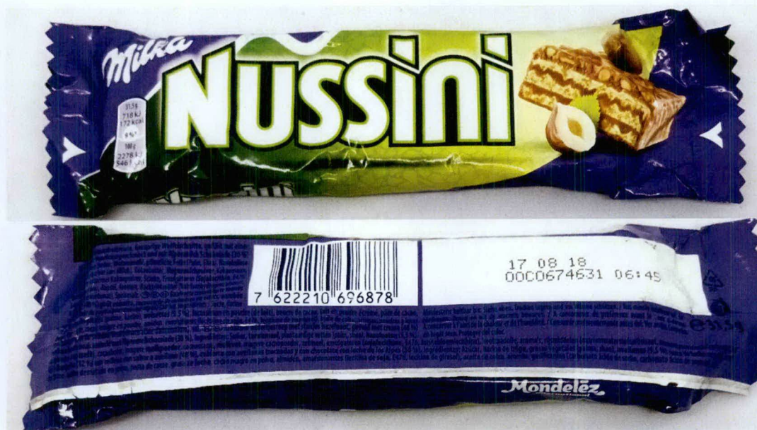
Figure 5. Unregistered MILKA NUSSINI

FDA post-marketing surveillance (PMS) activities have verified that the abovementioned food products have not gone through the registration process of the agency and have not been issued the proper authorization in the form of Certificate of Product Registration. Pursuant to Republic Act No. 9711, otherwise known as the “Food and Drug Administration Act of 2009”, the manufacture, importation, exportation, sale, offering for sale, distribution, transfer, non-consumer use, promotion, advertising or sponsorship of health products without the proper authorization from FDA are prohibited.