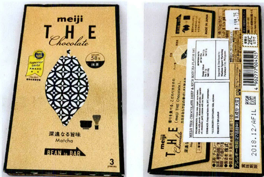
Figure 1. Unregistered MEIJI THE CHOCOLATE Matcha 58% Cacao

The Food and Drug Administration (FDA) advises the public against the purchase and consumption of the following unregistered food products: