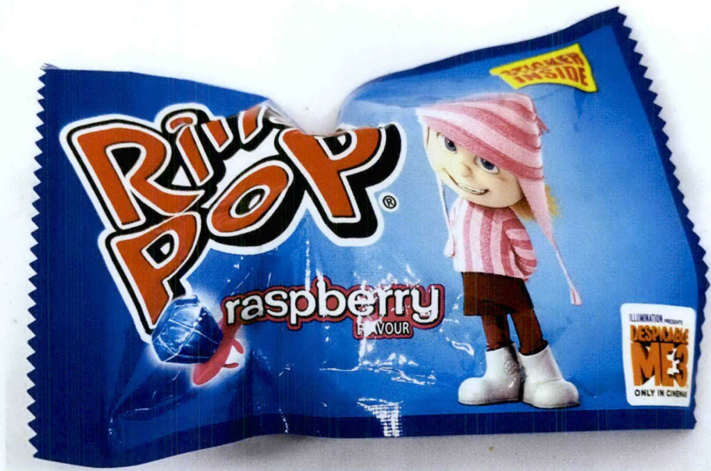
Figure 2. Unregistered RING POP Raspberry Flavour Hard Candy