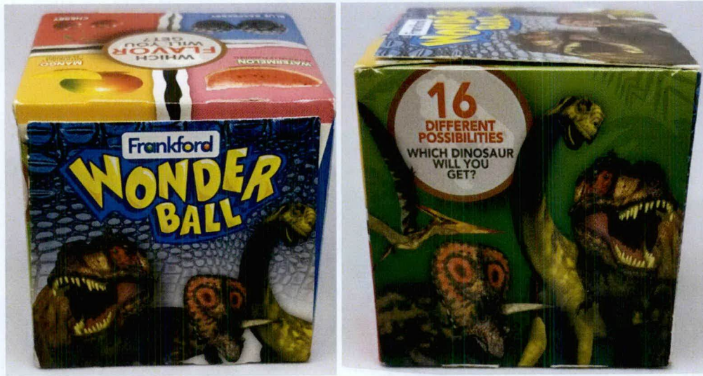
Figure 4. Unregistered FRANKFORD WONDER BALL Milk Chocolate with Candy Inside