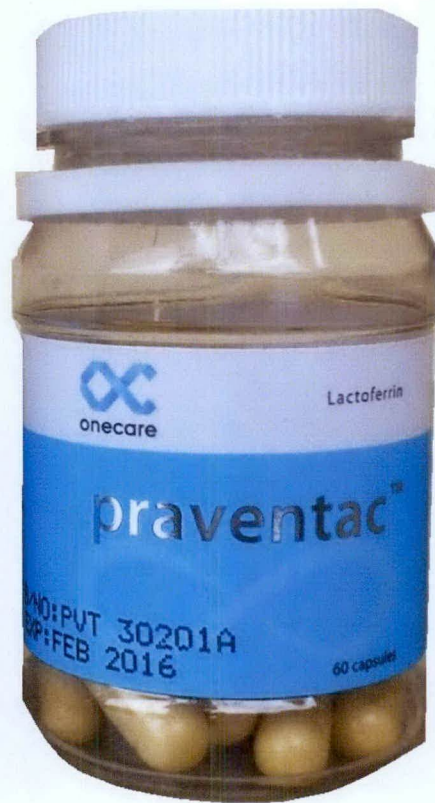
Figure 3. Unregistered ONECARE Lactoferrin Praventac