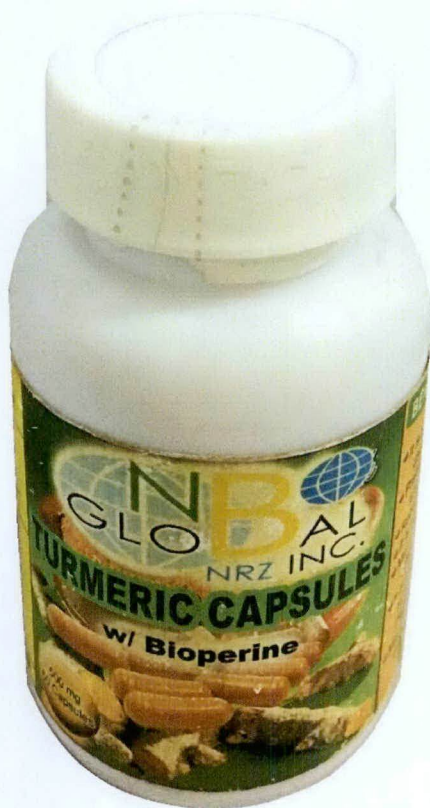
Figure 4. Unregistered NBO GLOBAL NRZ INC. Turmeric Capsule w/ Bioperine