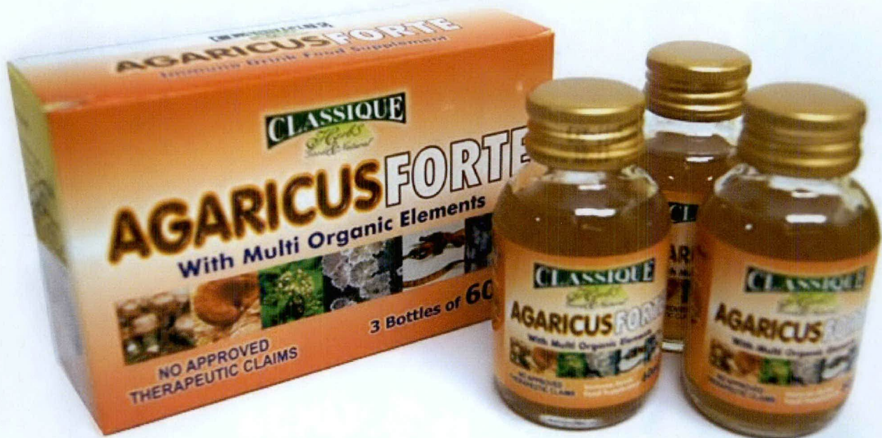
Figure 1. Unregistered CLASSIQUE Agaricus Forte with Multi Organic Elements

The Food and Drug Administration (FDA) advises the public against the purchase and consumption of the following unregistered food products: