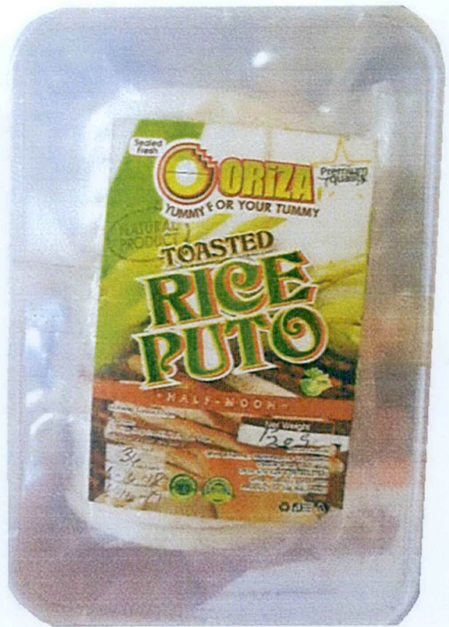
Figure 3. Unregistered ORIZA Toasted Rice Puto