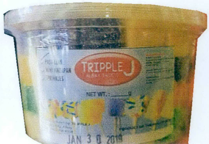
Figure 5. Unregistered TRIPPLE J Albay Sweets Pastillas