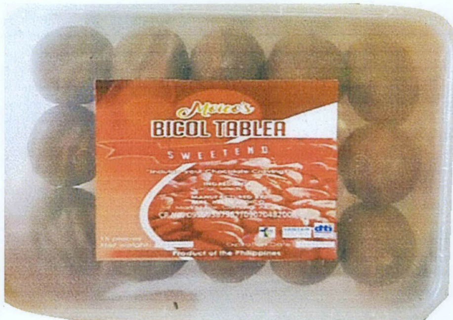
Figure 1. Unregistered MOICO'S Bicol Tablea, Sweetened

The Food and Drug Administration (FDA) advises the public against the purchase and consumption of the following unregistered food products: