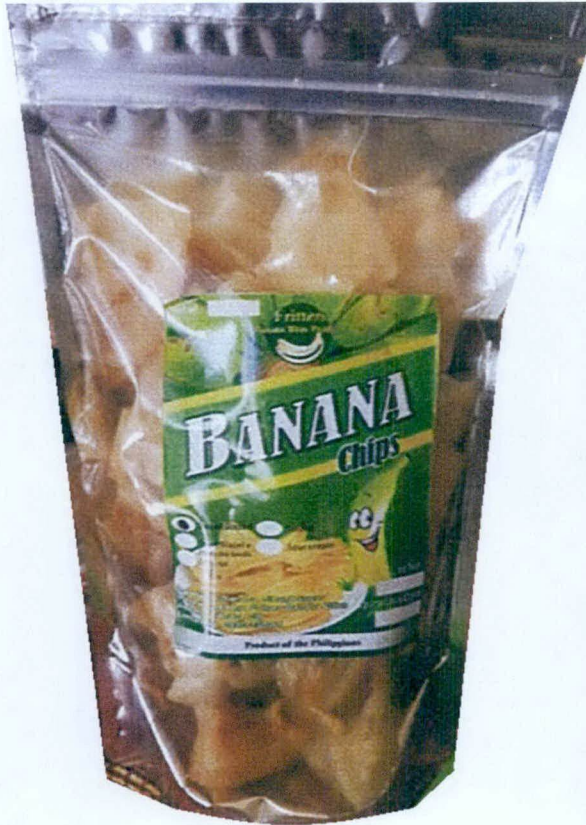
Figure 2. Unregistered FRITTERS BANANA BITES PRODUCTS Banana Chips