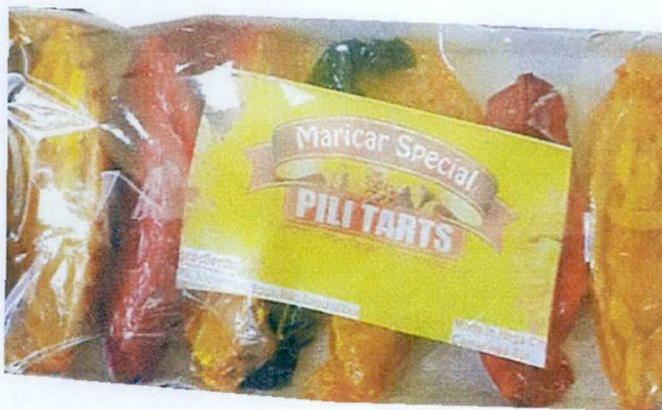
Figure 4. Unregistered MARICAR SPECIAL Pili Tarts