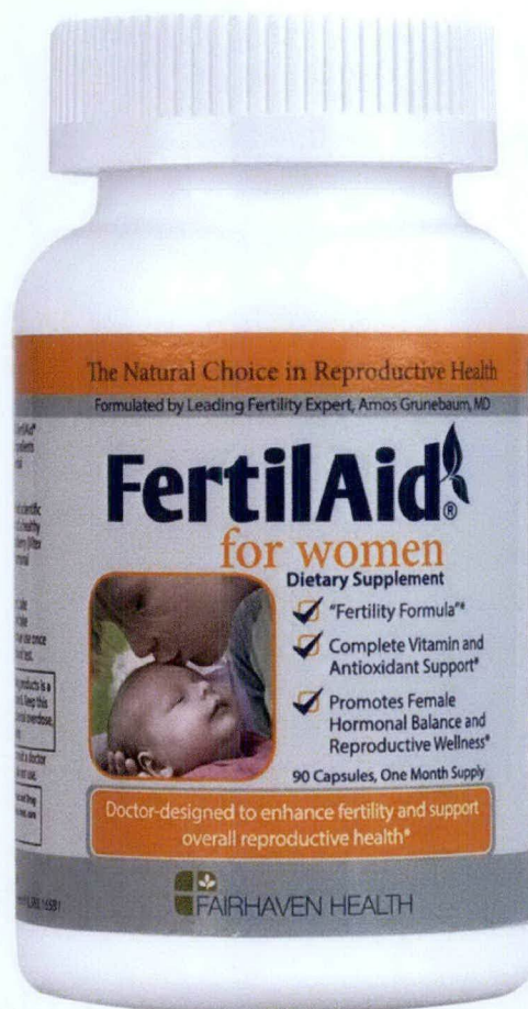
Figure 5. Unregistered FertilAid for Women Dietary Supplement

FDA post-marketing surveillance (PMS) activities have verified that the abovementioned food supplements have not gone through the registration process of the agency and have not been issued the proper authorization in the form of Certificate of Product Registration. Pursuant to Republic Act No. 9711, otherwise known as the “Food and Drug Administration Act of 2009”, the manufacture, importation, exportation, sale, offering for sale, distribution, transfer, non-consumer use, promotion, advertising or sponsorship of health products without the proper authorization from FDA is prohibited.