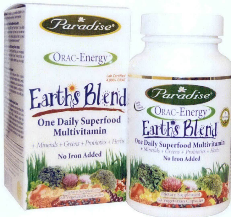
Figure 1. Unregistered PARADISE Orac-Energy Earth's Blend One Daily Superfood Multivitamin

The Food and Drug Administration (FDA) advises the public against the purchase and consumption of the following unregistered food supplements: