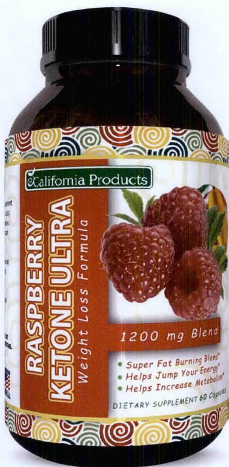
Figure 4. Unregistered CALIFORNIA PRODUCTS Raspberry Ketone Ultra Weight Loss Formula