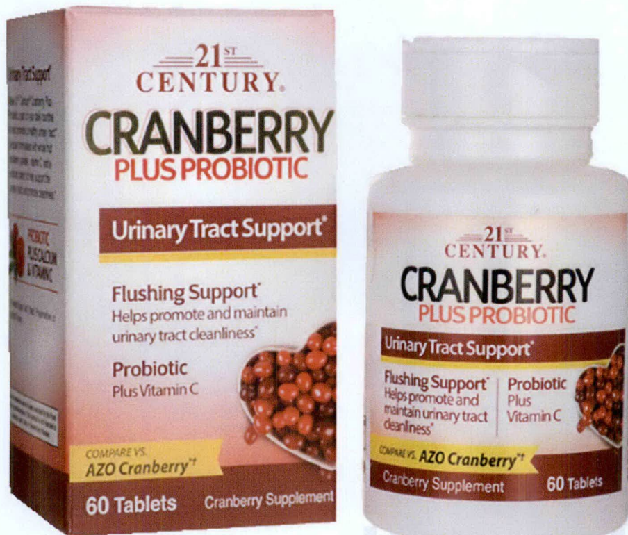
Figure 3. Unregistered 21st CENTURY Cranberry Plus Probiotic Urinary Tract Support