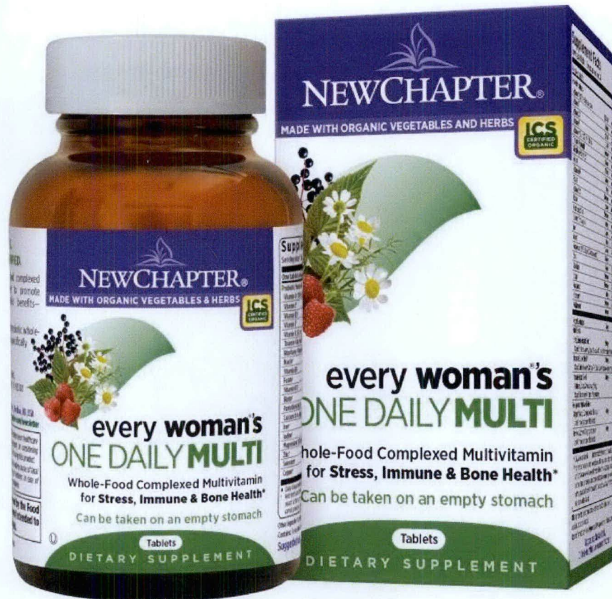
Figure 2. Unregistered NEWCHAPTER Every Woman's One Daily Multi