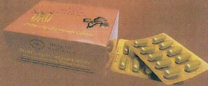
Figure 2. Sample Brochure of Unregistered HEALTH AND NATURALS Prime Lingzhi Cordyceps Veggie Capsules

Storage: Store at temperature not exceeding 30°C