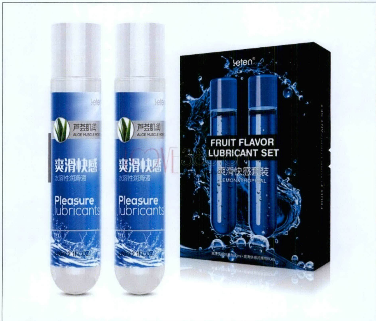
Figure 1. Leten Pleasure Lubricant Set Aloe Muscle Moisten (60ml)

The Food and Drug Administration (FDA) advises the general public and all healthcare professionals against the purchase and use of the unregistered medical device: