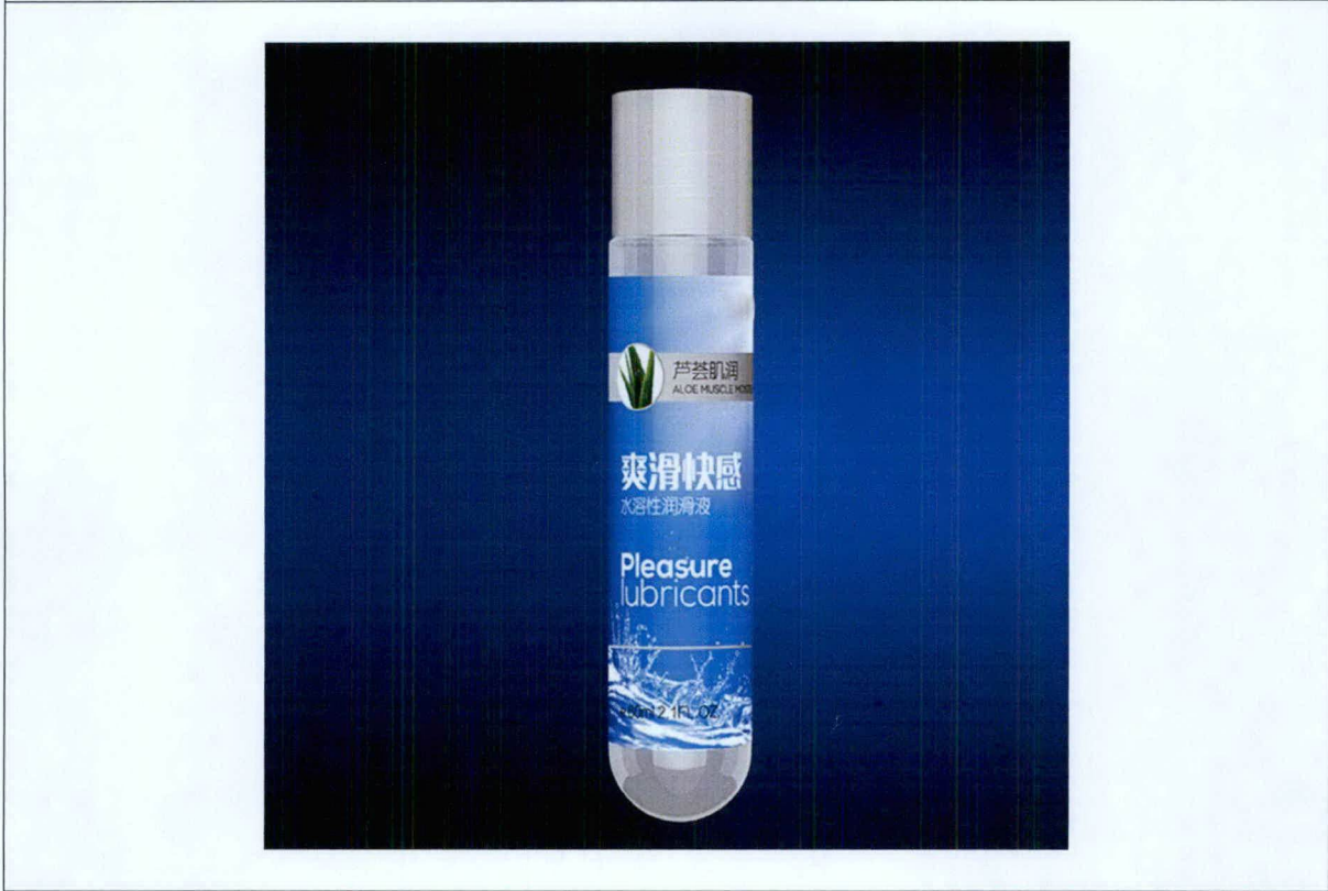
Figure 2. Leten Pleasure Lubricant Set Aloe Muscle Moisten (60ml)