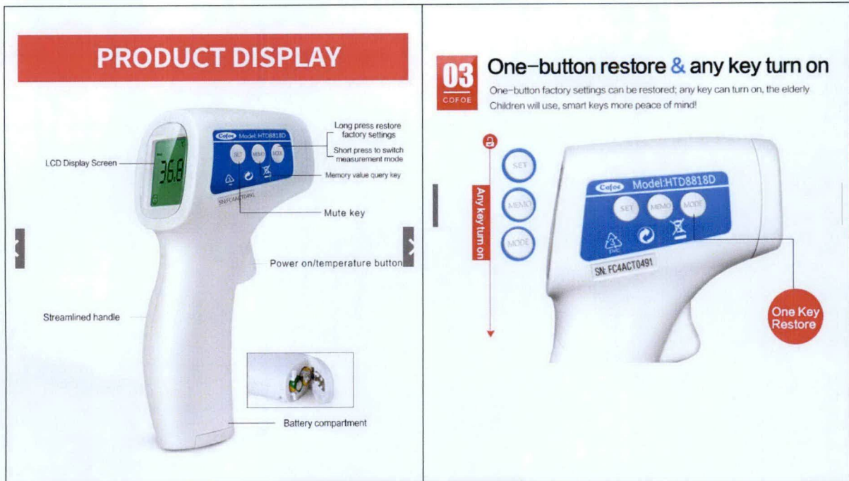
Figure 2. Cofoe Forehead Infrared Thermometer