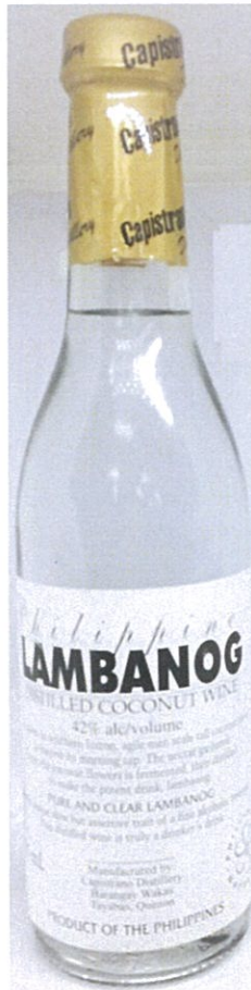
Figure 4. Unregistered CAPISTRANO Philippine Lambanog Distilled Coconut Wine

FDA post-marketing surveillance (PMS) activities have verified that the abovementioned food products have not gone through the registration process of the agency and have not been issued the proper authorization in the form of Certificate of Product Registration. Pursuant to Republic Act No. 9711, otherwise known as the “Food and Drug Administration Act of 2009”, the manufacture, importation, exportation, sale, offering for sale, distribution, transfer, non-consumer use, promotion, advertising or sponsorship of health products without the proper authorization from FDA are prohibited.