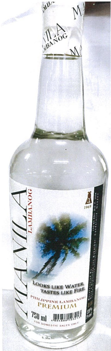
Figure 2. Unregistered MANILA Lambanog 80% Proof