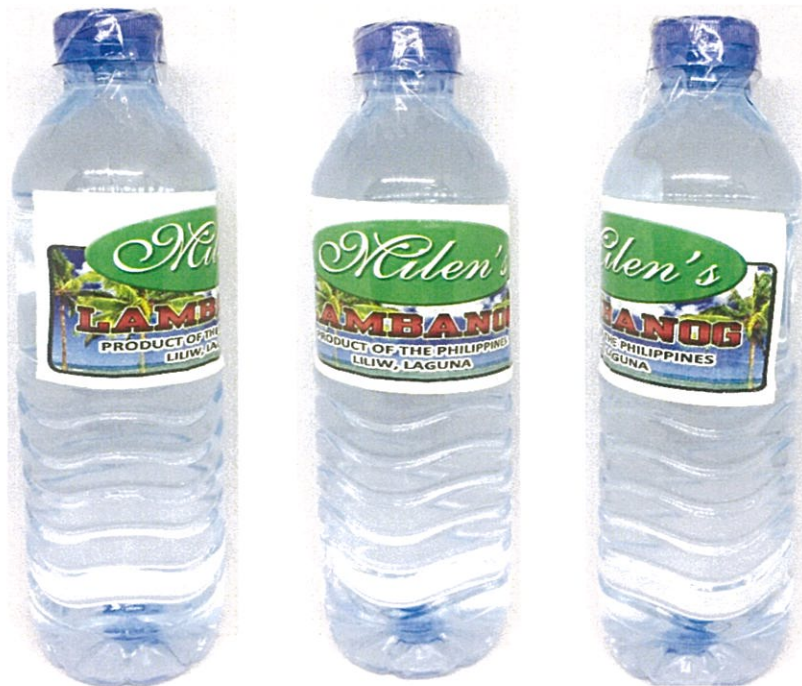
Figure 1. Unregistered MILEN'S Lambanog

The Food and Drug Administration (FDA) advises the public against the purchase and consumption of the following unregistered food products: