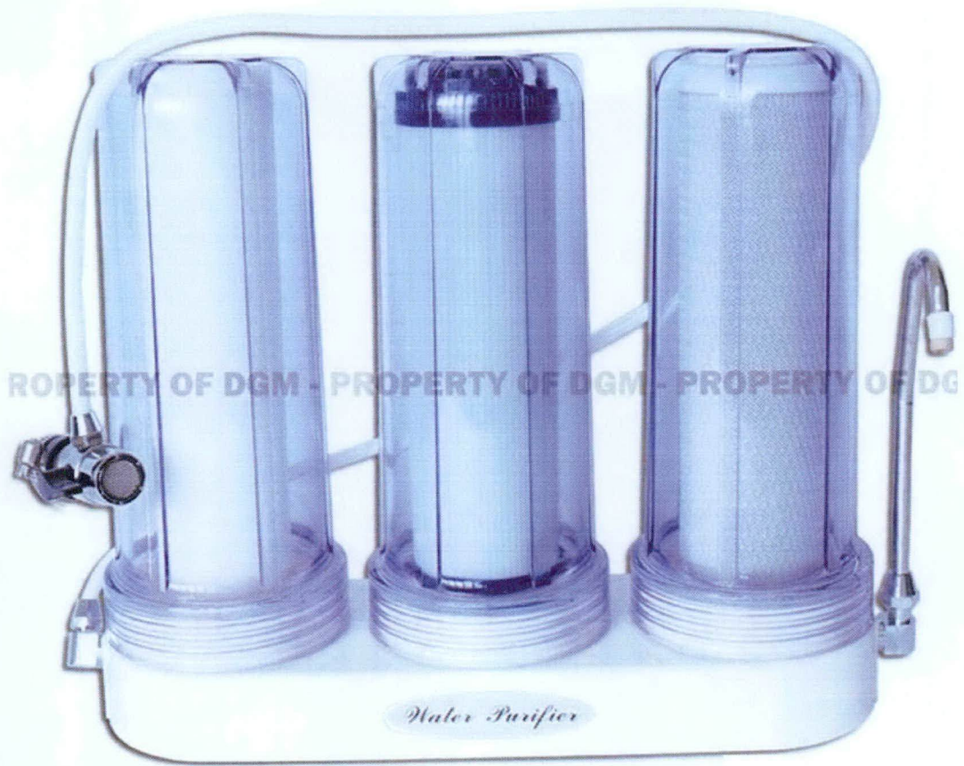
Figure 3. Global 3 in 1 Water Purifier