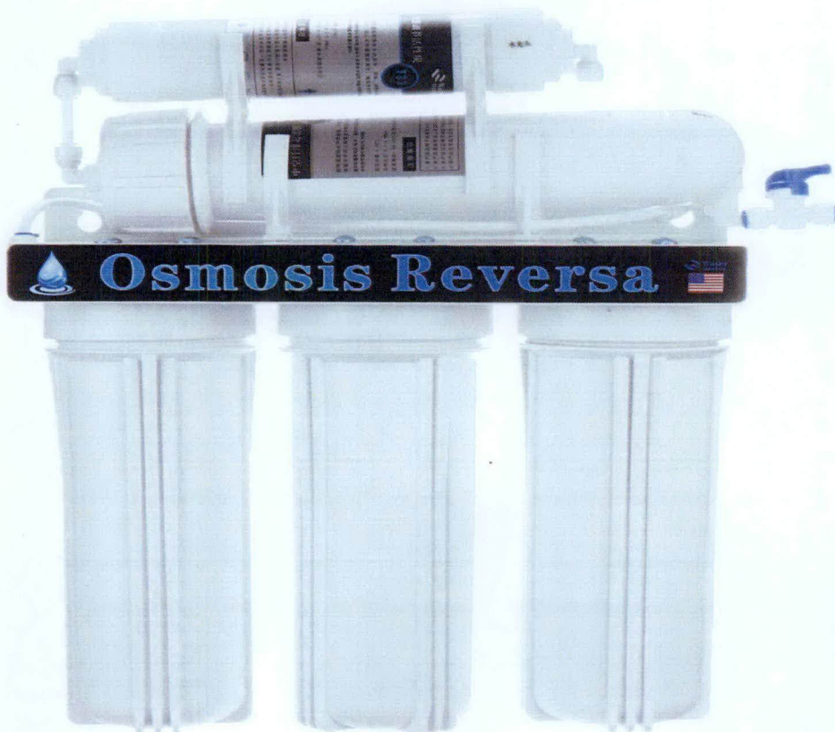
Figure 6. Premium 5 Stage Under Sink Water Filter Drinking Home RO Membrane Purifier