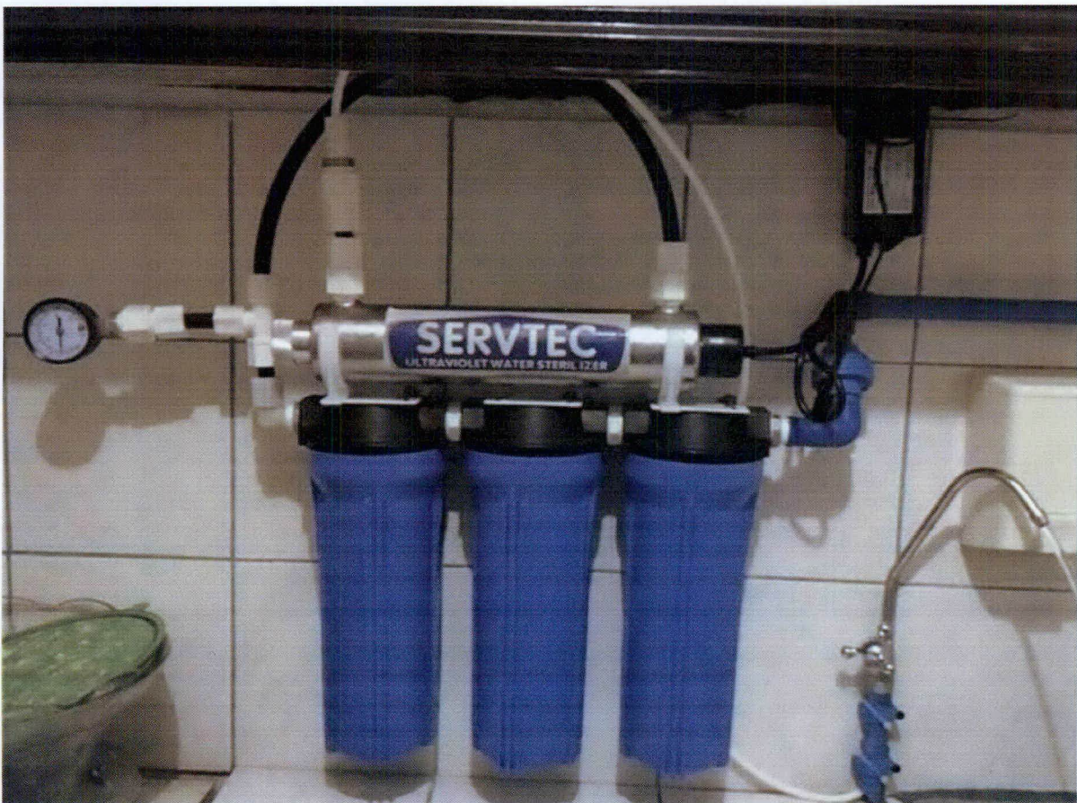
Figure 4. Netwire Direct Alkaline Water Purifier with Ultraviolet Lamp