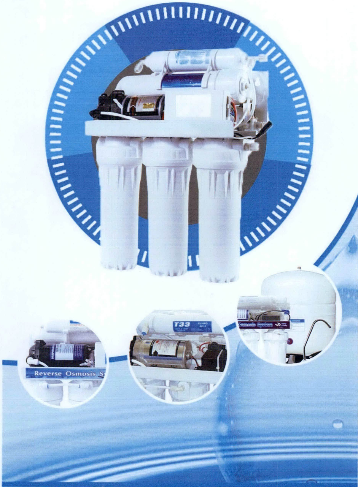
Figure 2. Central Nanyang 5-Stage Reverse Osmosis Water Filtration System Ultra Safe with Tank and Pump