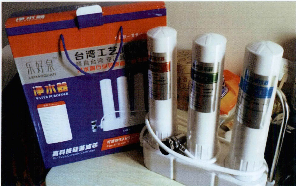
Figure 1. High Quality 3 in 1 Alkaline Water Purifier Complete Set

The Food and Drug Administration (FDA) advises the general public against the purchase and use of the following unregistered health related device products.