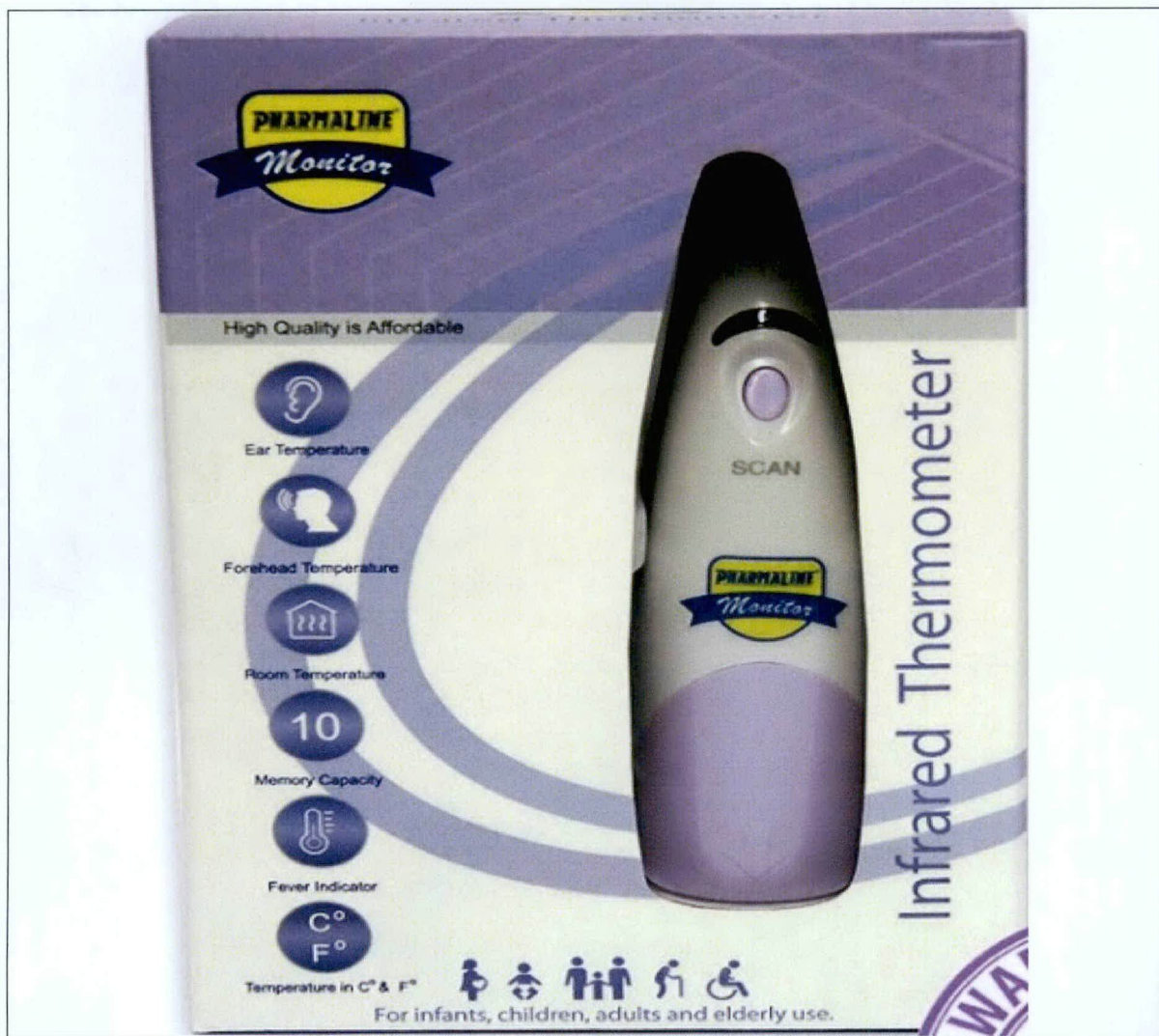
Figure 1. Pharmaline Monitor Infrared Thermometer

The Food and Drug Administration (FDA) advises the general public and all healthcare professionals against the purchase and use of the unregistered medical device: