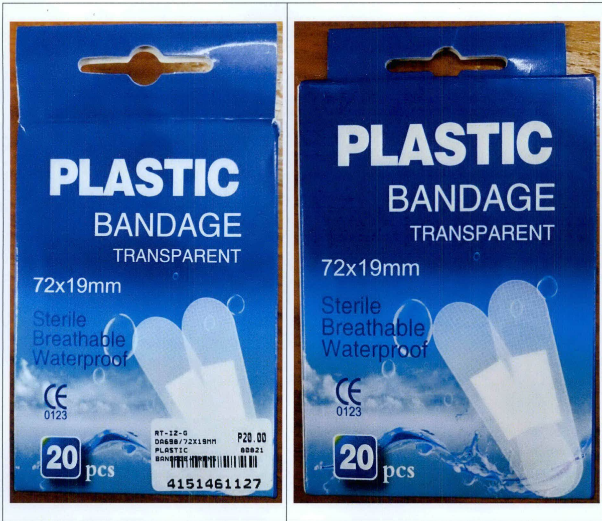
Figure 2. First+Aid Plastic Bandage Transparent 72x19mm Sterile Breathable Waterproof

FDA post-marketing surveillance (PMS) activities have verified that the abovementioned medical device has not gone through the registration process of the agency and has not been issued with proper authorization in the form of Certificate of Product Registration (CPR). Pursuant to Republic Act 9711, otherwise known as the “Food and Drug Administration Act of 2009”, the manufacture, importation, exportation, sale, offering for sale, distribution, transfer, non-consumer use, promotion, advertising or sponsorship of health products without the proper authorization from FDA is prohibited.