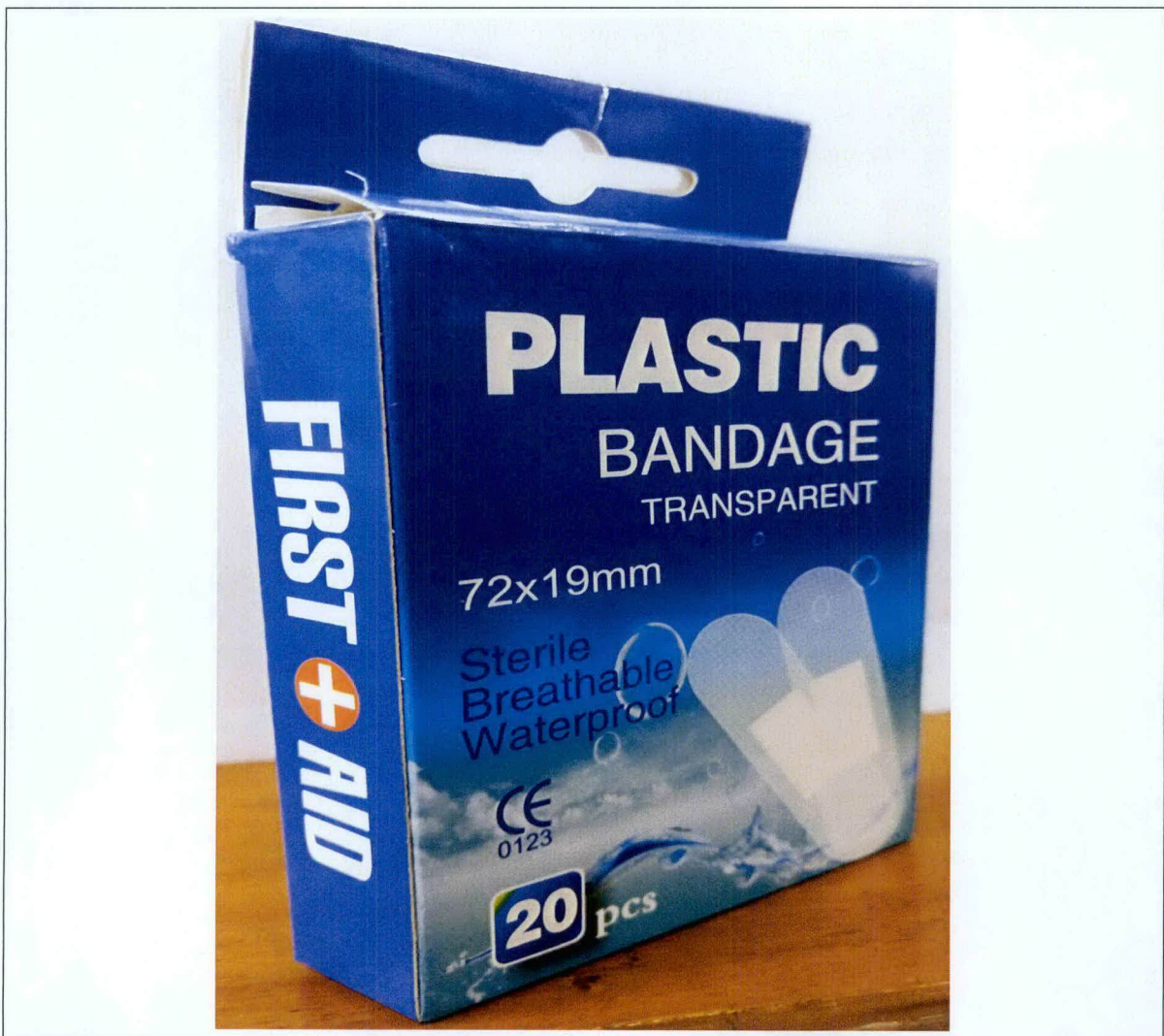
Figure 1. First+Aid Plastic Bandage Transparent 72x19mm Sterile Breathable Waterproof

The Food and Drug Administration (FDA) advises the general public and all healthcare professionals against the purchase and use of the unregistered medical device: