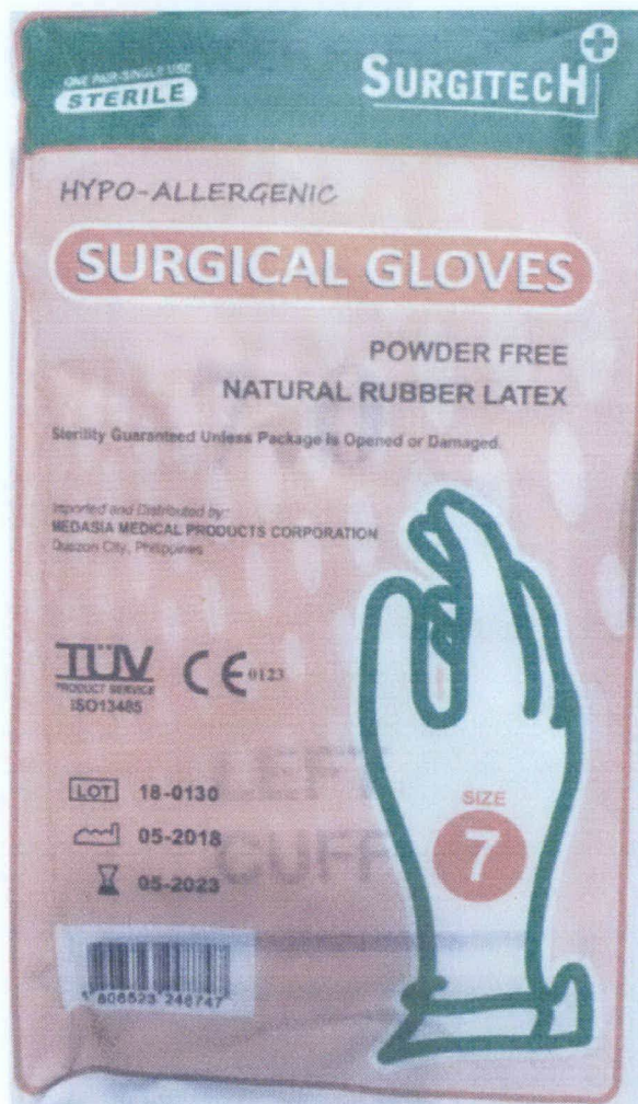
Surgitech Hypo-Allergenic Surgical Gloves (Powder Free)

The Food and Drug Administration (FDA) advises all concerned healthcare professionals and the public against the purchase and use of Surgitech Hypo-Allergenic Surgical Gloves (Powder Free) (see picture below).