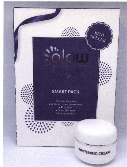
Glow Skin White French Technology Smart Pack – Whitening Cream