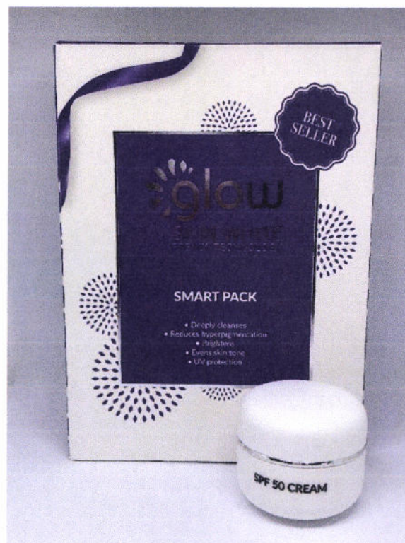
Glow Skin White French Technology Smart Pack – Whitening Cream