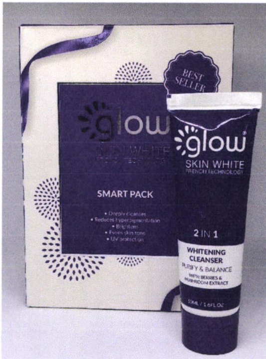
Glow Skin White French Technology Smart Pack – Whitening Cleanser

Please attach the pictures of products clearly from different sides of packaging that contain information of the product, including primary packaging, secondary packaging, labels, or brochure (if any)