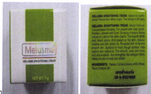
4. Melusma Melasma Brightening Cream