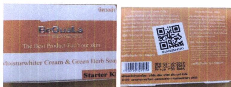
6. BeQuaLa Beauty Quality Lab