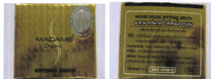
2.Madame Organic Whitening Arbutin