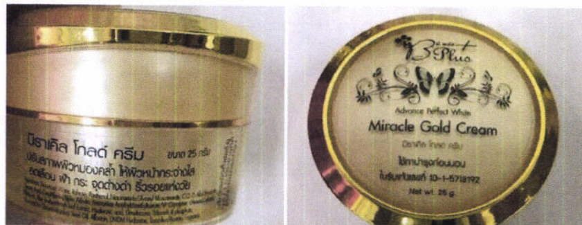
1.B Plus Miracle Gold Cream

Please attach the pictures of products clearly from different sides of packaging that contain information of the product, including primary packaging, secondary packaging, labels, or brochure (if any)