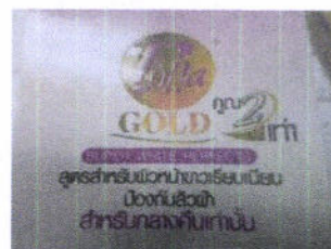
8. Polla Gold Super White Perfects