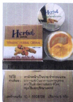
3.Herbal Turmeric Herbal Cream