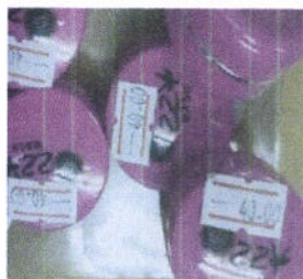
7. Ozzy Mask