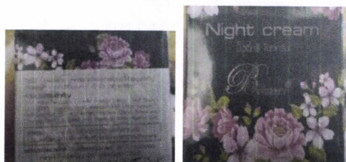
5. Beauty 3 Night Cream