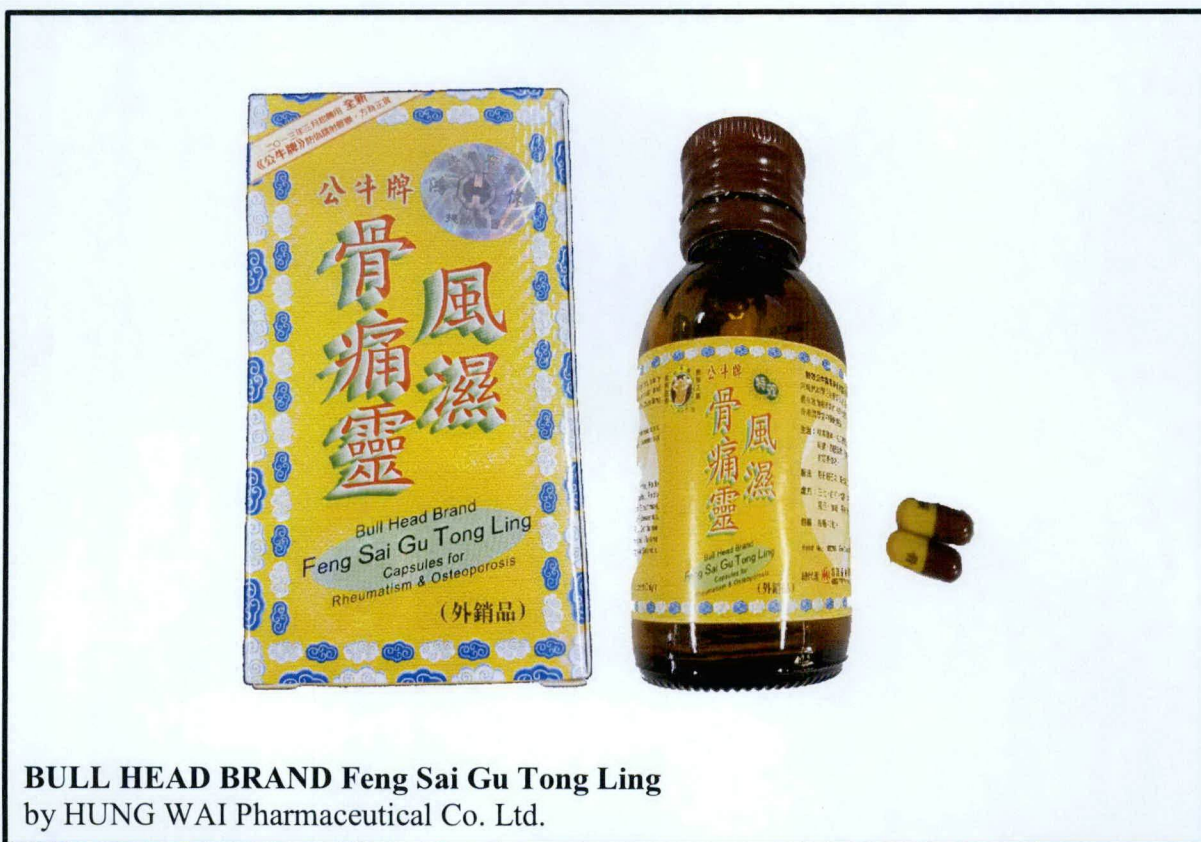
BULL HEAD BRAND Feng Sai Gu Tong Ling by HUNG WAI Pharmaceutical Co. Ltd.