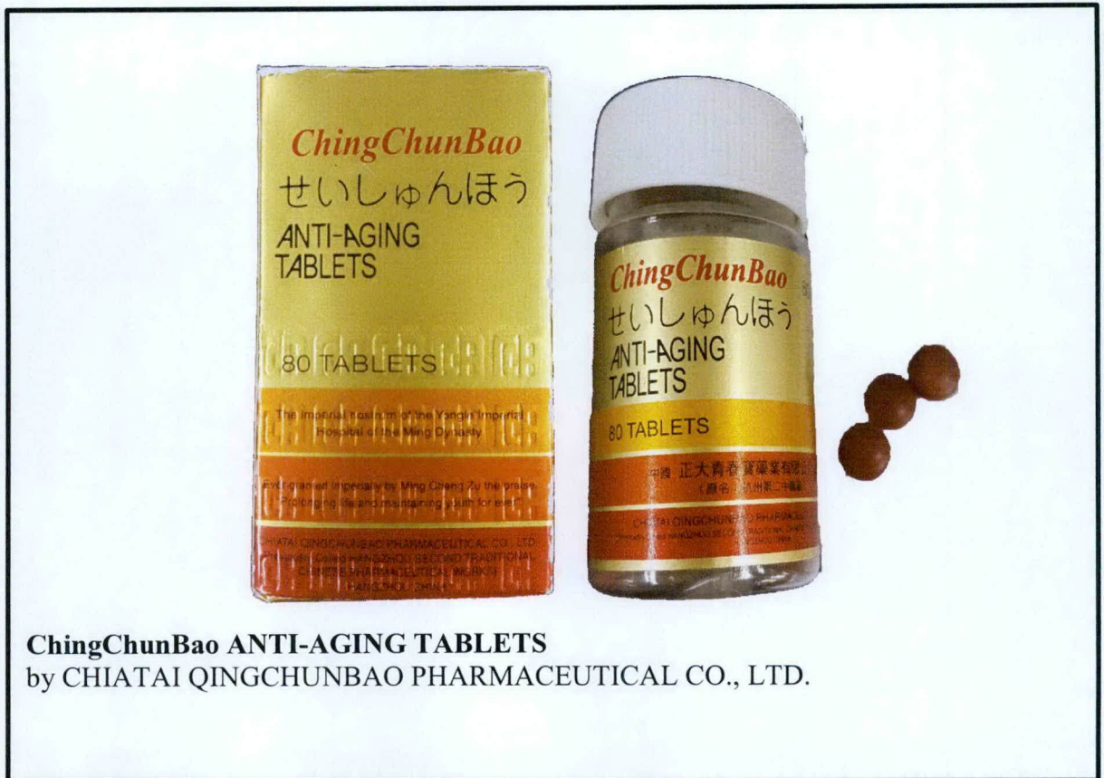
Figure 6. Unregistered drug product

FDA Post-Marketing Surveillance (PMS) activities have verified that the abovementioned drug products have not gone through the registration process of the agency and have not been issued with proper authorization in the form of Certificate of Product Registration.