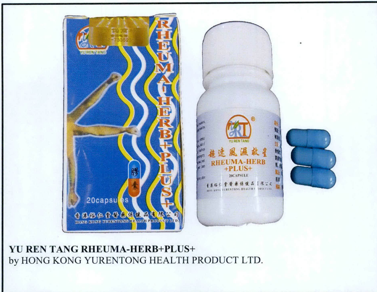
YU REN TANG RHEUMA-HERB+PLUS+ by HONG KONG YURENTONG HEALTH PRODUCT LTD.