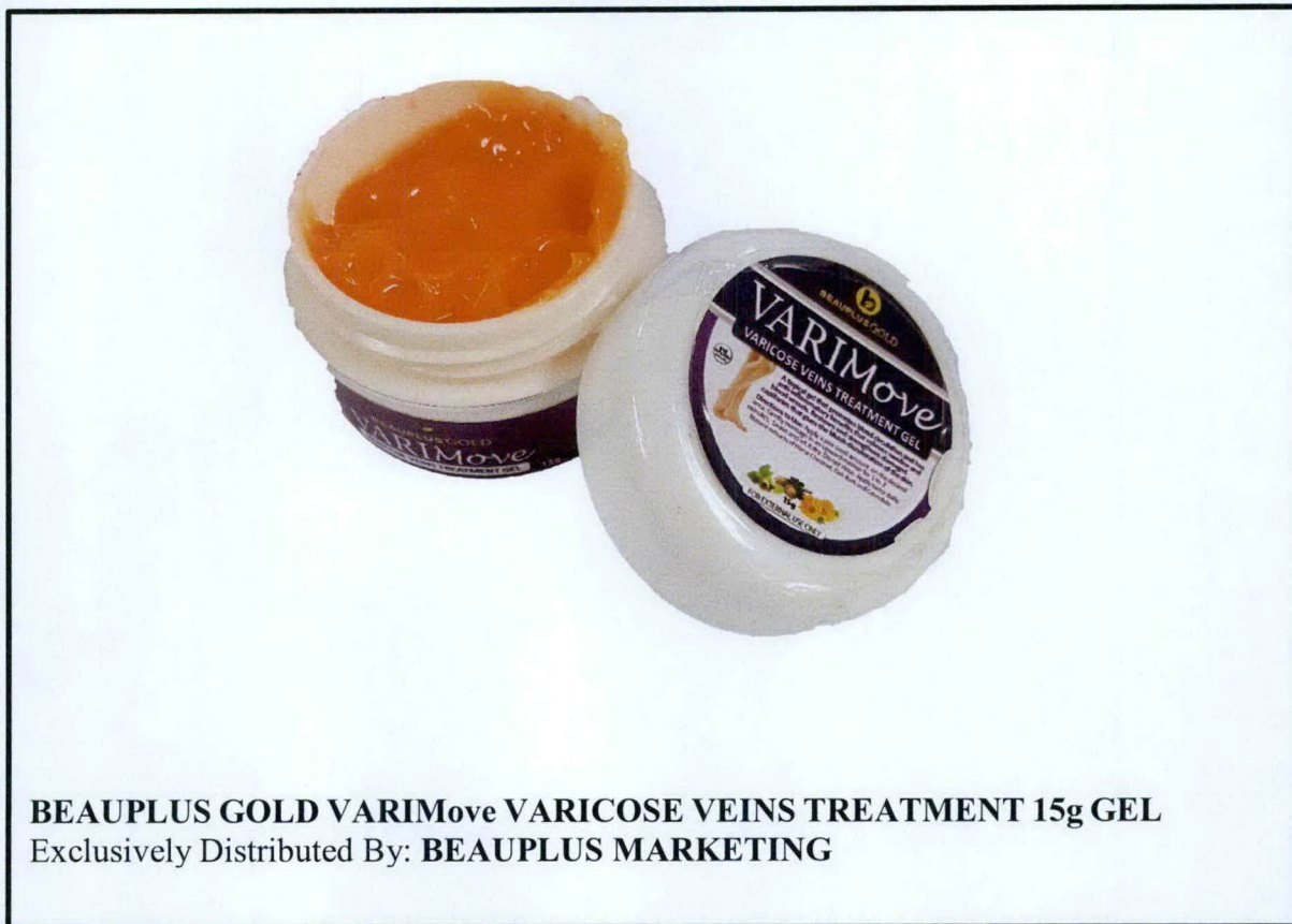
Figure 6. Unregistered drug product

FDA Post-Marketing Surveillance (PMS) activities have verified that the abovementioned drug products have not gone through the registration process of the agency and have not been issued with proper authorization in the form of Certificate of Product Registration.