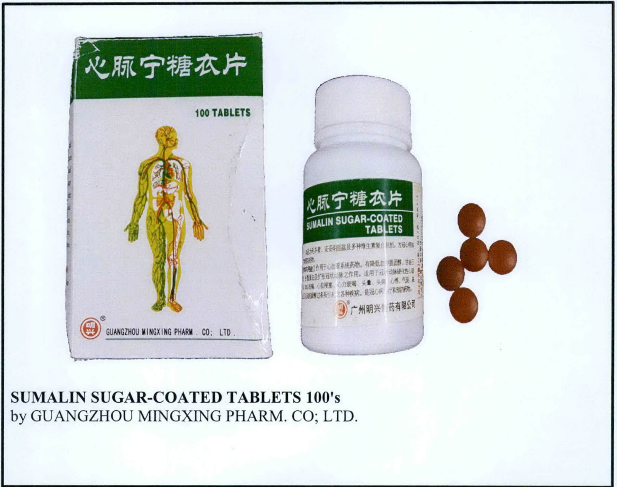
SUMALIN SUGAR-COATED TABLETS 100's by GUANGZHOU MINGXING PHARM. CO.; LTD.