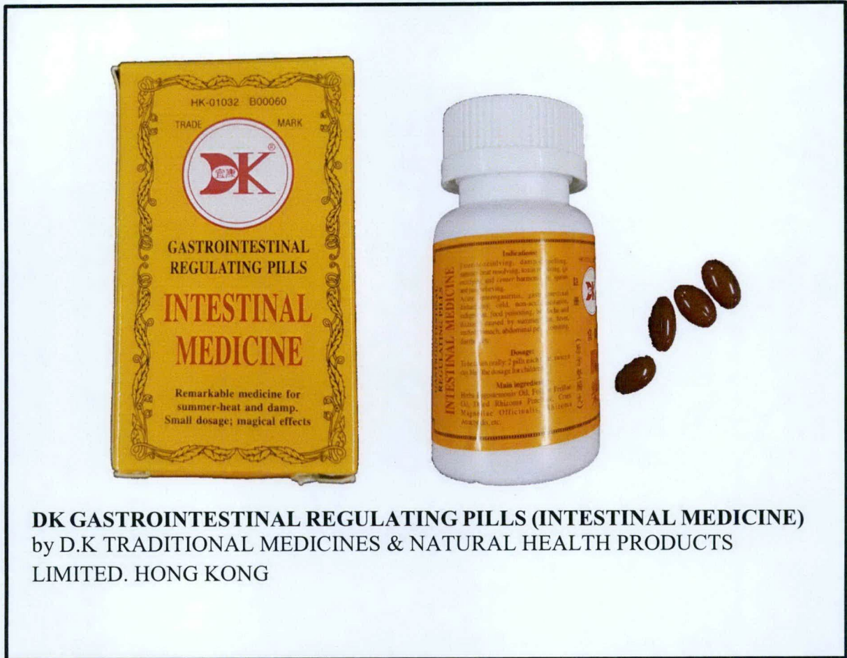
DK GASTROINTESTINAL REGULATING PILLS (INTESTINAL MEDICINE) by D.K TRADITIONAL MEDICINES & NATURAL HEALTH PRODUCTS LIMITED. HONG KONG