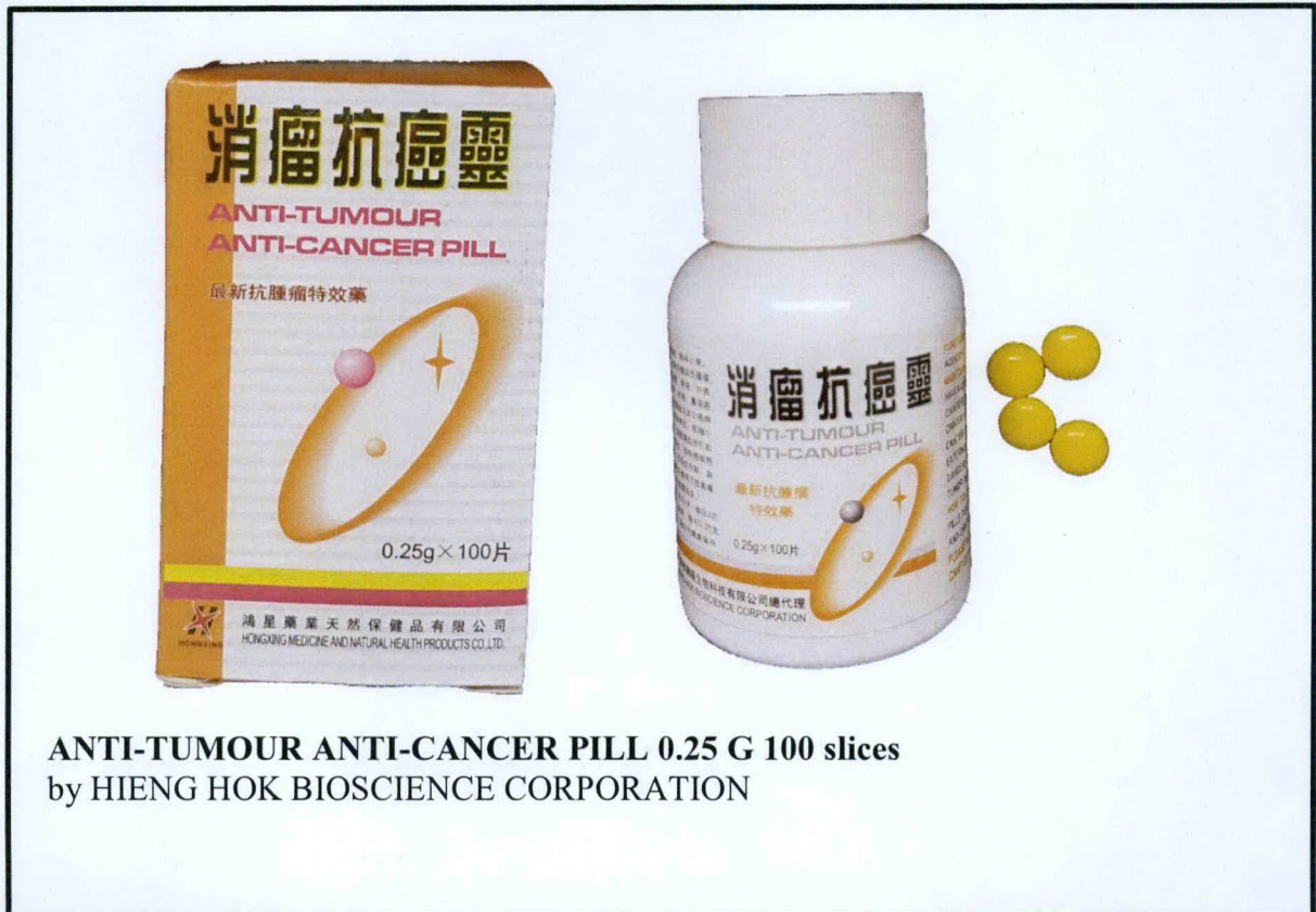
ANTI-TUMOUR ANTI-CANCER PILL 0.25 G 100 slices by HIENG HOK BIOSCIENCE CORPORATION