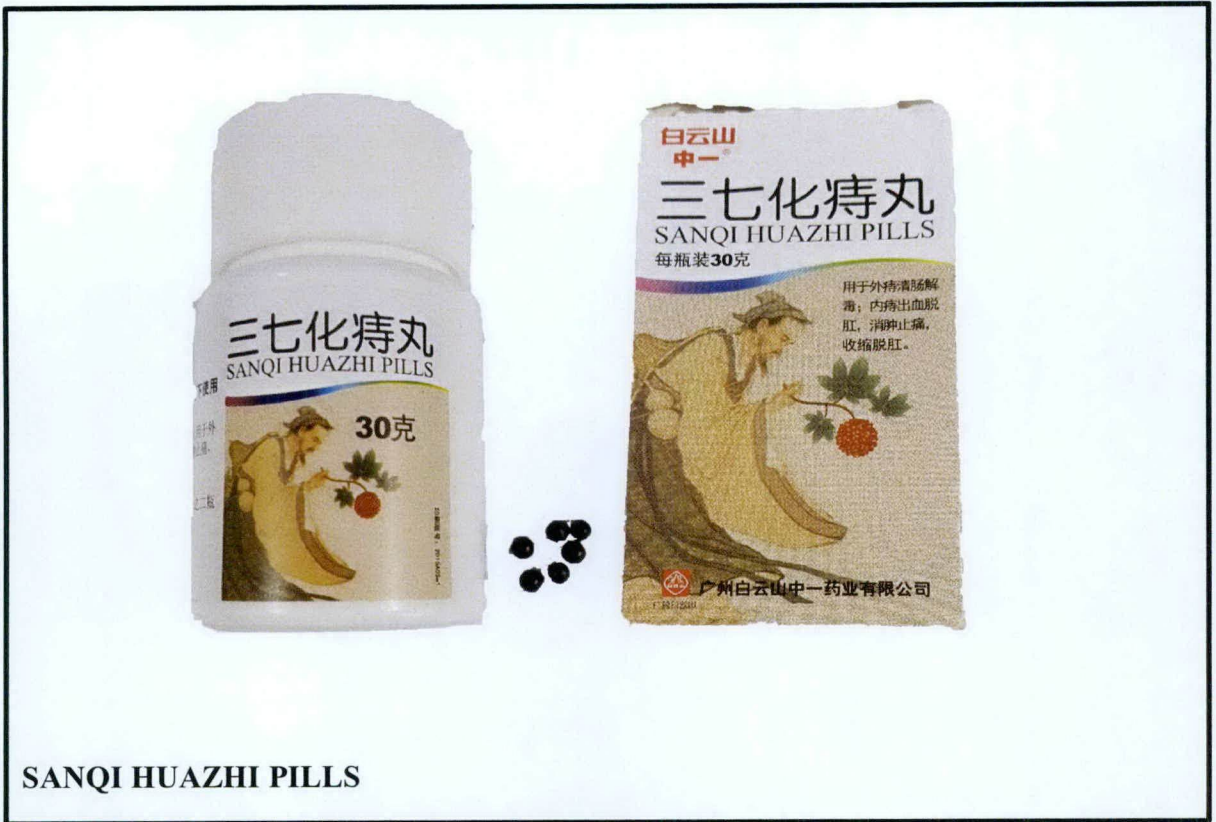
SANQI HUAZHI PILLS