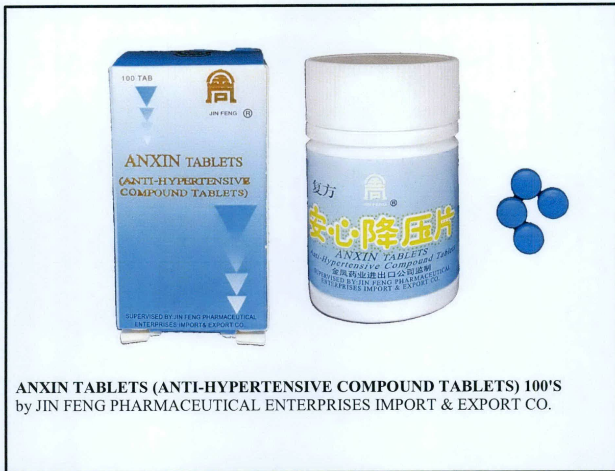
Figure 6. Unregistered drug product

FDA Post-Marketing Surveillance (PMS) activities have verified that the abovementioned drug products have not gone through the registration process of the agency and have not been issued with proper authorization in the form of Certificate of Product Registration.