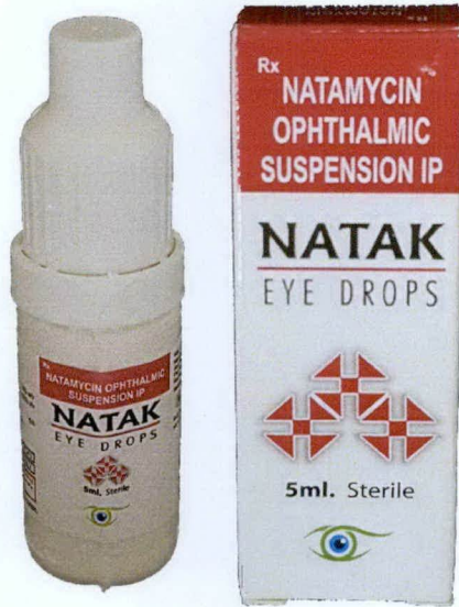
NATAMYCIN OPHTHALMIC SUSPENSION IP (NATAK) EYE DROPS 5ml Marketed by: PHARMTAK Ophthalmics I) Pvt. Ltd. 50-52, The Discovery, Borivali (E) Mumbai - 400 066