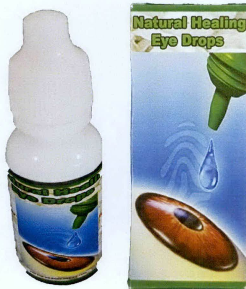
Natural Healing Eye Drops Manufactured by: Heal the World Foundation