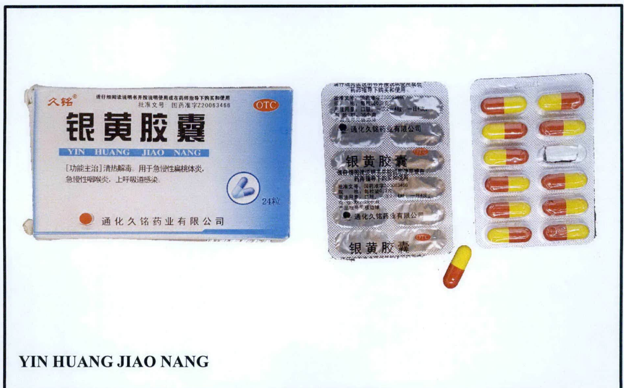
Figure 3. Unregistered drug product