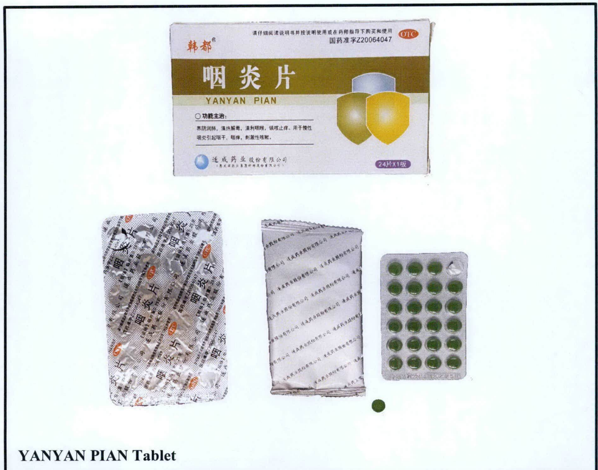
Figure 2. Unregistered drug product