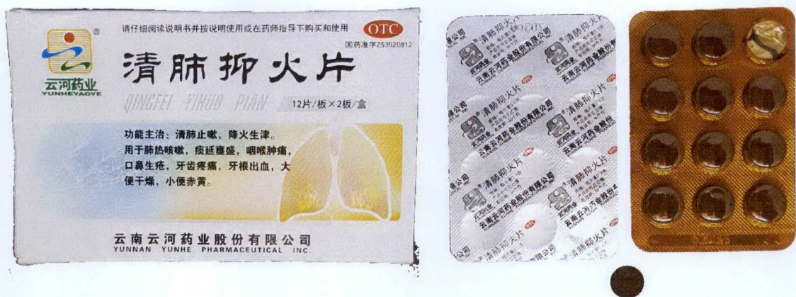
QINGFEI YIHUO PIAN Tablets by YUNNAN YUNHE PHARMACEUTICAL INC.