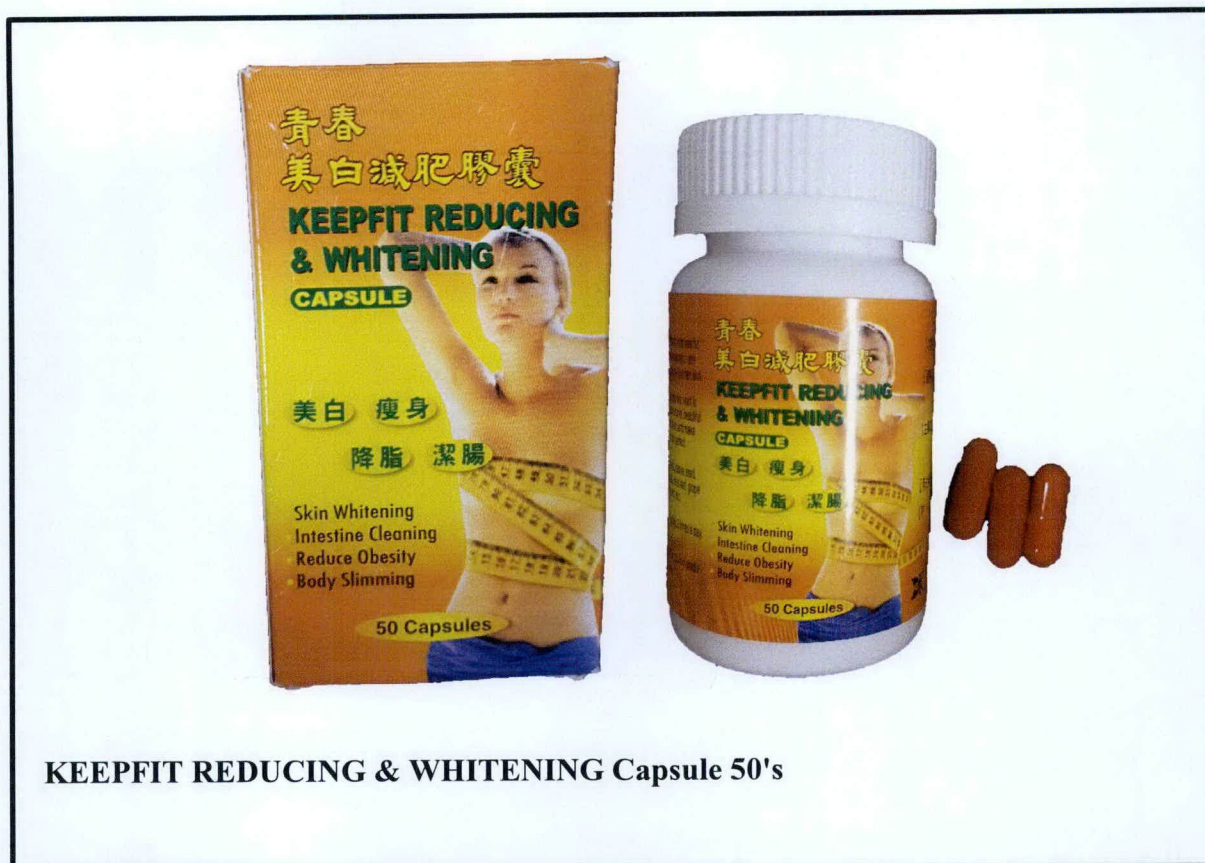
Figure 6. Unregistered drug product

FDA Post-Marketing Surveillance (PMS) activities have verified that the abovementioned drug products have not gone through the registration process of the agency and have not been issued with proper authorization in the form of Certificate of Product Registration.