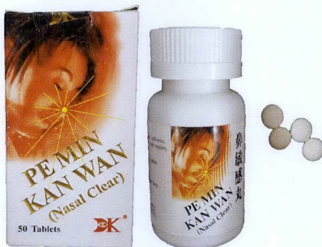
PE MIN KAN WAN (Nasal Clear) 50 Tablets by D.K. TRADITIONAL MEDICINES & NATURAL HEALTH PRODUCTS LIMITED